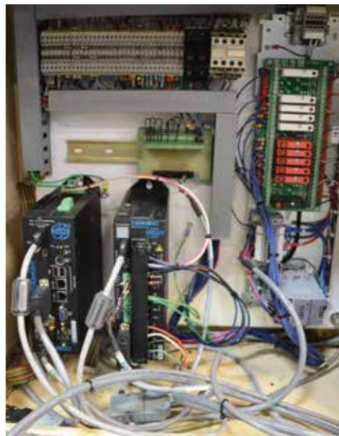
Actual BH2000 main control cabinet with new registration controls upgrade installed.

The BH2000 RCU has been designed to enable fast conversions. Removal of existing GEN III components and installation of the new RCU components can be completed by B & H Field Service Engineers in four to six hours. Once the new RCU components are in place, our field service engineers will test and demonstrate the new system and then train your personnel on how to use it. Since all GEN III terminology is used in the BH2000 RCU training is quickly accomplished.