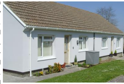
Above: Insulation works, Fivehead (Completed)

We have successfully won another contract for a new client to the Exeter team. The works involve external insulation to 21 bungalows, including new gutter, downpipes, window cills and associated works. To date, the works have continued well and at a good pace.