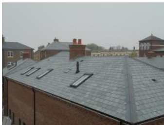
Above: Poundbury, Dorset