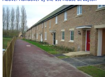
Above: Lufton Village, Yeovil