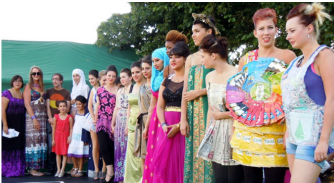
Global Fashion Show, one of the local activities that has benefitted from Localgiving.com