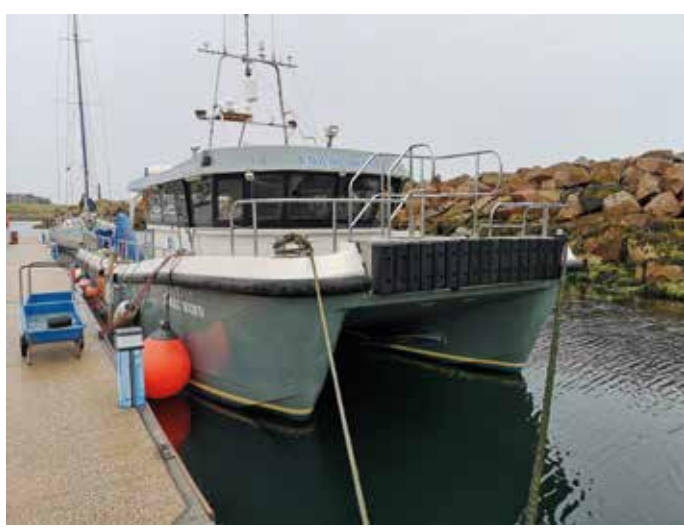
MV Coral Wind

The Edgetech 6205, a combined MBES and SSS system, was vessel mounted through a moonpool in the centre of the vessel. The use of vessel mounted SSS removed positional uncertainties associated with layback positioning in shallow water.