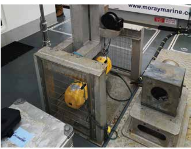
Moonpool deployed Edgetech 6205 (MBES/SSS)

iSURVEY was contracted to perform an acoustic inspection and cathodic protection survey of the 30" gas export line from Beryl Alpha to St Fergus Terminal (KP0.000 to KP3.100) at the St Fergus Landfall, North East Scotland.