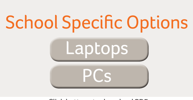
Click buttons to download PDFs

Two new arrangements for sourcing PC and Laptop requirements have recently become available for schools to use. The first arrangement is for standard and high-spec PC's and Laptops, designed to meet school's requirements. The second arrangement, which is available to all Public Sector Bodies, gives access to five different PC and Laptop options. Both arrangements allow for schools to directly source their needs from the appointed suppliers – in practical terms, this means that the procurement process has already been concluded and that once schools have browsed the options, orders can be placed within a defined engagement process. It's not a question of the specs available under the school specific contracts being superior or inferior to those now available in the new Public Sector Framework. Schools themselves will need to make the call as to which of the available packages is most attractive to meeting their specific needs, having balanced technical and value-for-money considerations.