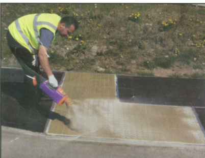
9 Broadcasting kiln dried sand