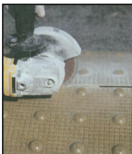
3 Cutting tiles