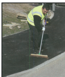
1 Surface preparation