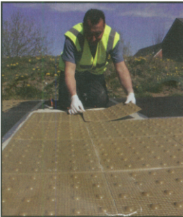
8 Applying tiles