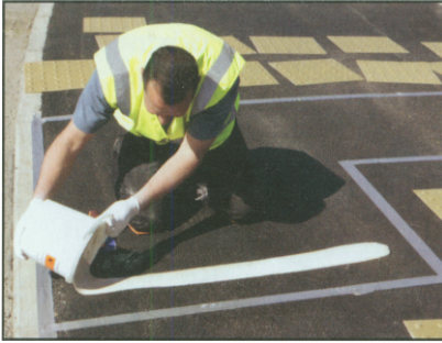
6 Pouring adhesive