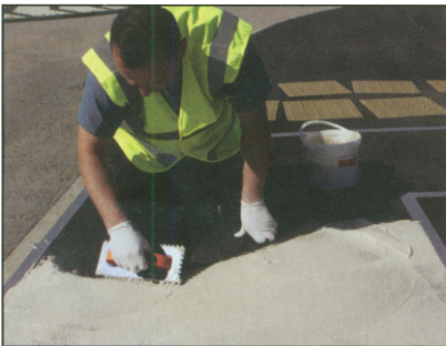
7 Screeding adhesive