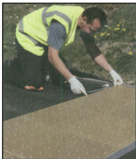
4 Applying duct tape