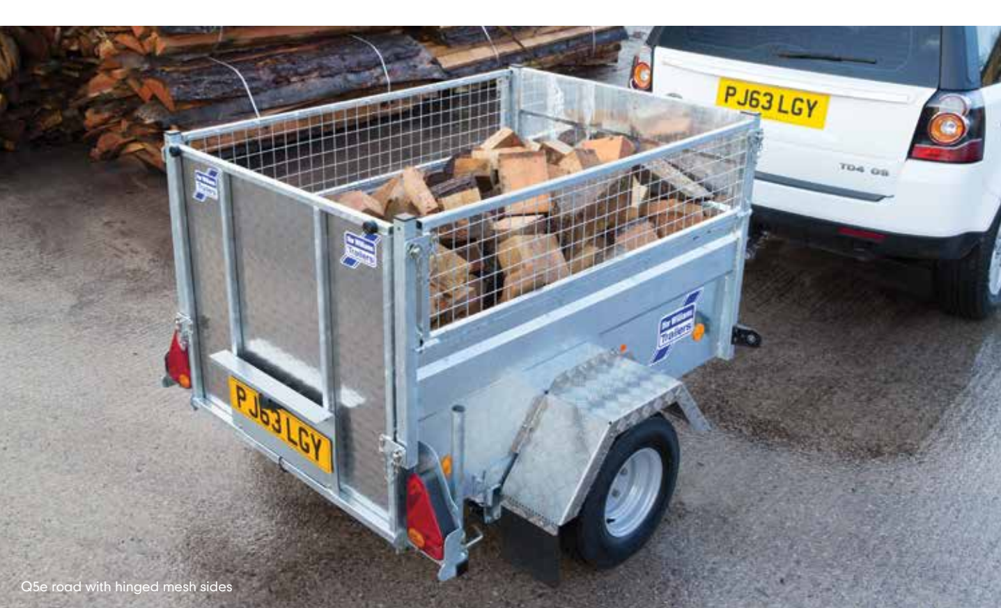
Q5e road with hinged mesh sides