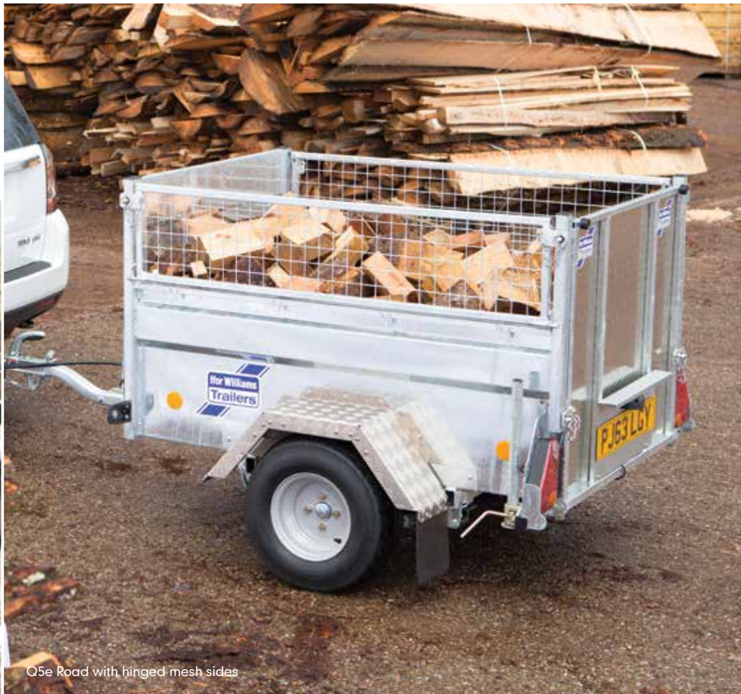
Q5e Road with hinged mesh sides

*Please check towing vehicle manufacturer's handbook for maximum unbraked towing limit.