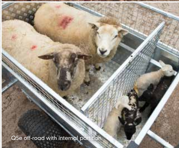
Q5e off-road with internal partition

The option of an internal partition easily positioned at different points allows lambs on one side and ewes the other – safer transport for all animals.