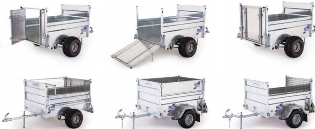
Q5 Q5e off-road and road versions showing different ramp, hinged sides and internal partition options