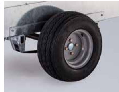
Q5/6/7e off-road flotation tyres (20.5 x 8-10)