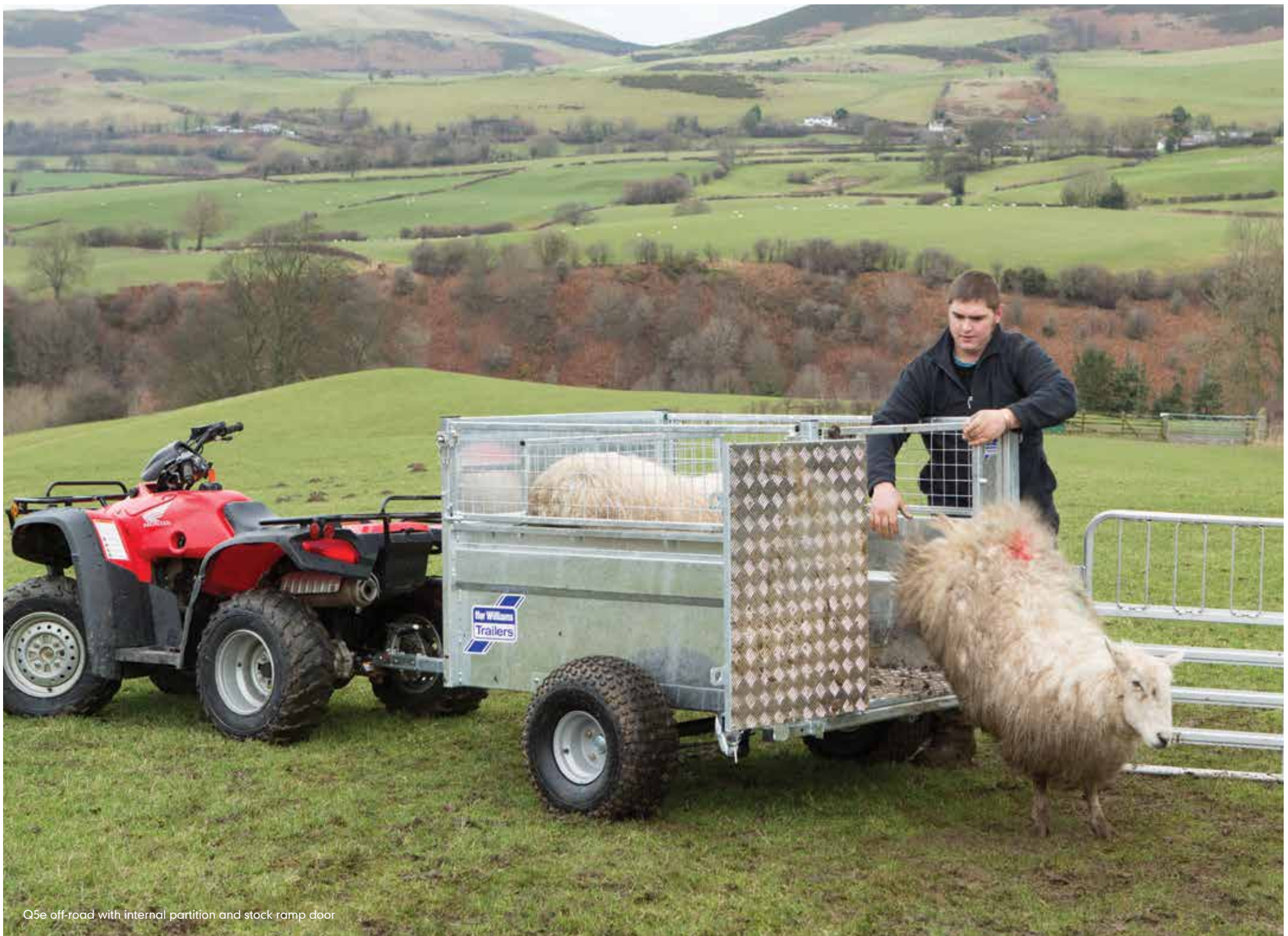
Q5e off-road with internal partition and stock ramp door