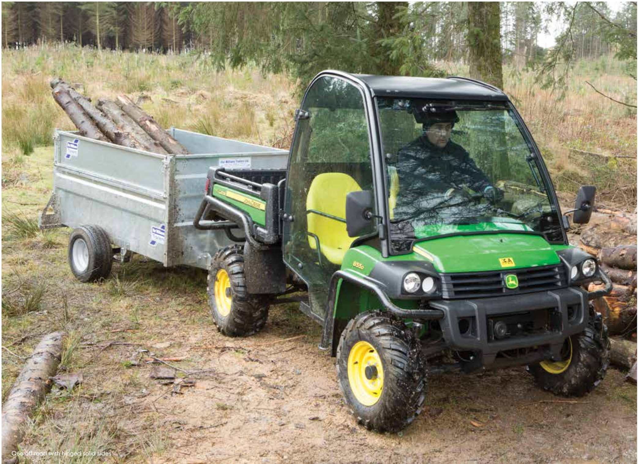
G835 off-road with hinged solid sides