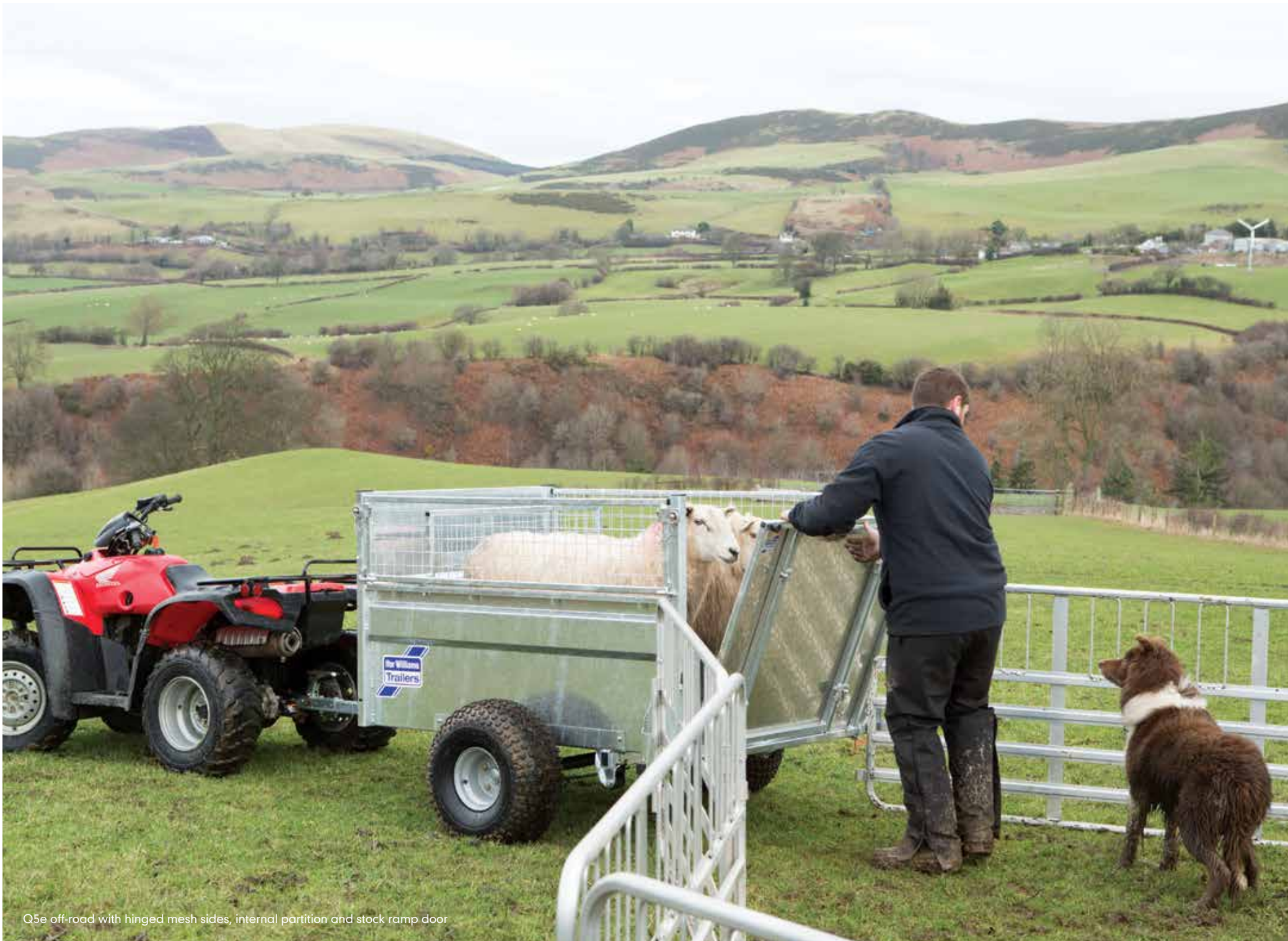
Q5e off-road with hinged mesh sides, internal partition and stock ramp door