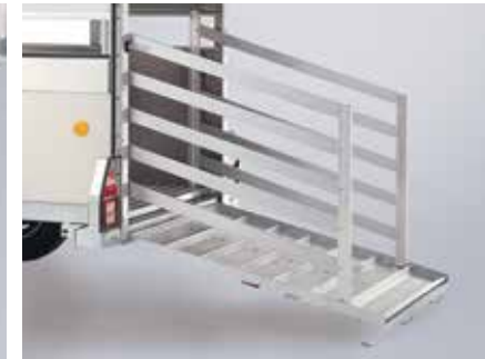
Optional ramp gates available on Q6, 7 and 8