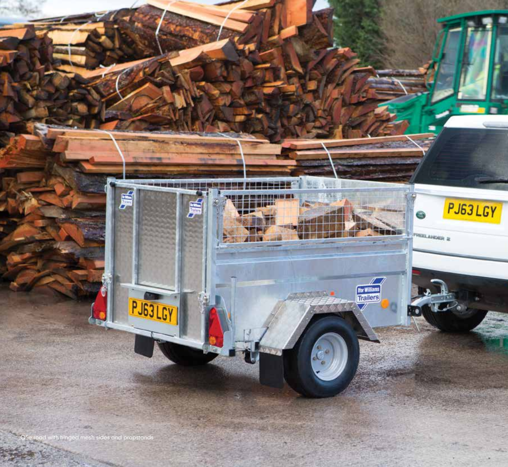
Q5e road with hinged mesh sides and propstands