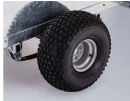
Q5e off-road knobby tyres (22 x 11-8)