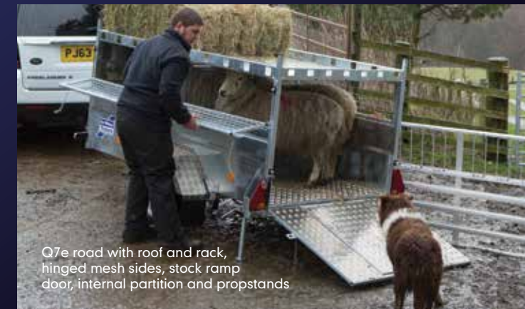
Q7e road with roof and rack, hinged mesh sides, stock ramp door, internal partition and propstands

* The roof and rack has a maximum recommended weight of 50kg and uses two fasteners which are easily removed.