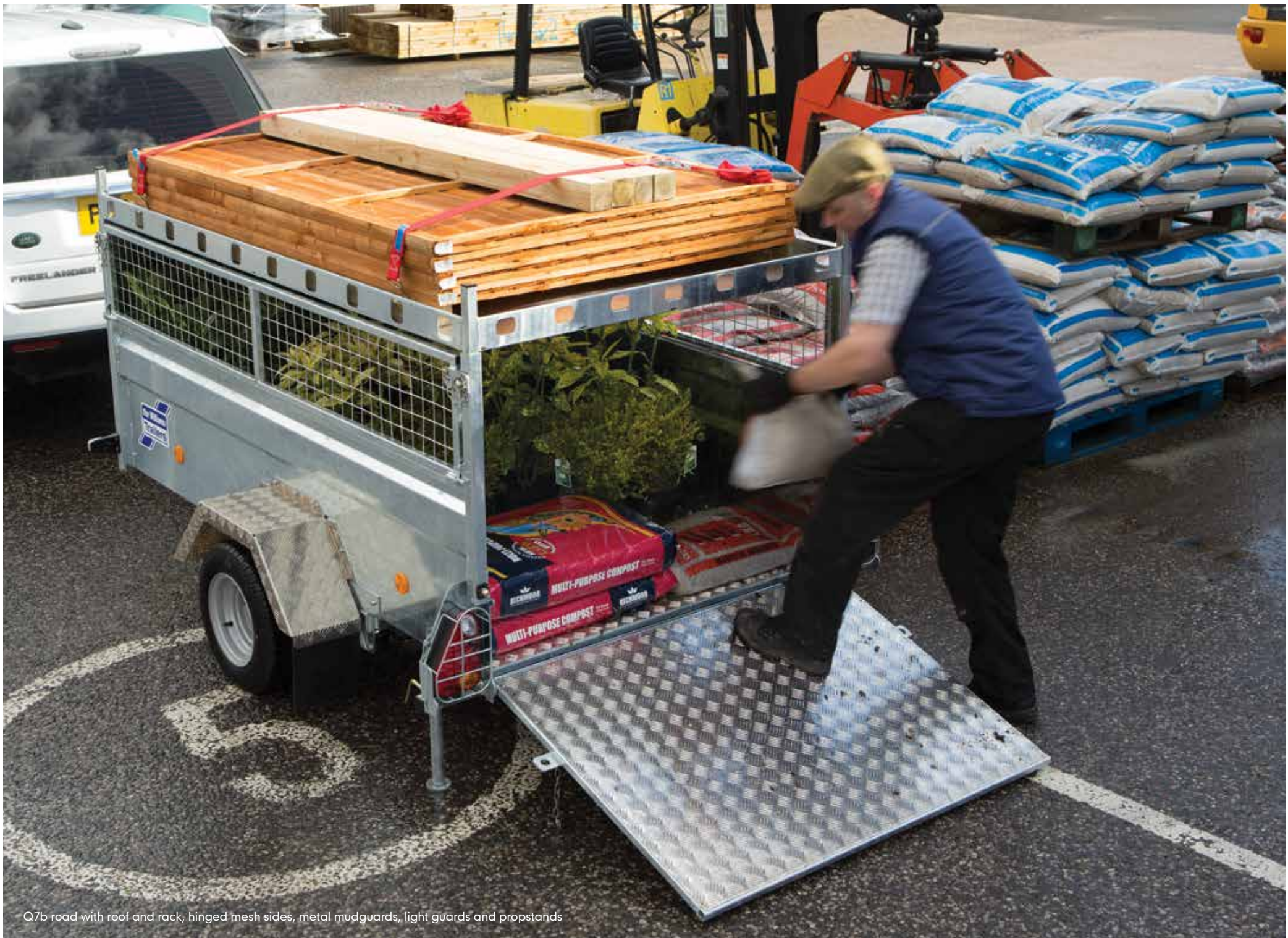
Q7b road with roof and rack, hinged mesh sides, metal mudguards, light guards and propstands