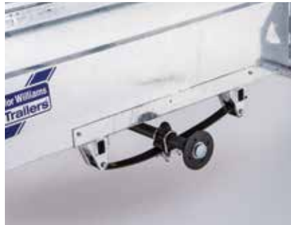
Leaf spring suspension is standard