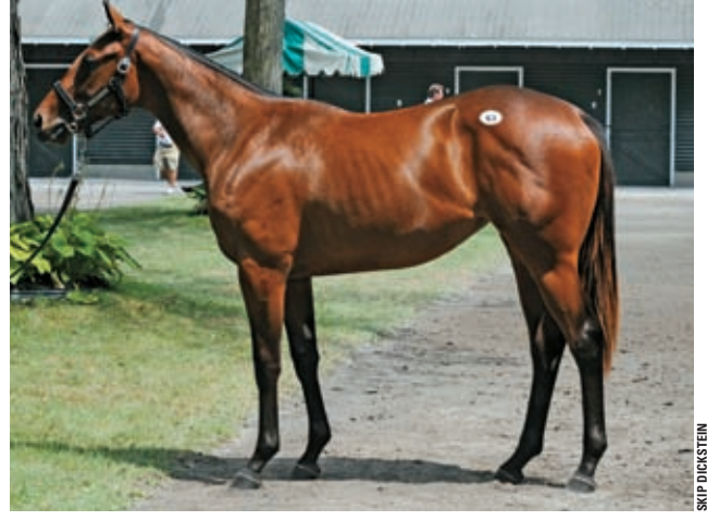
Bernardini-Sugar Shake is the top-priced filly at $950,000

recession, foreign economic woes, and problems within the racing industry were depressing prices at other Thoroughbred auctions in 2009, the Saratoga sale thrived. The gross was up 45.6% while the average and median increased 11.1% and 9.9%, respectively.