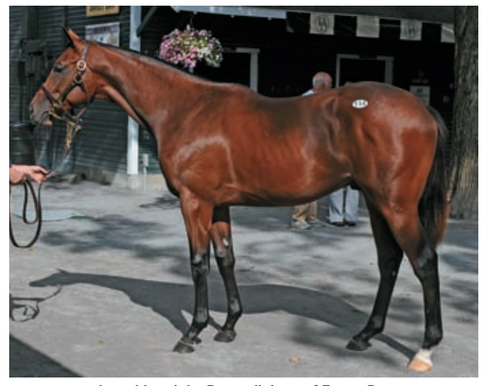
Superfection, a half brother to Super Saver, brings $1.2 million ...