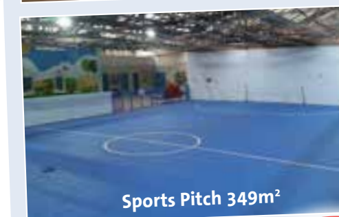
Sports Pitch 349m 2