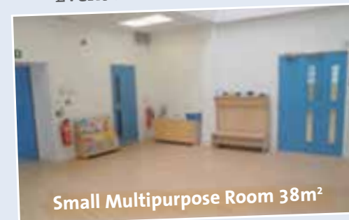
Small Multipurpose Room 38m 2

Hold your Party, Function, Class or Event at the Masbro Centre