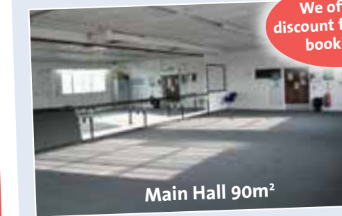
Main Hall 90m 2