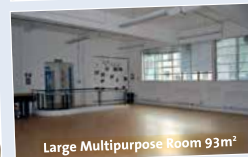
Large Multipurpose Room 93m 2