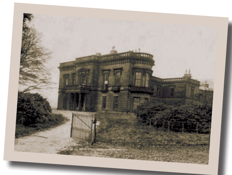
Meanwood Park, Leeds