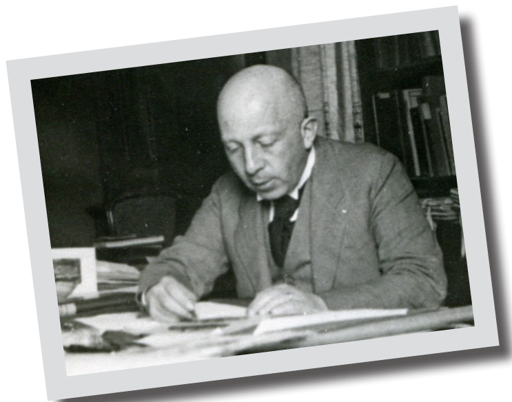
Paul Jacobsthal, refugee from fascism