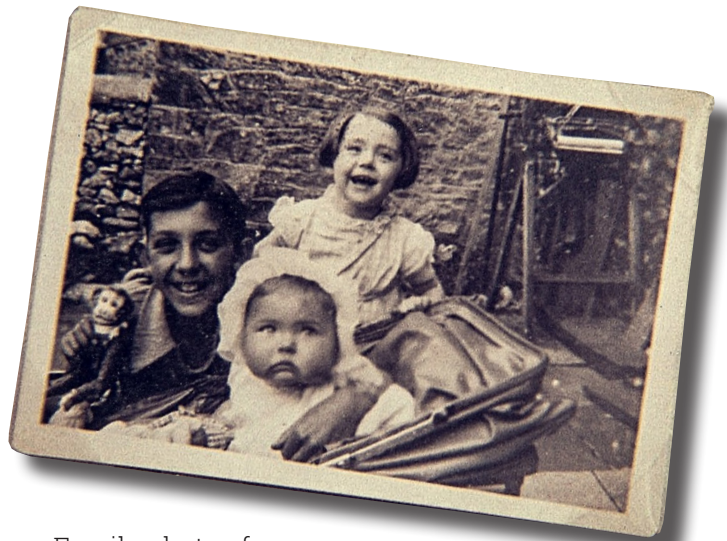
Family photo of Romany children

The Heritage Lottery Fund is offering additional support to Redbridge community organisations and staff are happy to meet you to talk about how you might get involved. Contact: sjames@hlf.org.uk quoting "Redbridge Priority Development Area" or phone 020 7591 6151.