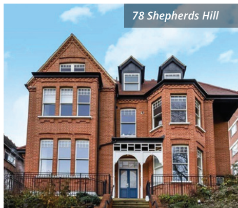
78 Shepherds Hill