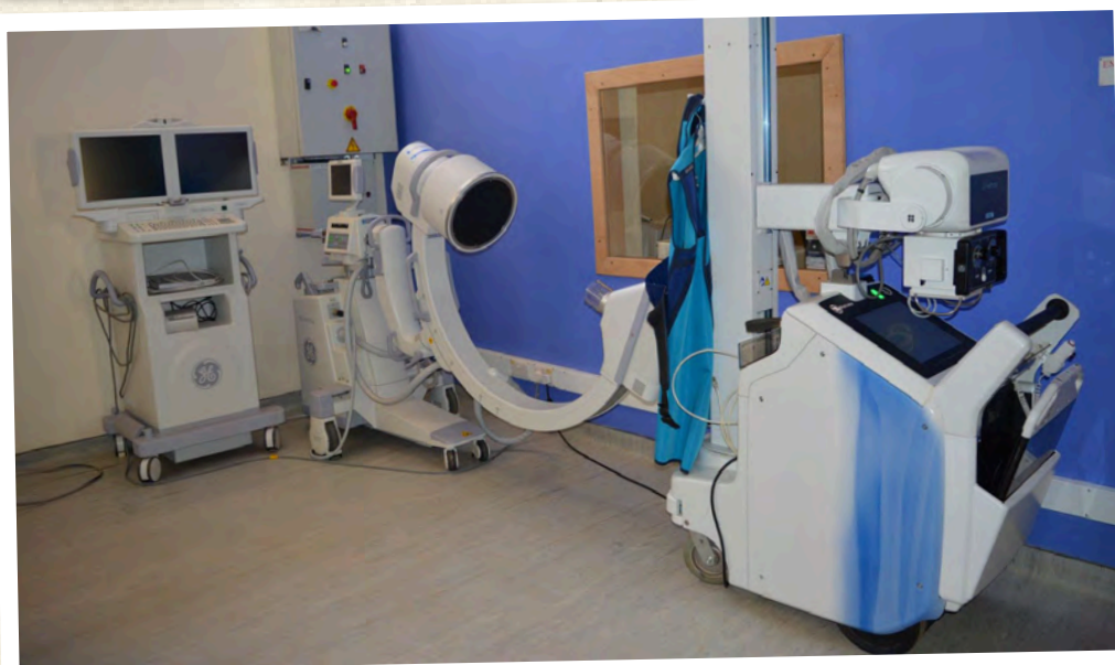
Portable X-ray equipment at Homa Bay Referral Hospital