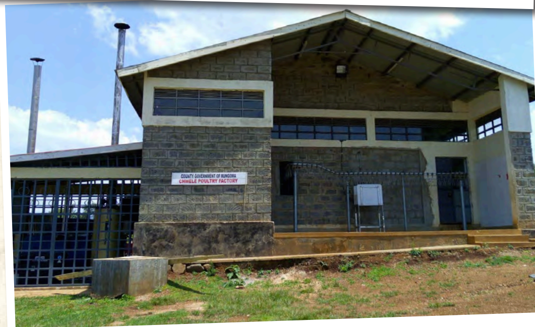
Chwele Chicken Processing Plant constructed by Bungoma County