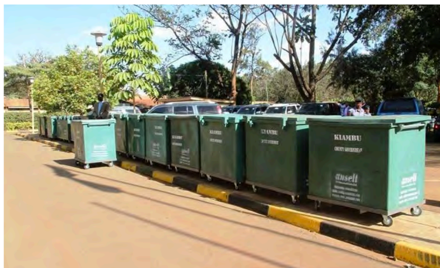
Garbage collection bins in Kiambu County