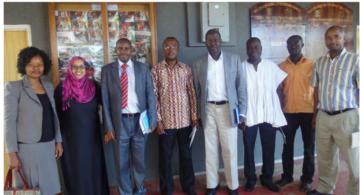
CRA Delegation visit to Ghana - 2012