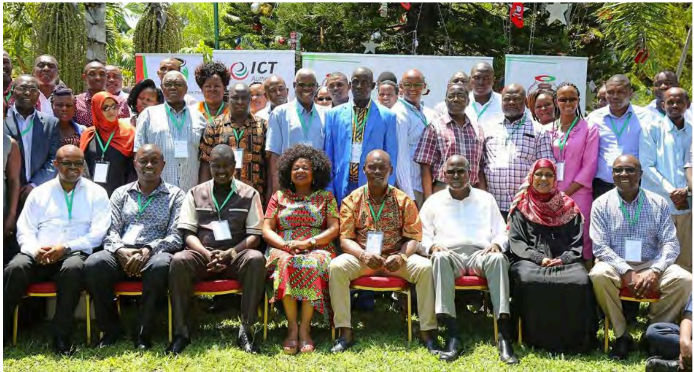
Some of the County Revenue Automation Conference, 2016 participants, Mombasa County