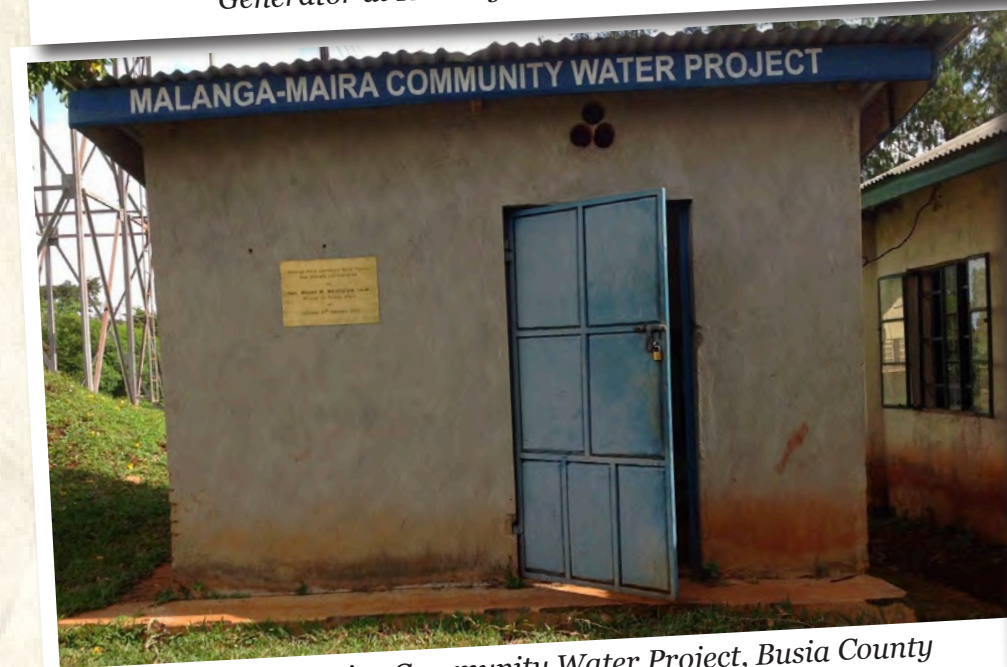
Malanga-Maira Community Water Project, Busia County