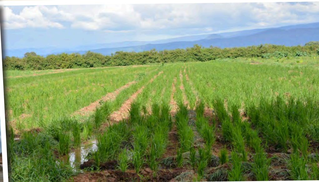
Rice irrigation at the Perkerra irrigation scheme