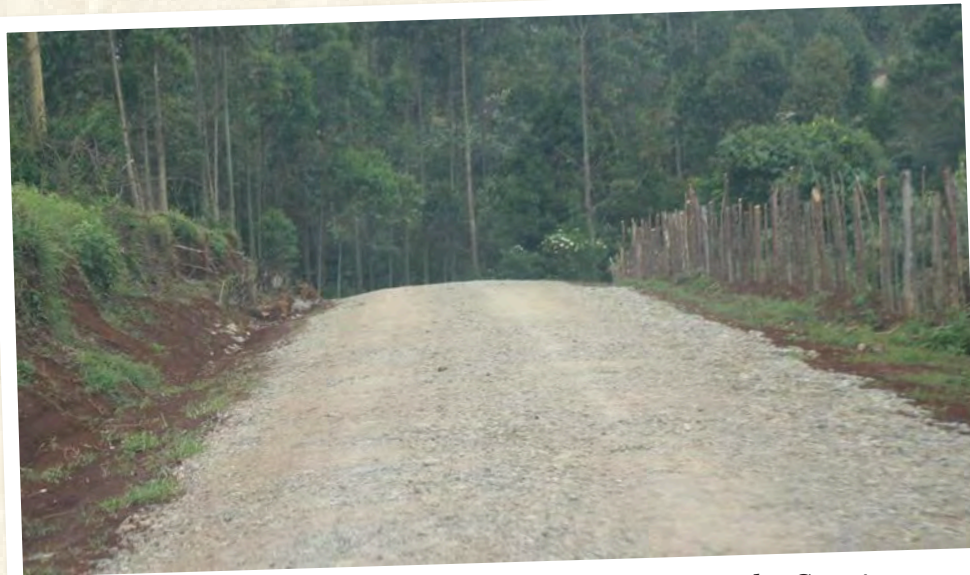
Road to Kapkurgerwet Secondary School, Kericho County