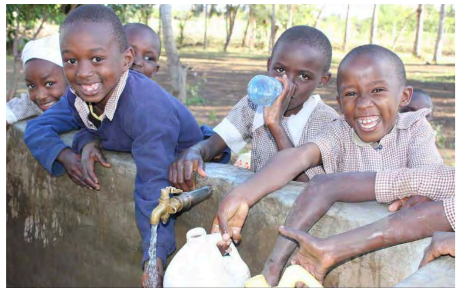
Mwea-Makima Water project, Kirinyaga County