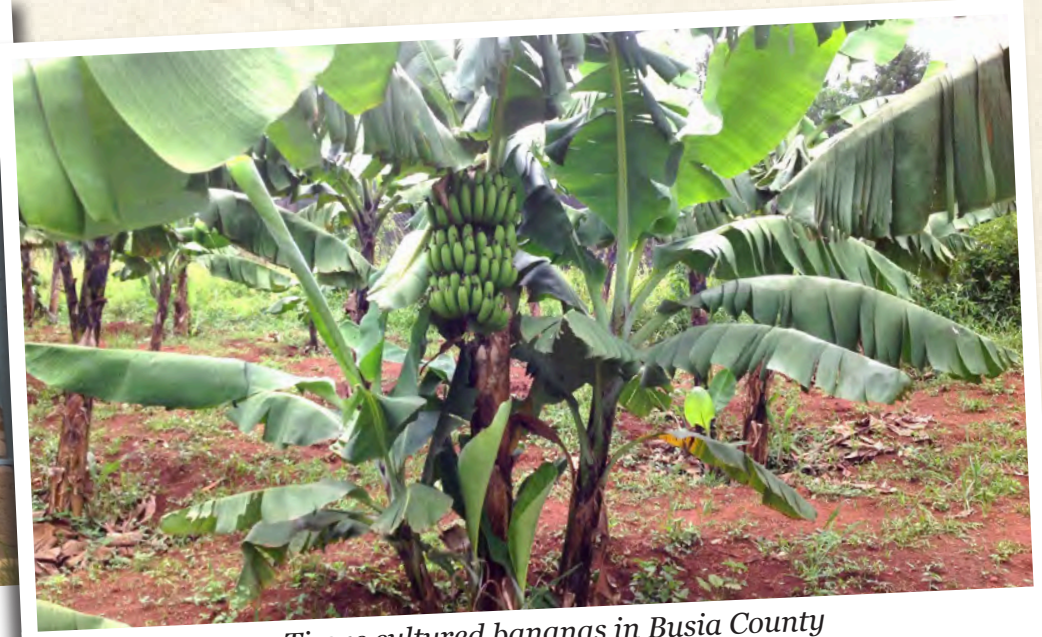
Tissue cultured bananas in Busia County