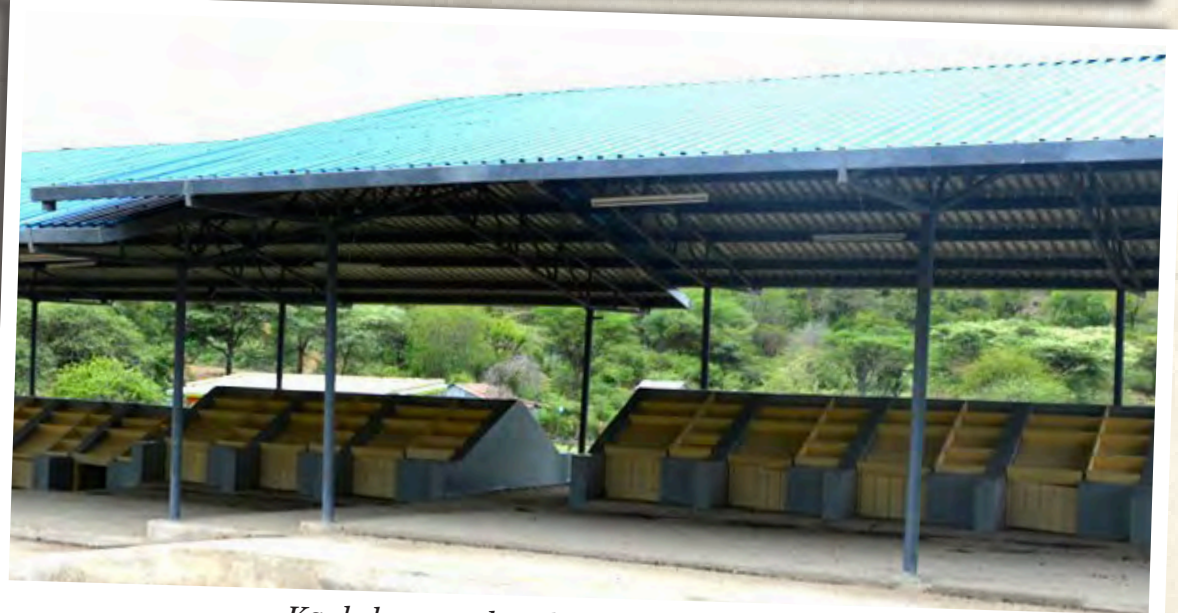
Kapkelwa market shades, Baringo County