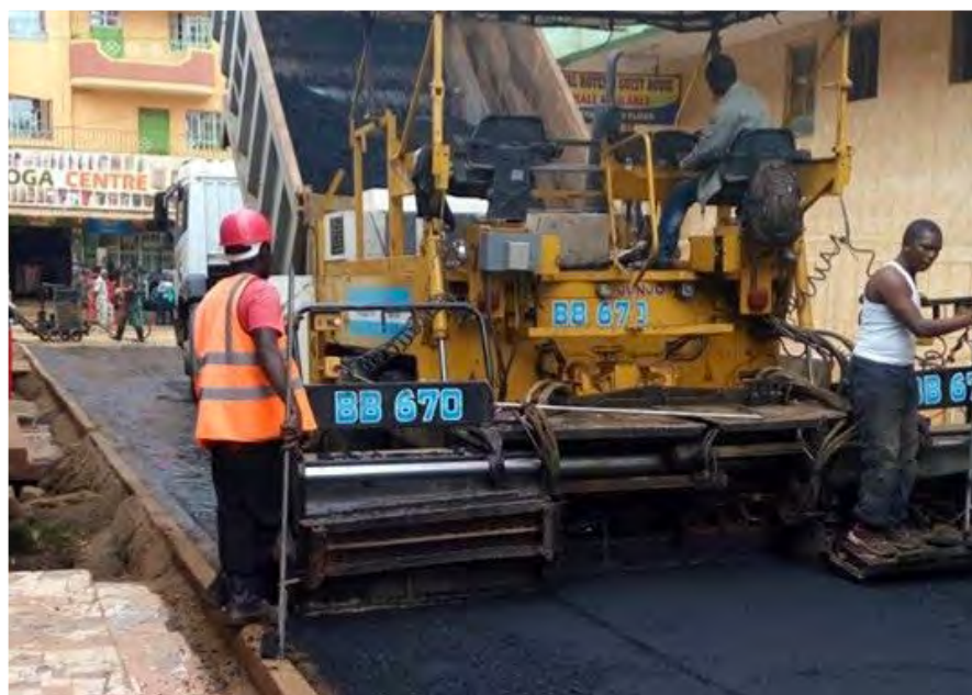
Road construction in Kiambu Town, Kiambu County