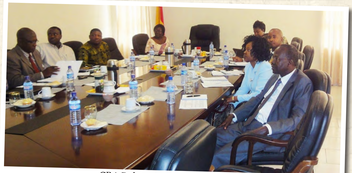
CRA Delegation visit to Ghana - 2012