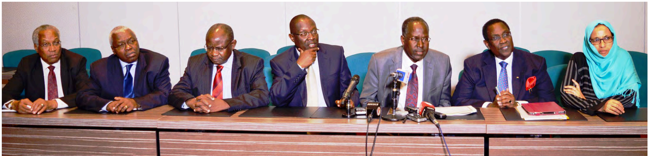
CRA Commissioners during a press conference on the 2 nd revenue sharing formula