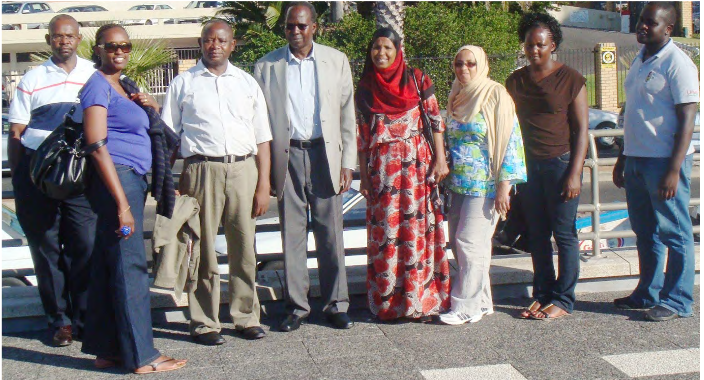
CRA Delegation Visit to South Africa - 2011