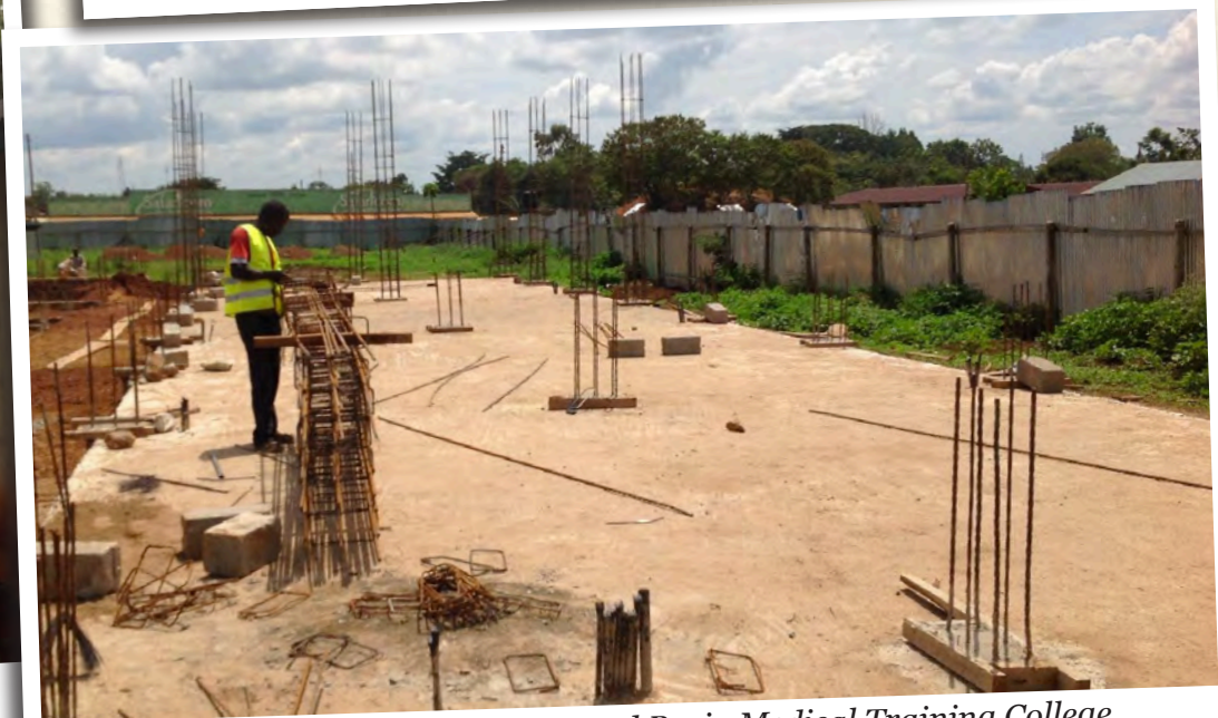
Ongoing construction of a proposed Busia Medical Training College, Busia County