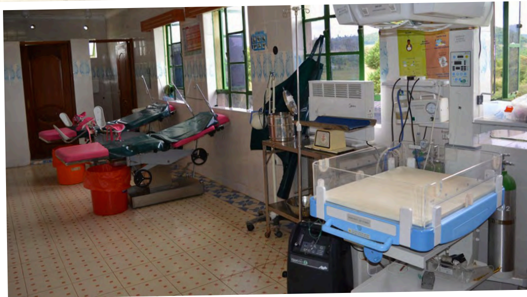
Delivery room in Eldama Ravine Referral Hospital