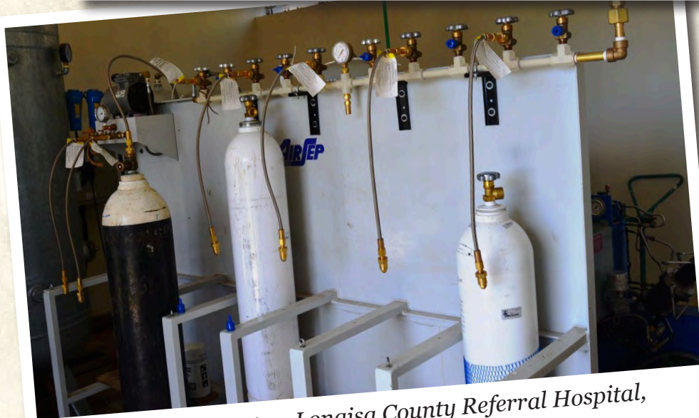
Oxygen generator, Longisa County Referral Hospital, Bomet County