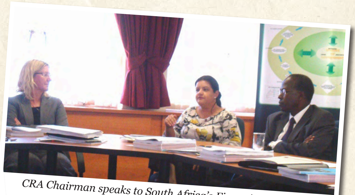
CRA Chairman speaks to South Africa's Financial and Fiscal Commissioners—2011