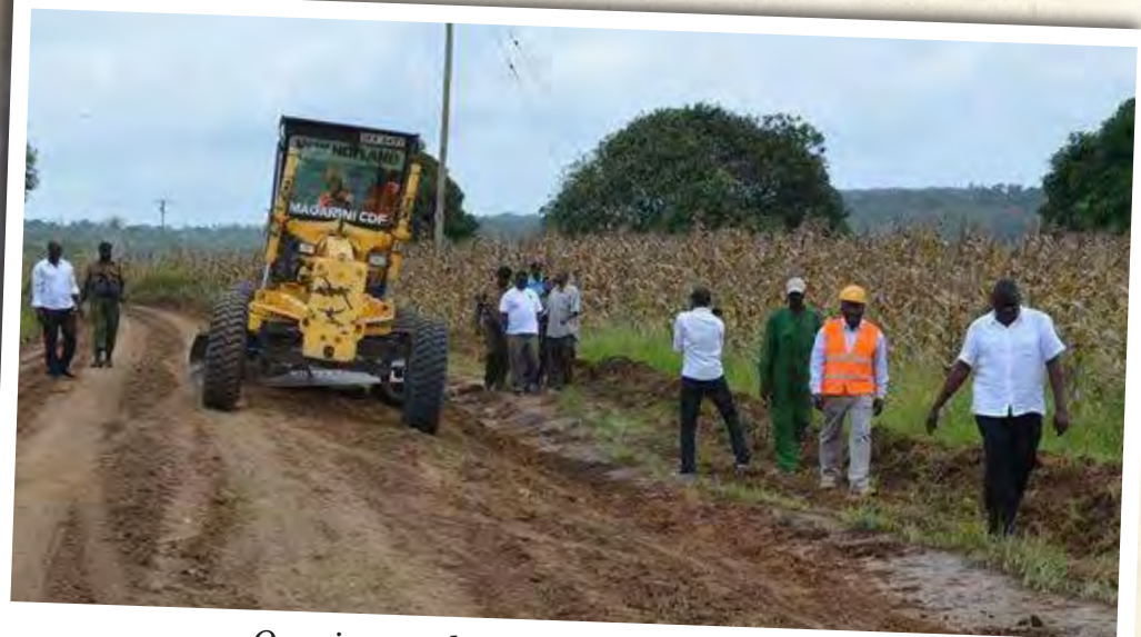
Ongoing road construction in Kilifi County