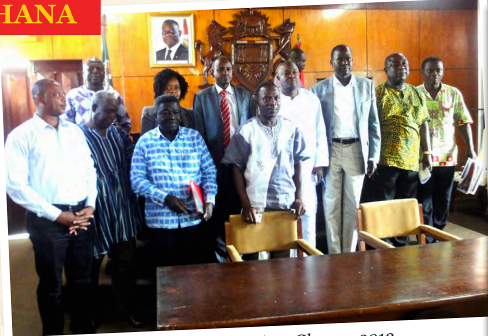
CRA Delegation visit to Ghana - 2012