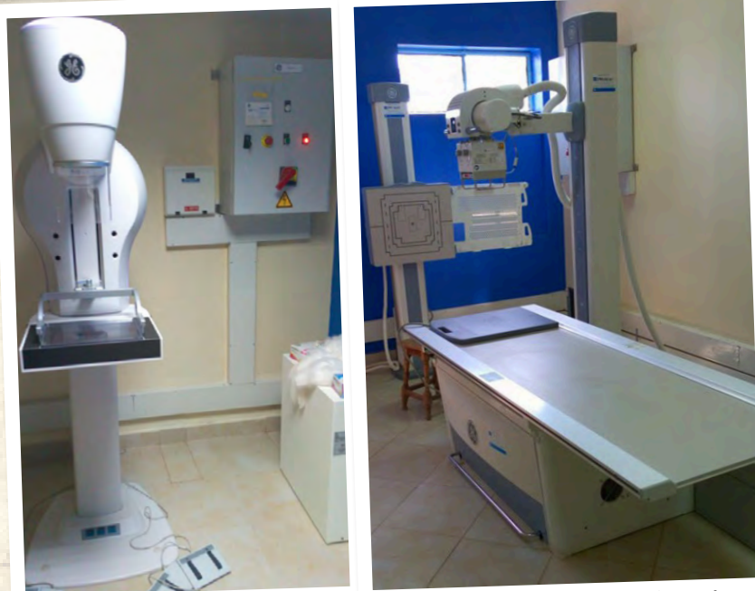
Mammography and X-Ray Machines at Bungoma County Referral Hospital