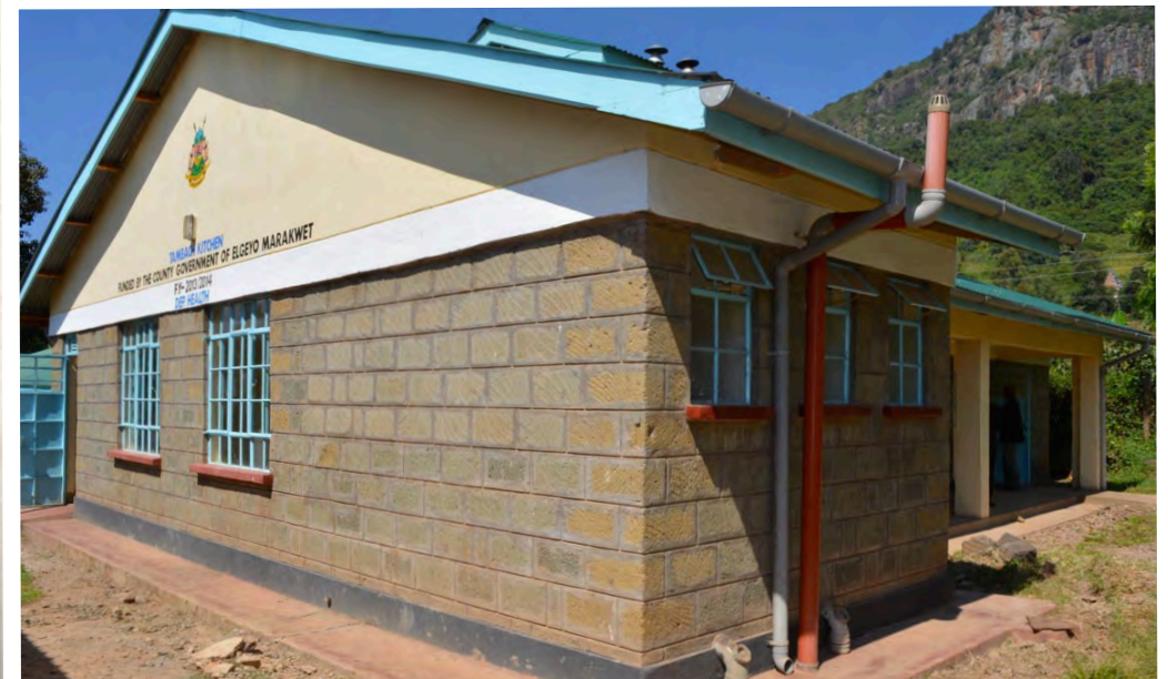
A new kitchen built in Tambach High School, Elgeyo Marakwet County