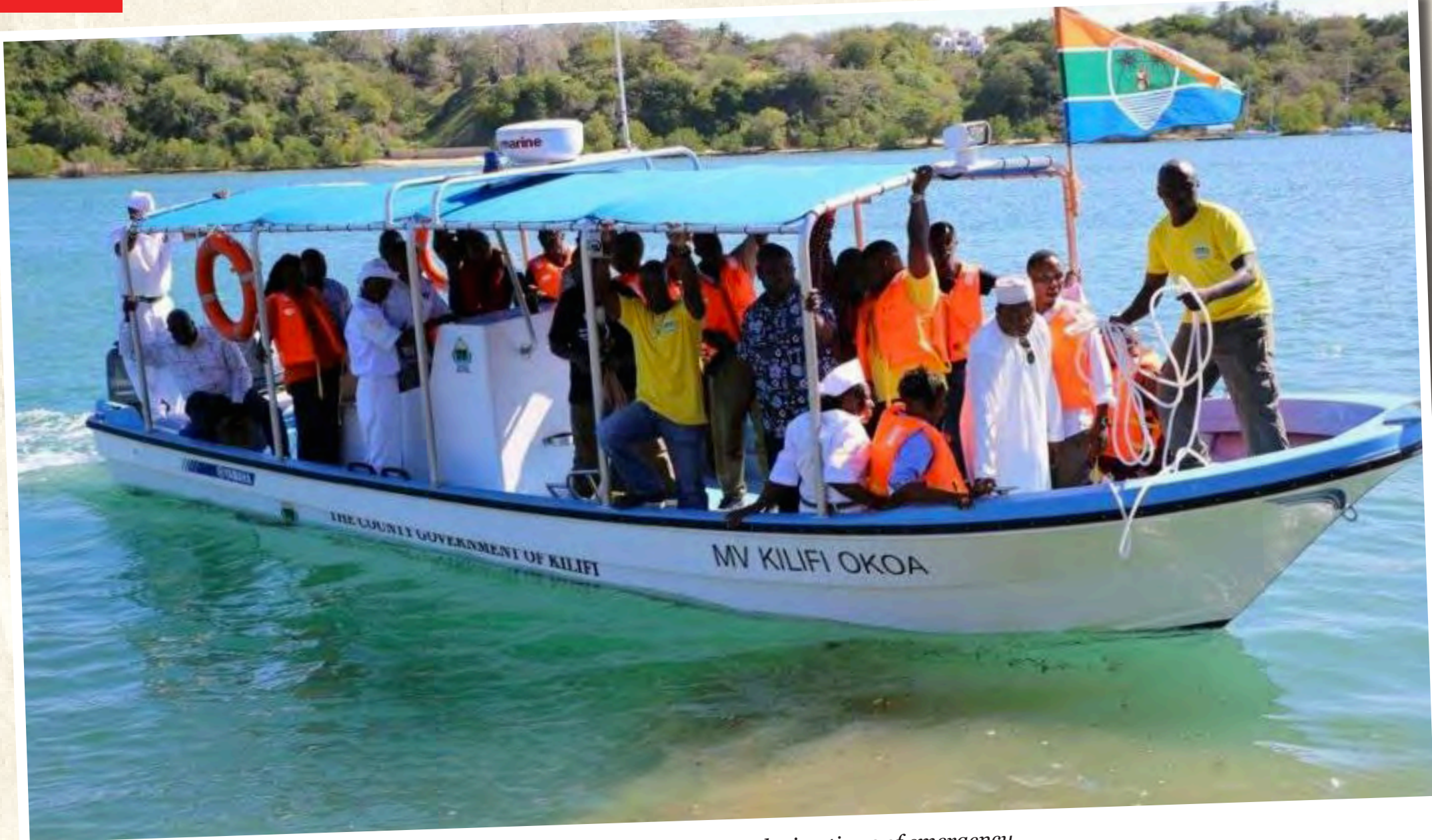
Kilifi County rescue boat for use during times of emergency.