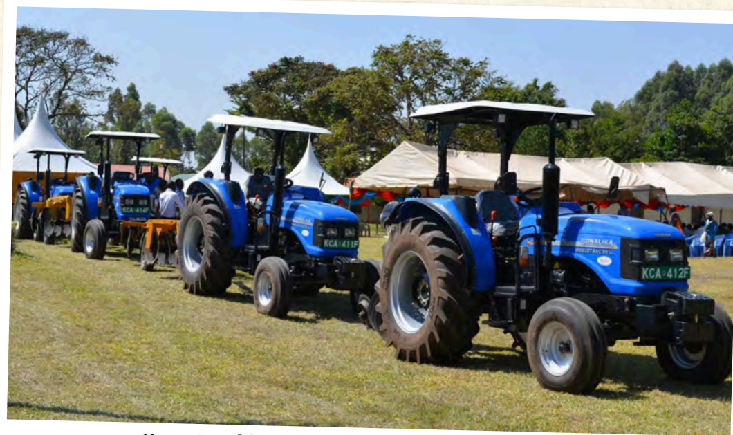
Farm Machinery purchased by Bungoma County