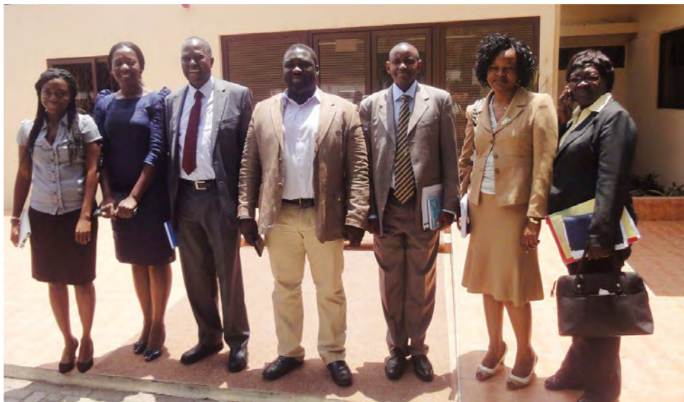
CRA Delegation visit to Ghana - 2012