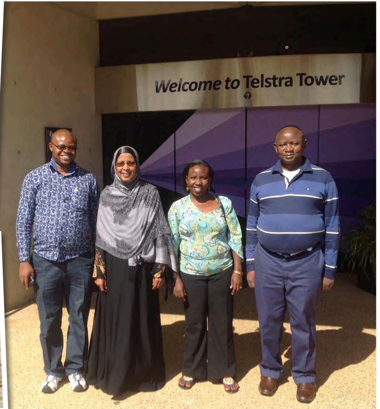
CRA Delegation visit Telstra Towers, Australia- 2016