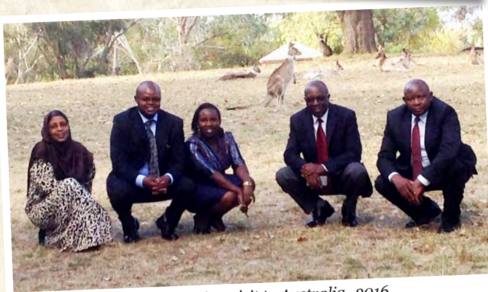
CRA Delegation visit to Australia- 2016