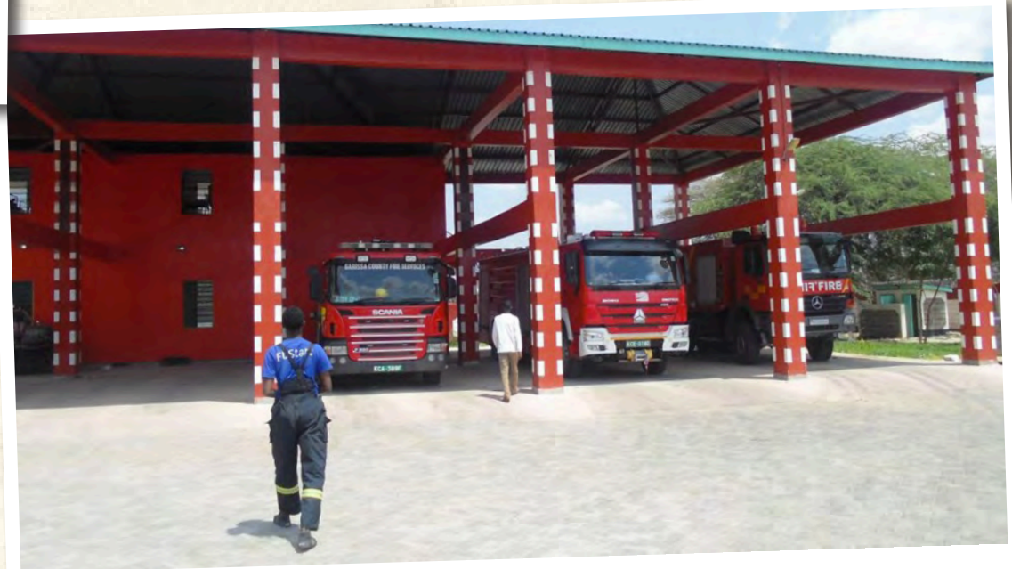
Garissa fire station