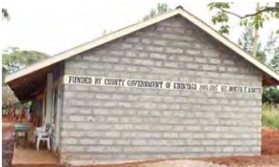
ECDE Centre constructed in Kirinyaga County