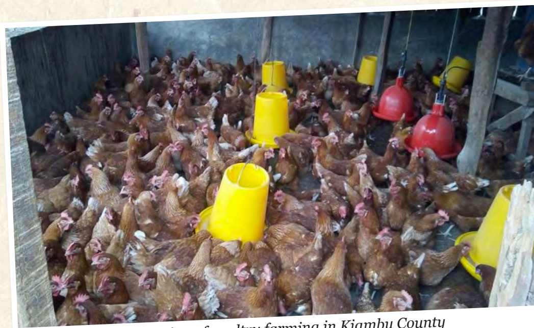
Promotion of poultry farming in Kiambu County