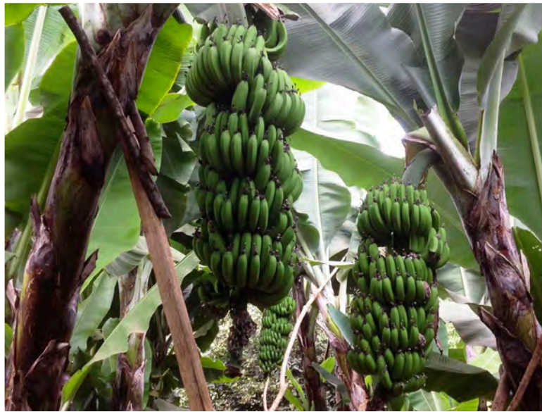
Tissue cultured bananas, Kirinyaga County