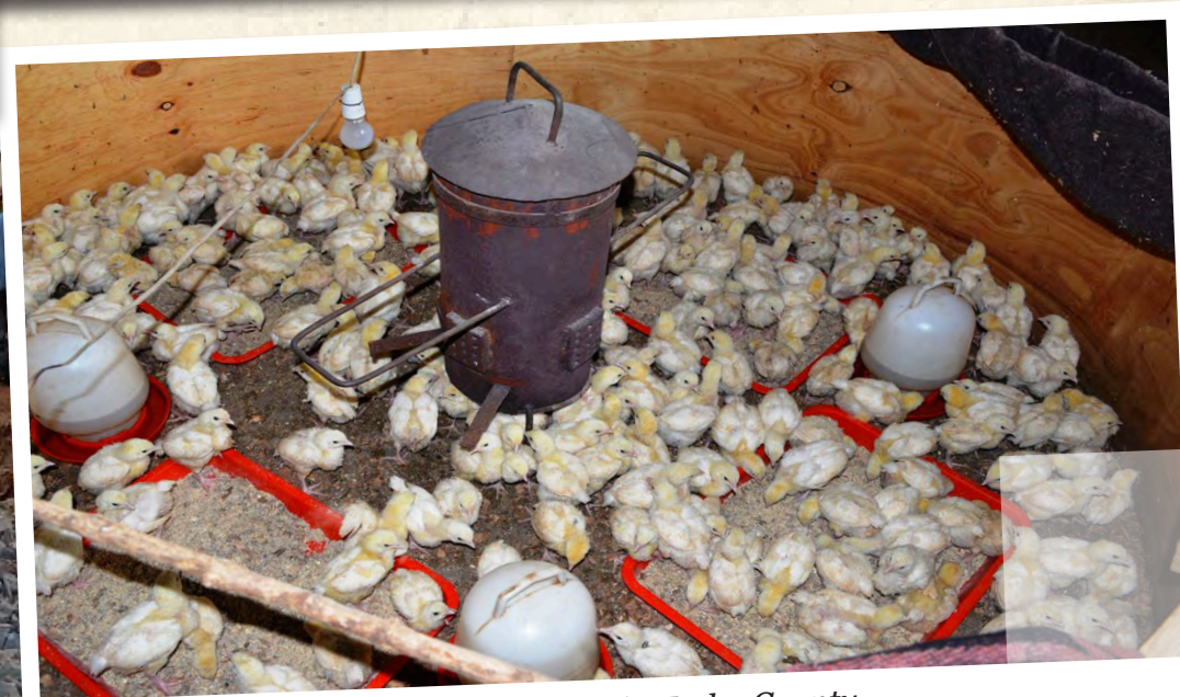
Chicken rearing in Embu County