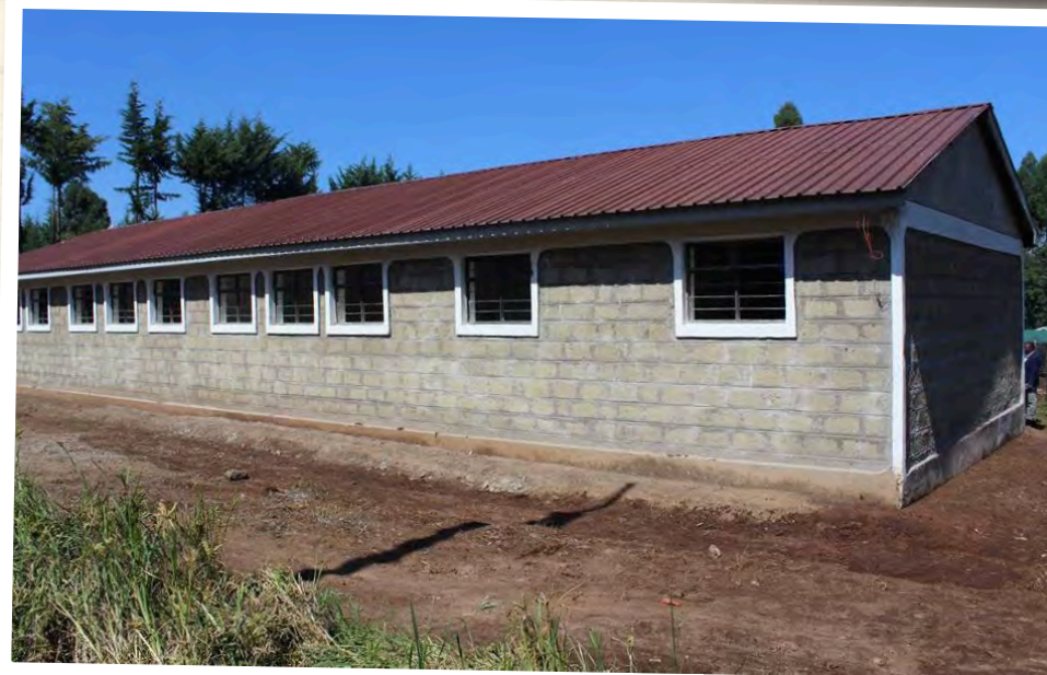
Ainamoi Youth Polytechnic, Kericho County