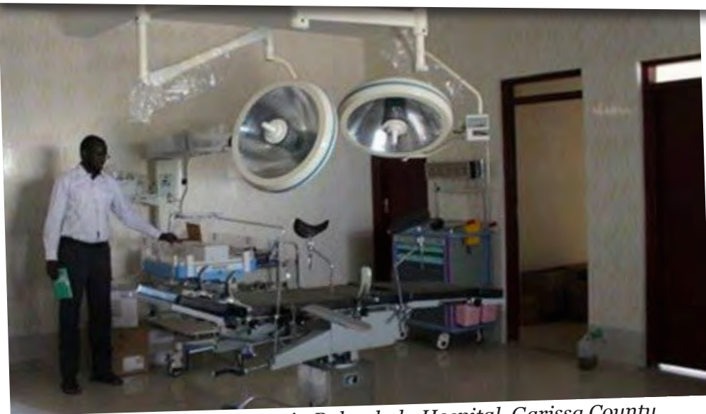
Newly equipped theatre in Balambala Hospital, Garissa County