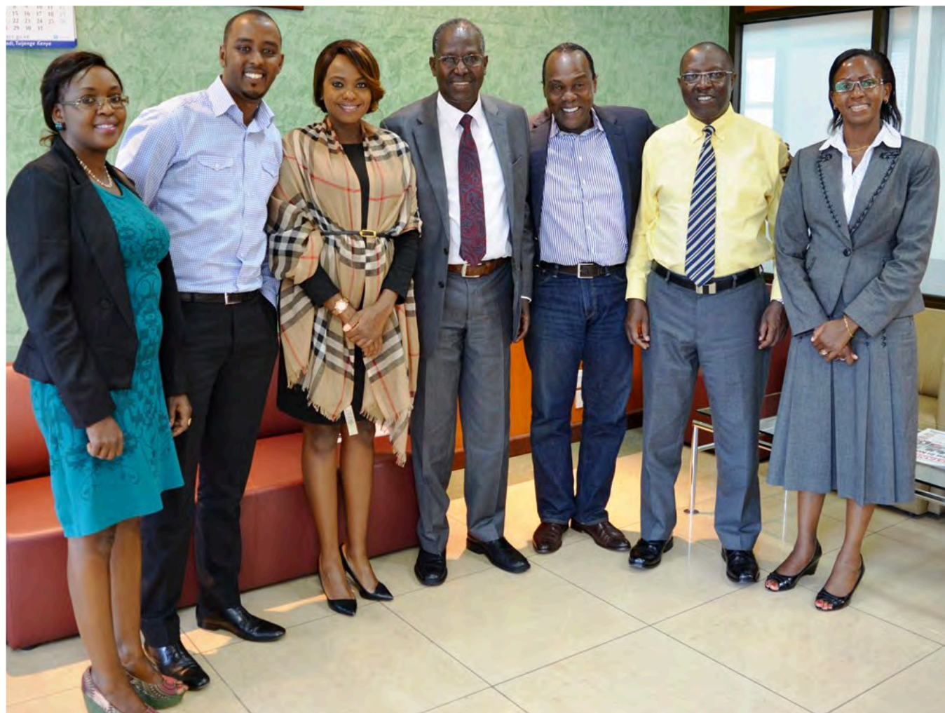
CRA Chairman, CEO and Communications Manager met with media personalities to discuss ways of communicating devolution successes.