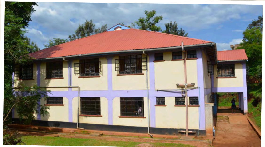
Kisii Town Library constructed by the county government