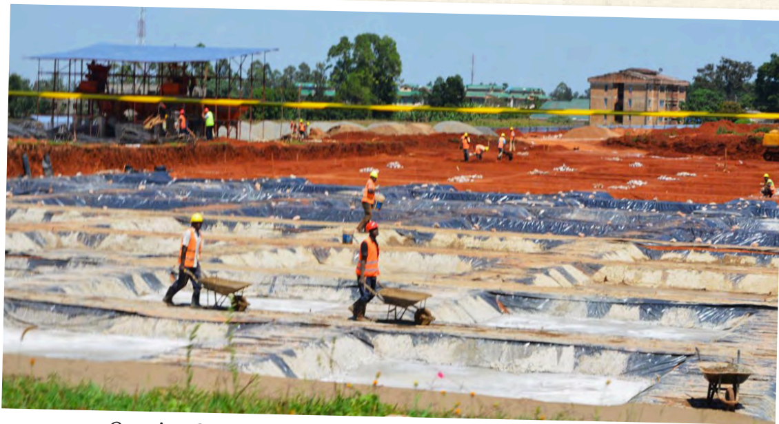
Ongoing Construction of Kakamega County Referral Hospital