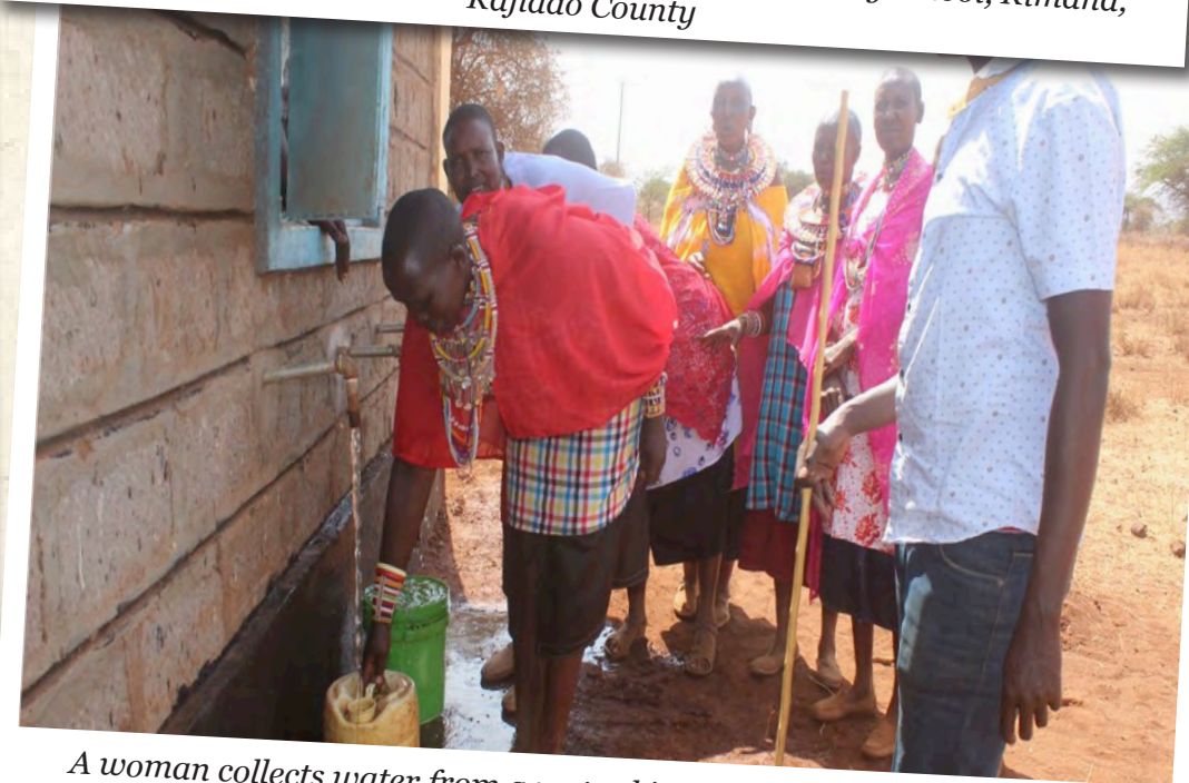
A woman collects water from a water kiosk at Irmao area in Kajiado East, Kajiado County