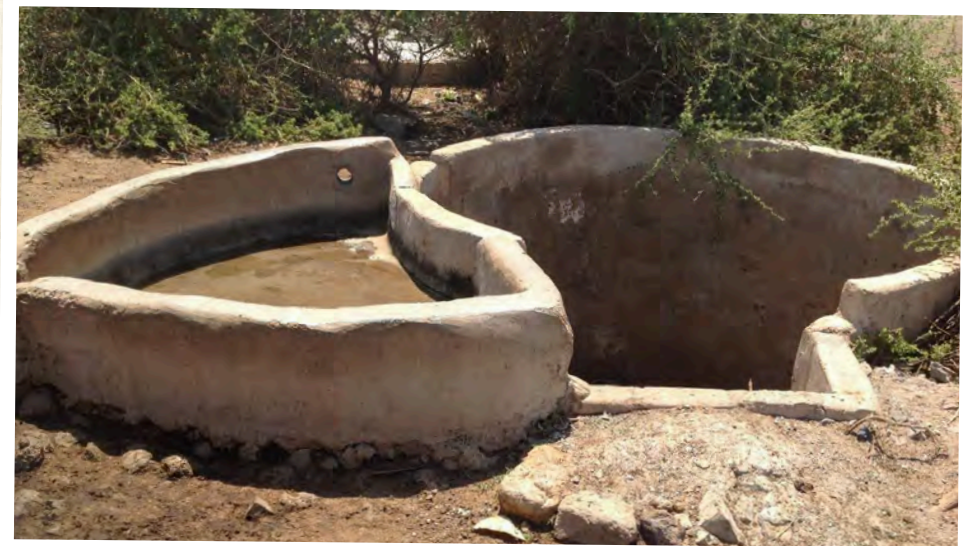
Borehole and water trough in Isiolo County