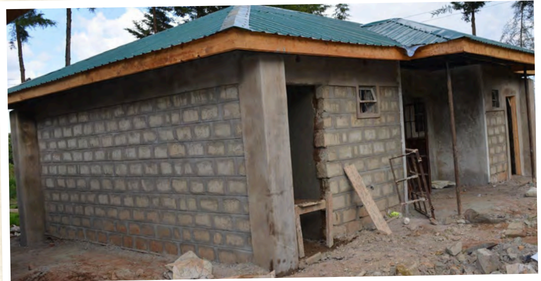
Hospital Theatre under construction at Kamwosor sub-county hospital, Metkei Ward, Elgeyo Marakwet County