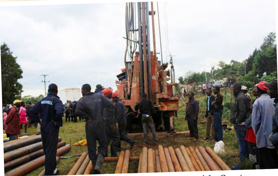
Ongoing Construction of a borehole in Kericho County