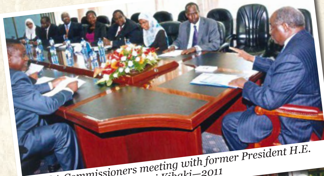
CRA Commissioners meeting with former President H.E. Mwai Kibaki—2011