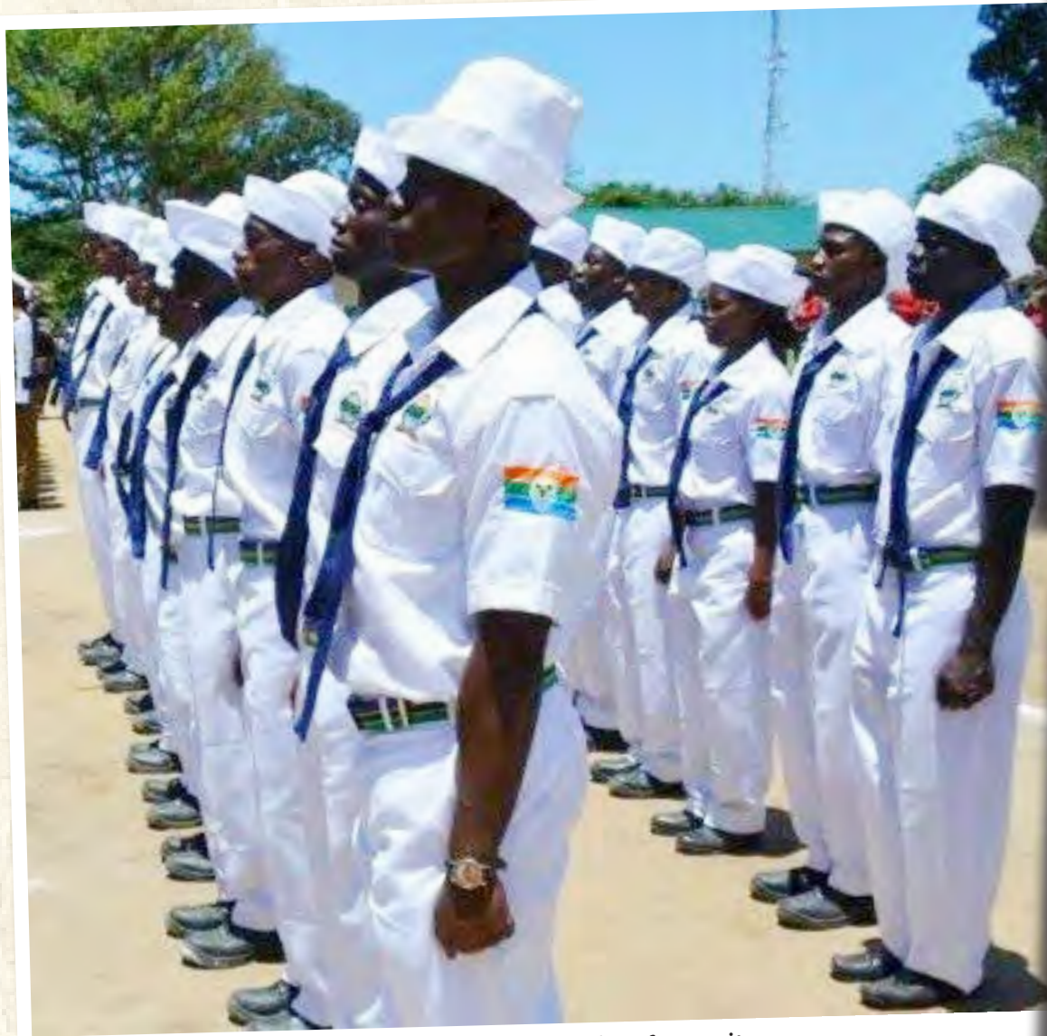
Kilifi County beach safety unit