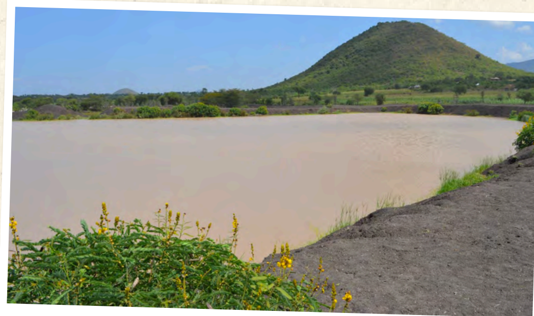
Sulwe community water pan, Homa Bay County