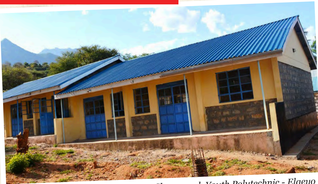
Construction of two workshops at Chesongoch Youth Polytechnic - Elgeyo Marakwet County