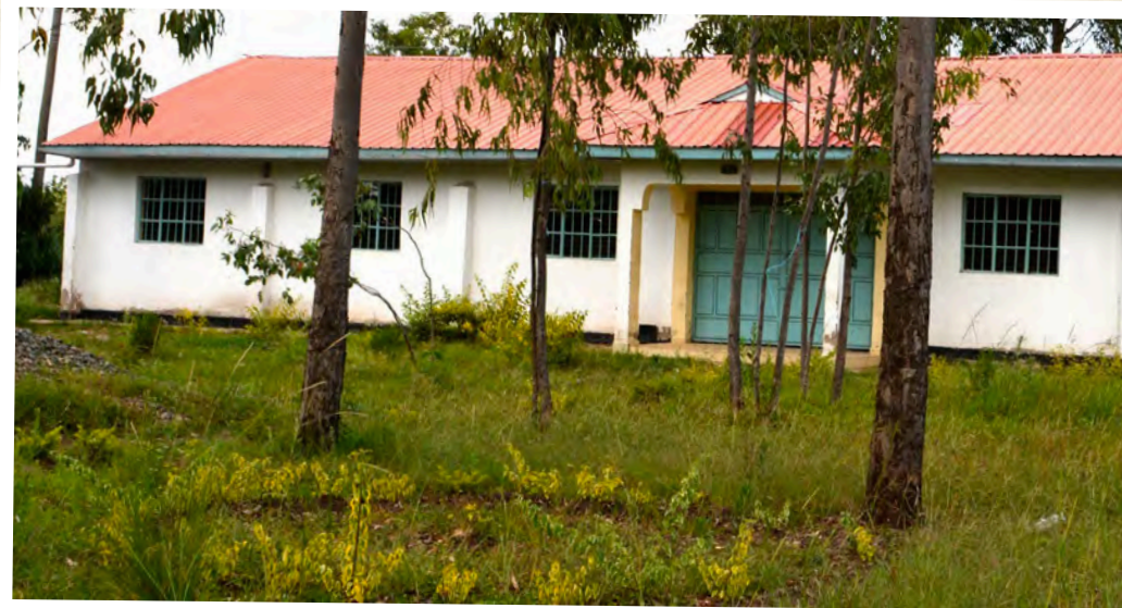
Sero Youth Polytechnic dormitory constructed by Homa Bay County.