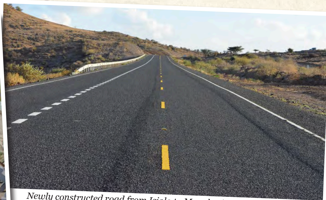
Newly constructed road from Isiolo to Moyale via Marsabit town