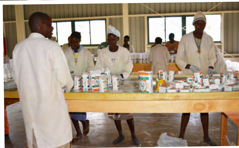
Workers working at the Bomet Maize Flour Processing Factory, Bomet County