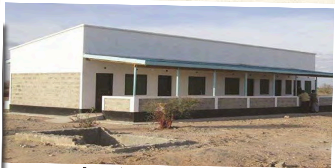
Bogyar Dispensary, Dadaab, Garissa County