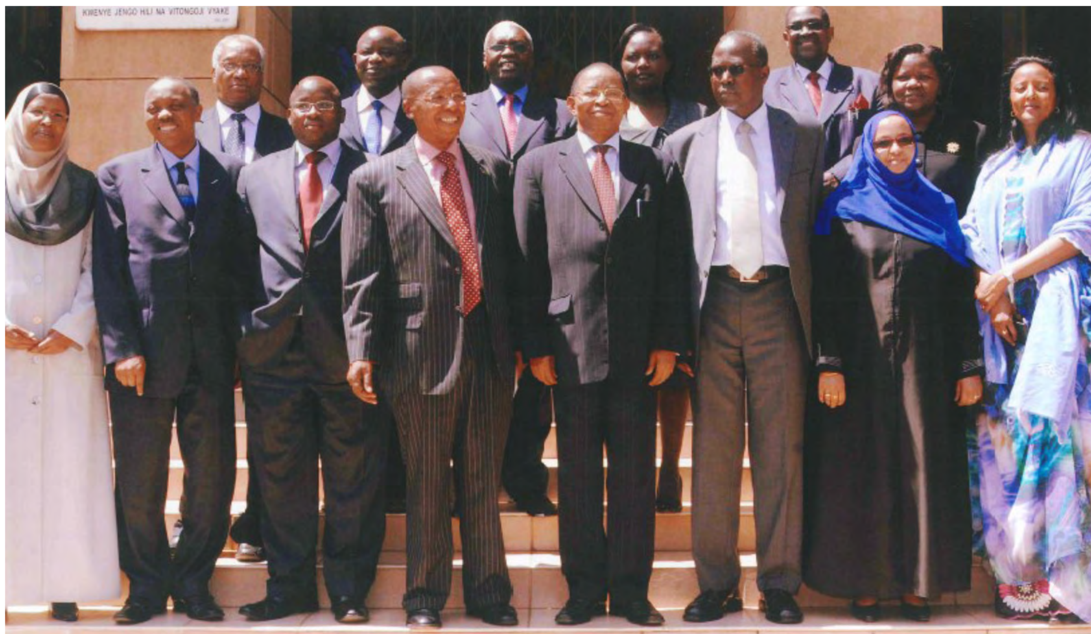
CRA Commissioners and other state officials after being sworn in - January, 2011.