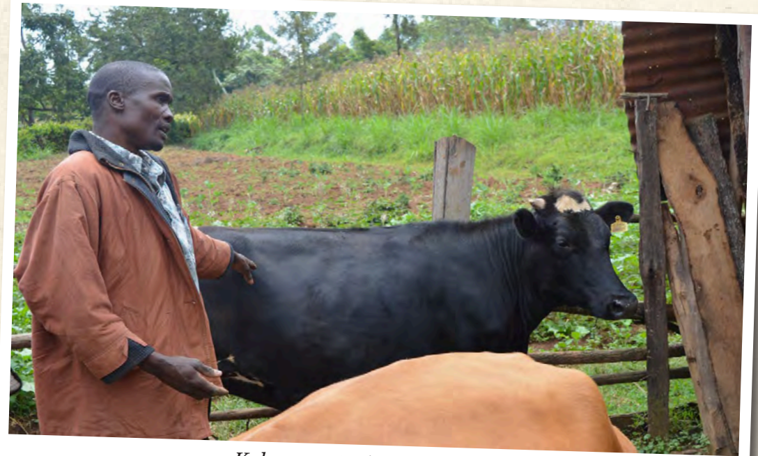
Kakamega Dairy Cow project