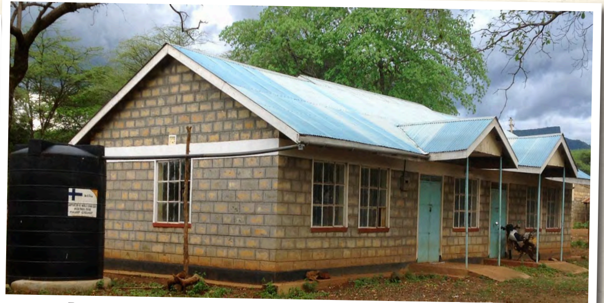
Barwessa Health Clinic, Baringo County - Hospital Staff Quarters