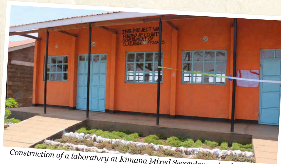
Construction of a laboratory at Kimana Mixed Secondary school, Kimana, Kajiado County