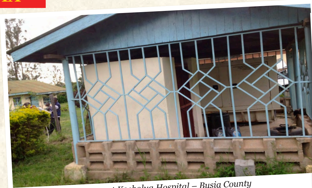
Generator at Kocholya Hospital – Busia County