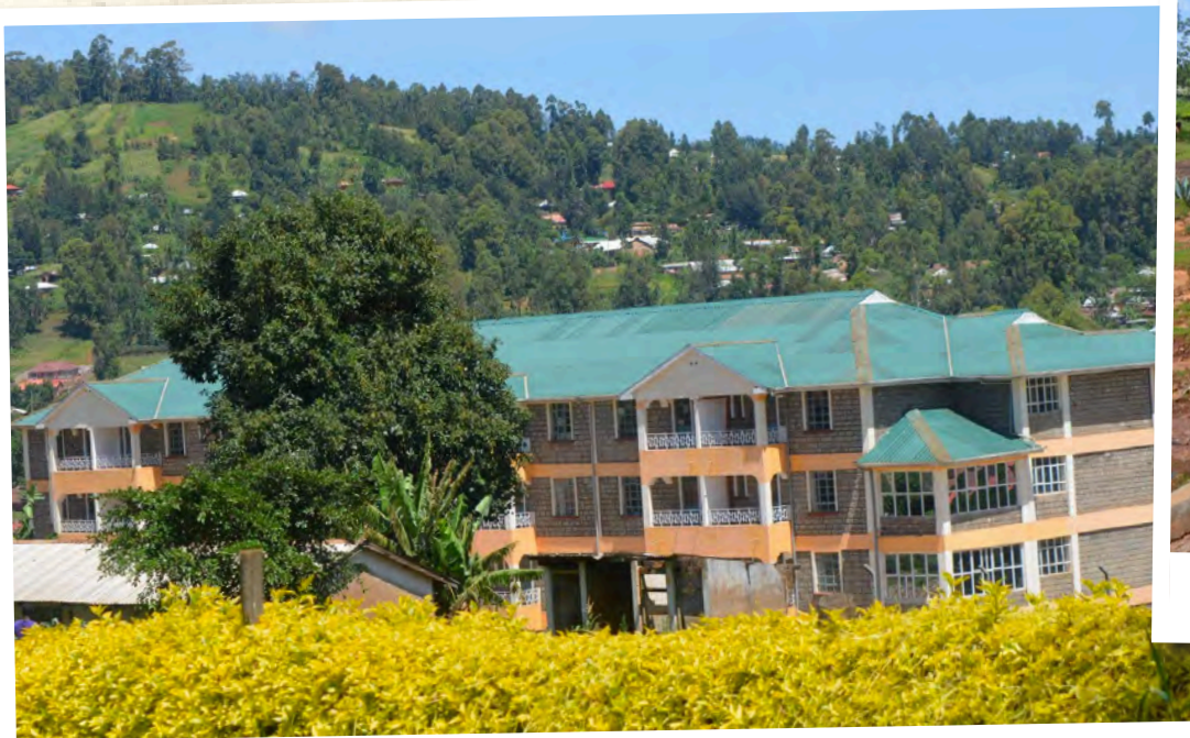
Kisii Teaching and Referral Hospital hostel block for interns and visiting doctors.