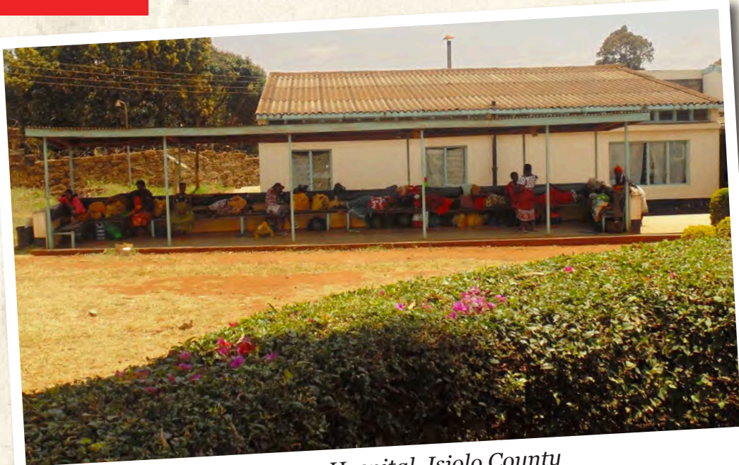
Sub-county Hospital, Isiolo County