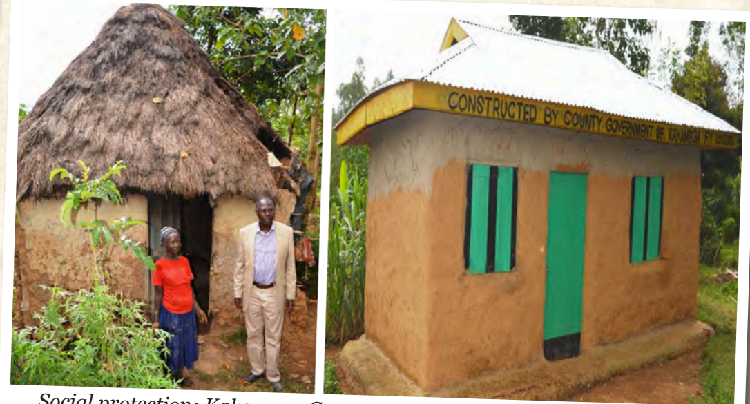
Social protection: Kakamega County government constructed a house for an elderly woman