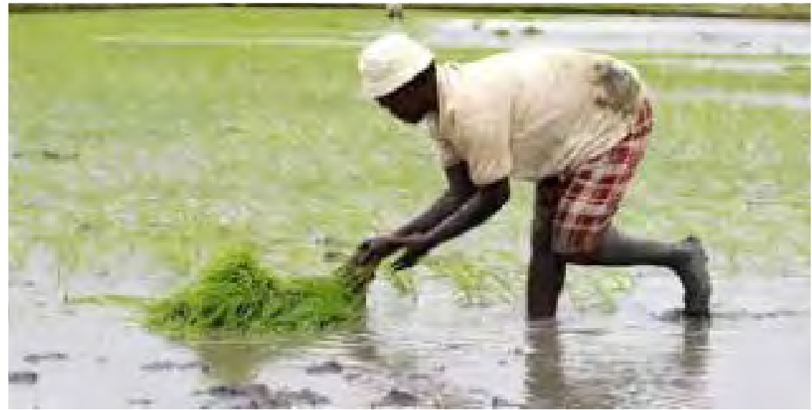
Promotion of rice irrigation in Mwea, Kirinyaga County