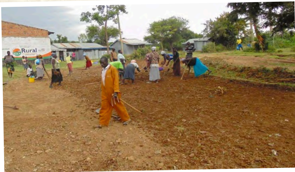
Community participation in road construction in Homa Bay County