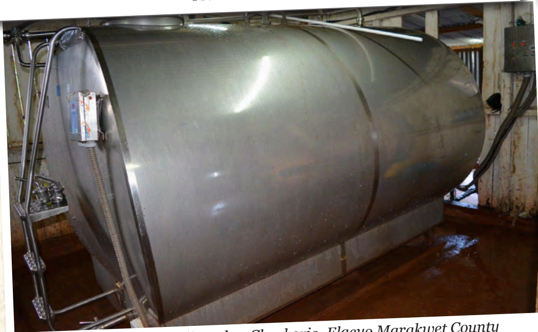
Kabiemit Satellite milk cooler, Chepkorio, Elgeyo Marakwet County