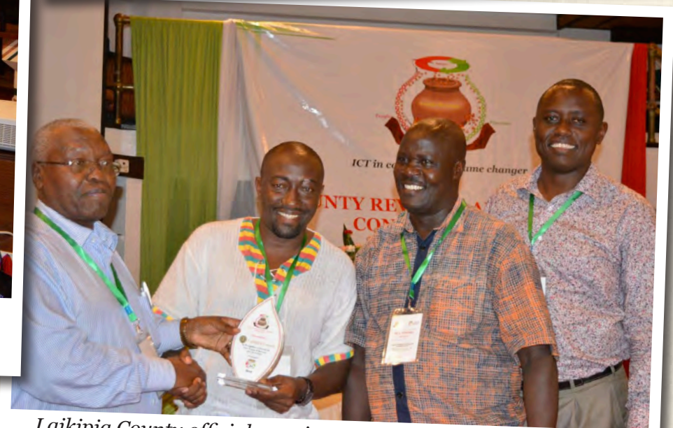
Laikipia County officials receive an award for emerging third in Own Revenue Growth Per Capita 2015-2016, at the County Revenue Automation Conference, 2016