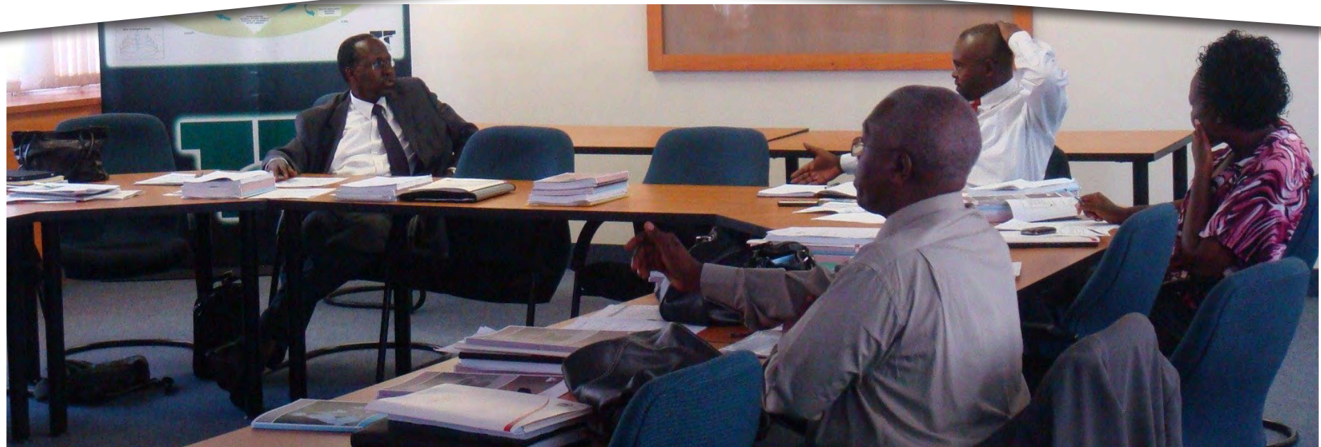
CRA Delegation in the offices of the South Africa Financial and Fiscal Commission—2011