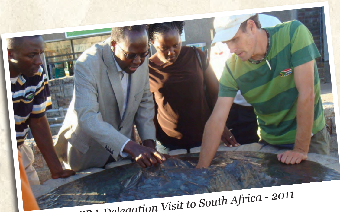
CRA Delegation Visit to South Africa - 2011