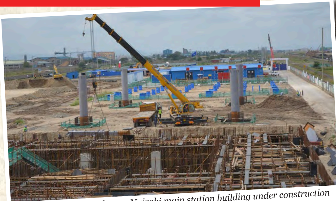
Standard gauge railway - Nairobi main station building under construction