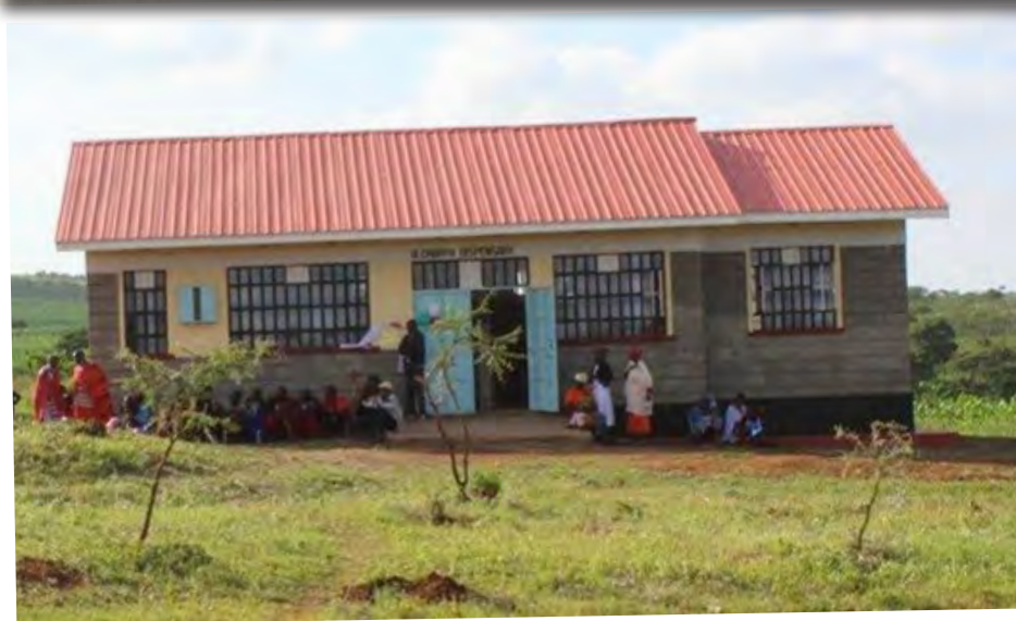
Olchorro Dispensary, Kajiado County