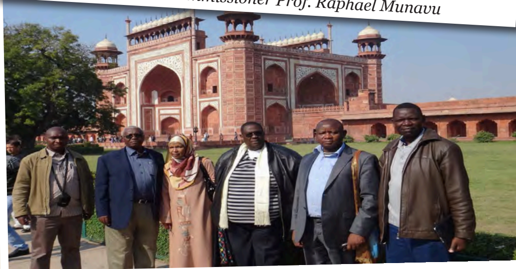
CRA Delegation at the Taj Mahal - 2012