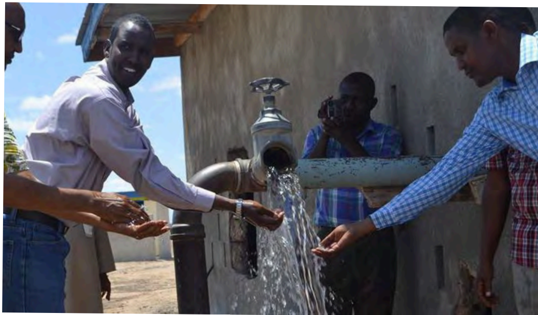
Water kiosks constructed in Garissa County