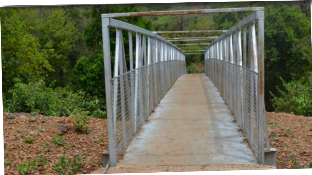
Kapkelwa foot bridge, Baringo County