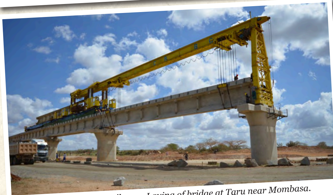
Standard gauge railway - Laying of bridge at Taru near Mombasa.