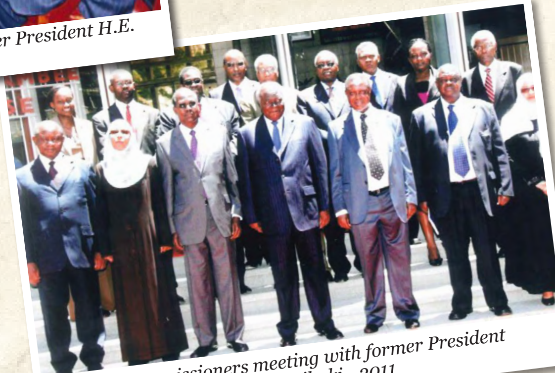
CRA Commissioners meeting with former President H.E. Mwai Kibaki—2011