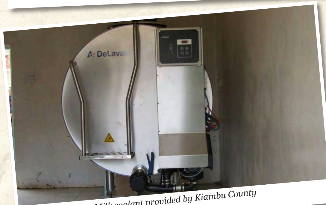
Milk coolant provided by Kiambu County