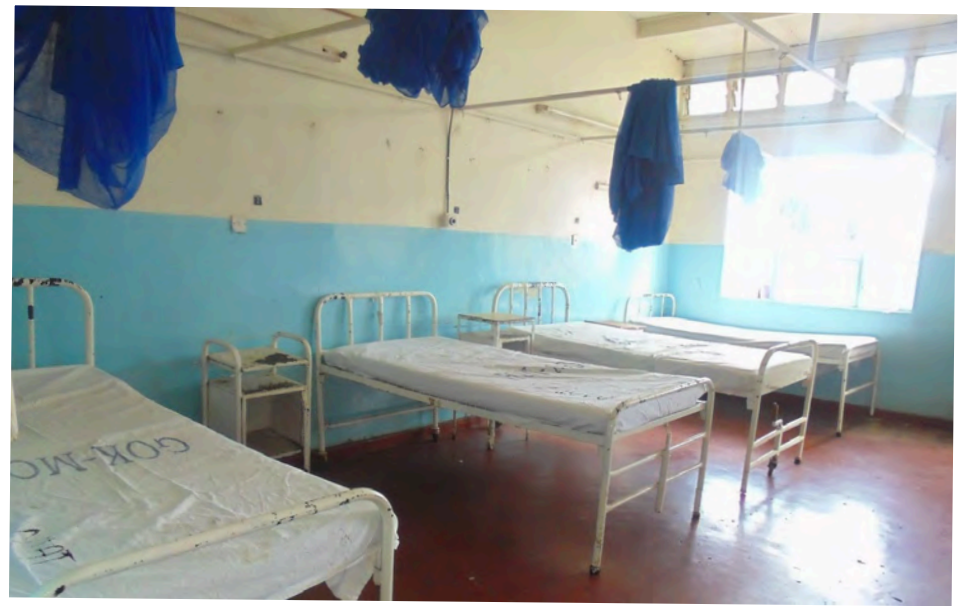
Hospital beds in Sub-county Hospital, Isiolo County