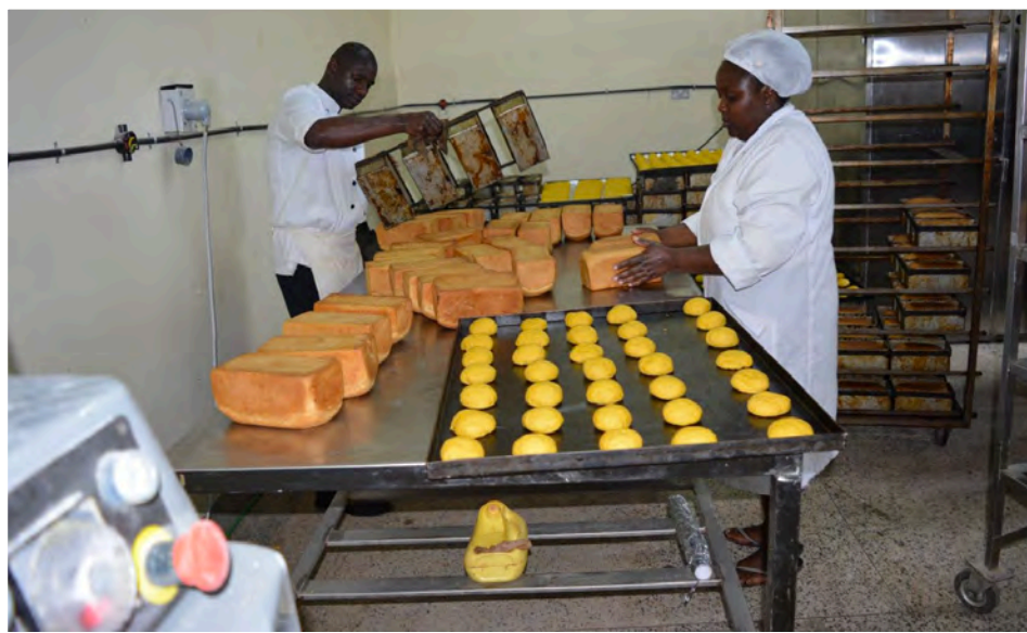
Employees working at the Bomet Farmers Cooperative Society Bakery in Bomet Town, Bomet County