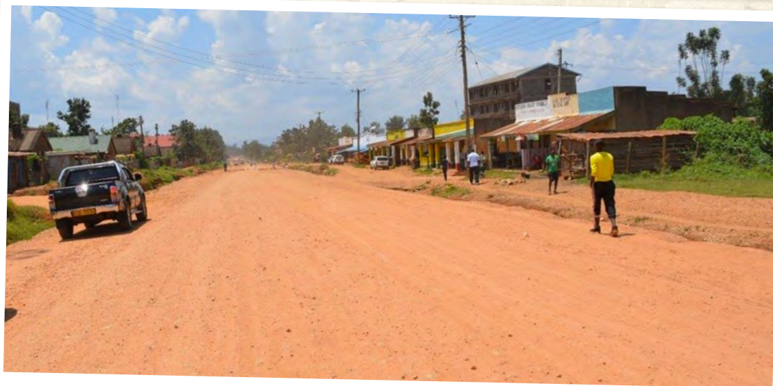
Ongoing construction of Sheyiwe Road, Kakamega County