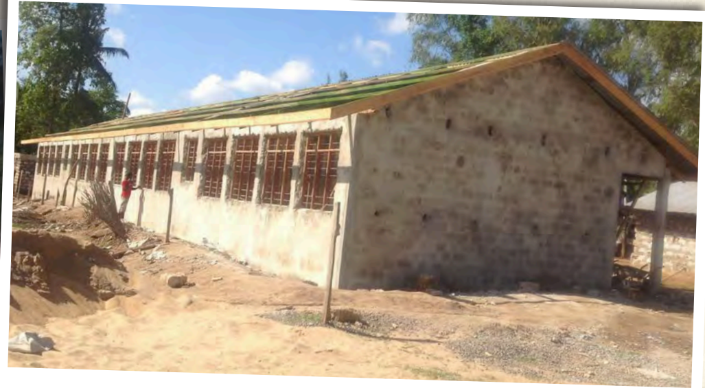
On going construction of ECDE classroom at Kavunyalalu primary school.