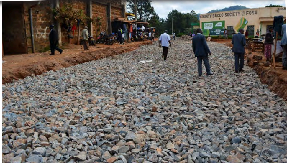
Construction of road in Runyenjes, Embu County