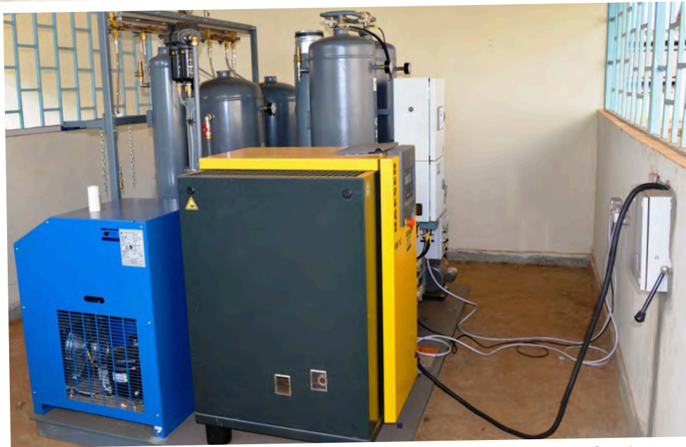
Embu Level V Hospital – Oxygen manufacturing plant, Embu County