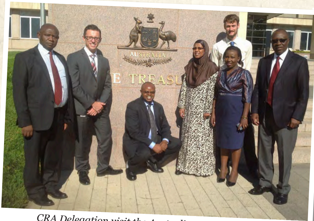
CRA Delegation visit the Australian Treasury - 2016