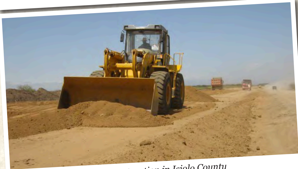
Road construction in Isiolo County