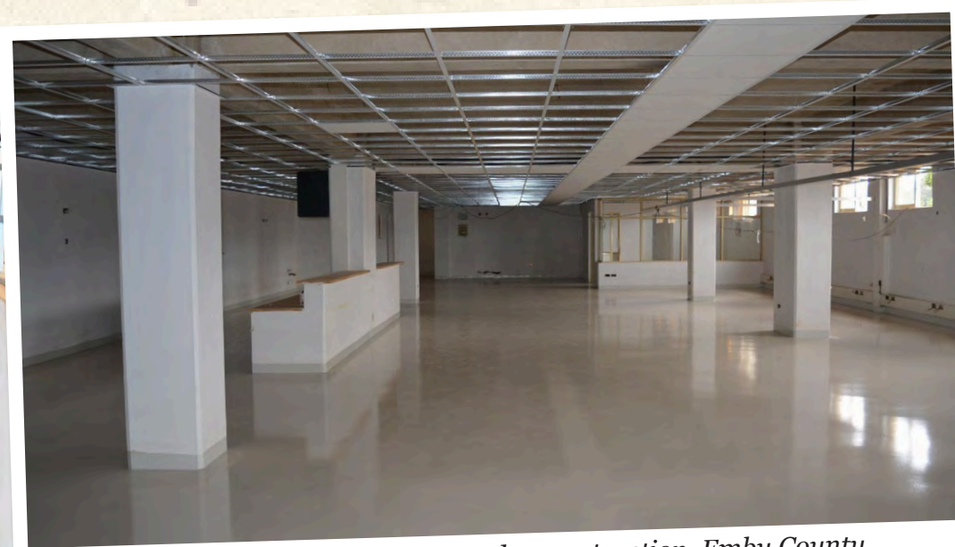
Embu Level 5 Hospital ICU under construction, Embu County