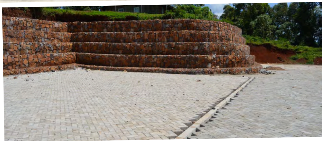
Kisii Town bus station and market under construction