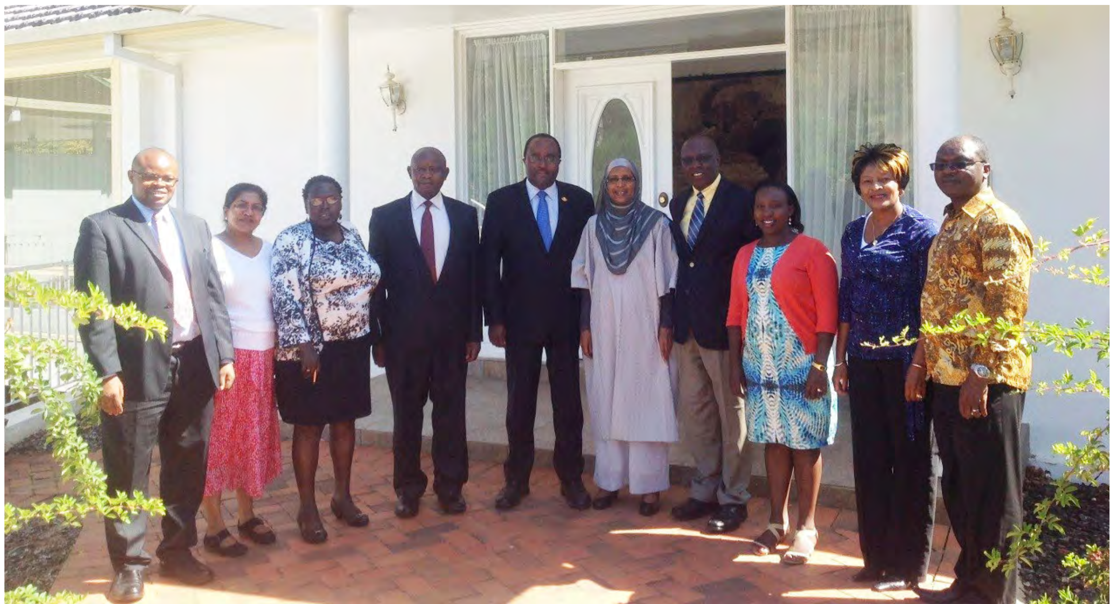
CRA Delegation visit the Kenyan High Commission in Australia- 2016