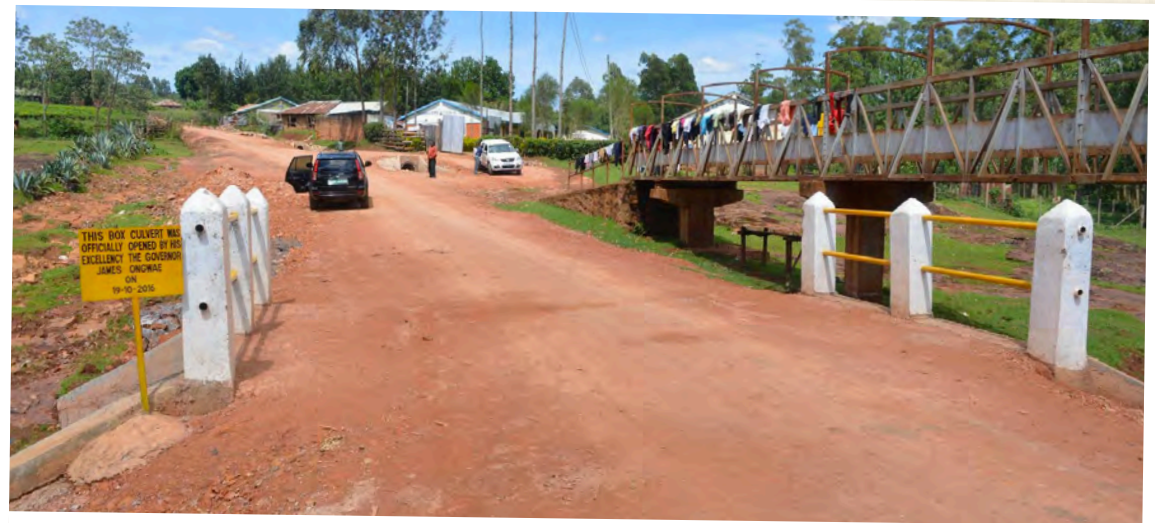
Box culvert and road constructed by Kisii County Government