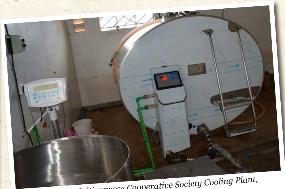
Kipsonoi Multipurpose Cooperative Society Cooling Plant, Bomet County