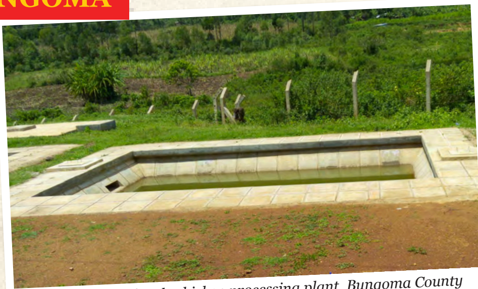
Fish ponds at Chwele chicken processing plant, Bungoma County