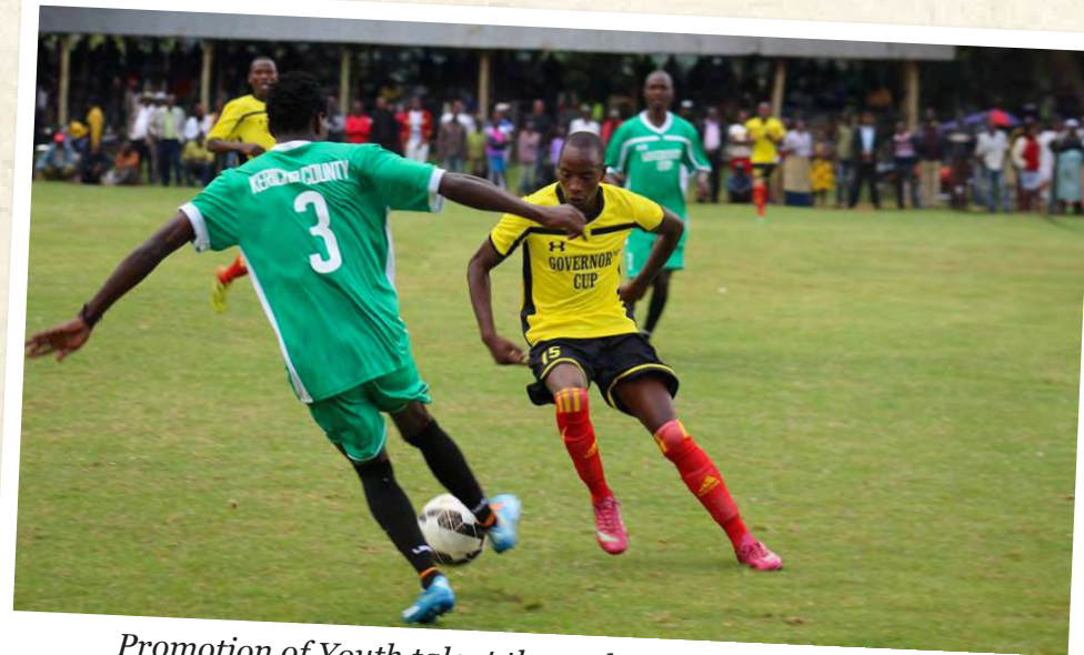
Promotion of Youth talent through the Kericho County Governor's cup Tournament