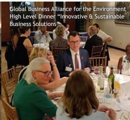
Global Business Alliance for the Environment High Level Dinner "Innovative & Sustainable Business Solutions"