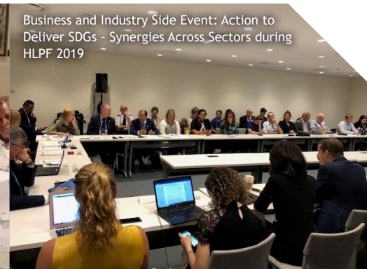
Business and Industry Side Event: Action to Deliver SDGs - Synergies Across Sectors during HLPF 2019

Food and nutritional security is closely connected with economic growth and social progress.