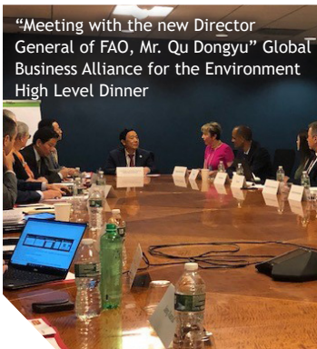
"Meeting with the new Director General of FAO, Mr. Qu Dongyu" Global Business Alliance for the Environment High Level Dinner