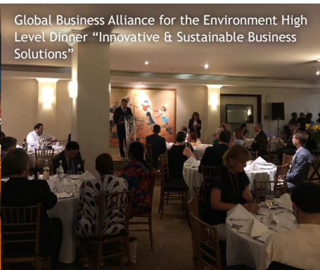
Global Business Alliance for the Environment High Level Dinner "Innovative & Sustainable Business Solutions"