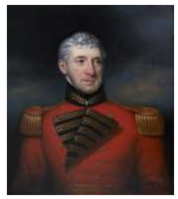
William Vane, 1st Duke of Cleveland

In 1809 William Bourne, a speculative developer, was granted a lease by the Duke of Cleveland that was a form of 'gentleman's agreement', never formalised, of the land in the Bathwick area by the river, adjacent to the marl pits. The original intention was speculative – to build houses on the site in the context of the proposed new town to the east of the city centre. Newport was also party to the agreement – he was the builder who was later to construct the Baths. William Vane, third Earl of Darlington, and later the Duke of Cleveland, had inherited the Bathwick Estate in 1808.