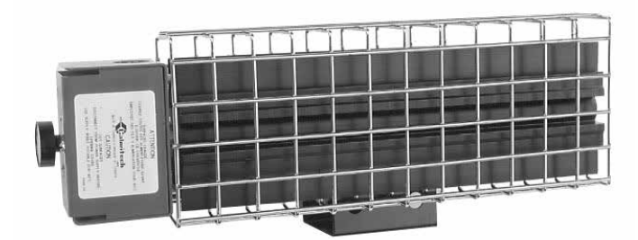
(Guard optional on some units)