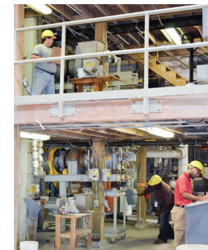
► Medium-Scale Granulation Pilot Plant

In full-scale fertilizer plant development projects, IFDC involvement often begins with assisting a client in preparing bid invitations, evaluating proposals, and drafting and negotiating the contract. During the detail engineering and construction phases, IFDC may continue to assist the client by reviewing the detail engineering, inspecting equipment during fabrication, developing plant operations and management skills, performance testing, and post-startup process and product optimization.