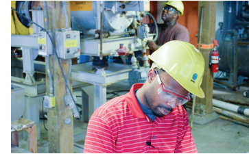
► Medium-Scale Dryer

IFDC process design packages provide the foundation for basic and detail engineering, equipment procurement, and the construction phases of fertilizer plant projects. IFDC