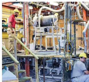
► Small-Scale Granulation Pilot Plant

IFDC uses a variety of techniques and financial analyses to provide clients with an unbiased, understandable, and technically competent analysis of a new venture.