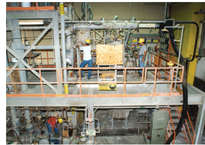
► Wet Process Phosphoric Acid Pilot Plant

competitors in the marketplace. These analyses are performed as a separate study or integrated into an overall market and supply study. IFDC can provide data on shipping and handling costs to the markets under consideration, as well as raw material supplies and other production cost components.