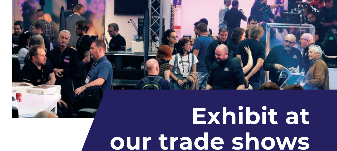
Exhibit at our industry leading trade shows, from our flagship PLASA Show in London to our popular regional Focus events. Each one sets the stage for cutting edge technologies, drawing influential professionals from around the globe.

Level of discount depends on membership type, see page 10 for more information.