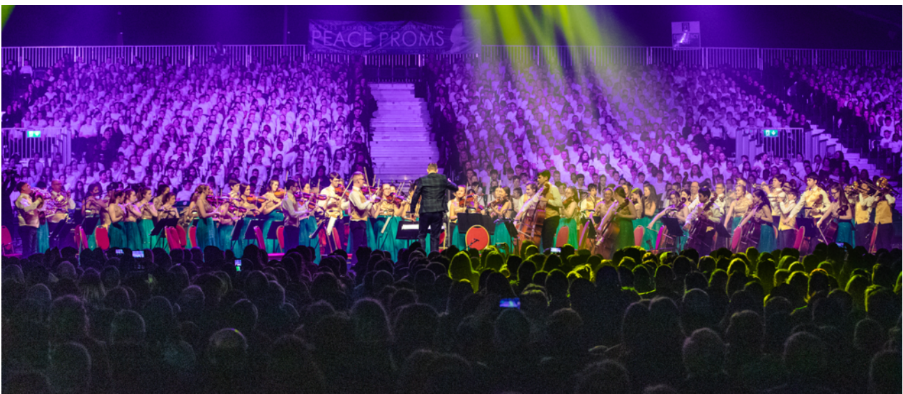
Above: CBOI Peace Proms at the SSE Arena Belfast 2019

The Cross Border Orchestra (CBOI) was established in 1995 as a peace initiative and is composed of over 100 exceptionally talented young musicians from all over Ireland and Northern Ireland. Over the past 24 years, the CBOI has played an important role in building and nurturing vital cross border and cross community relations and is regarded internationally and a flagship peace initiative.