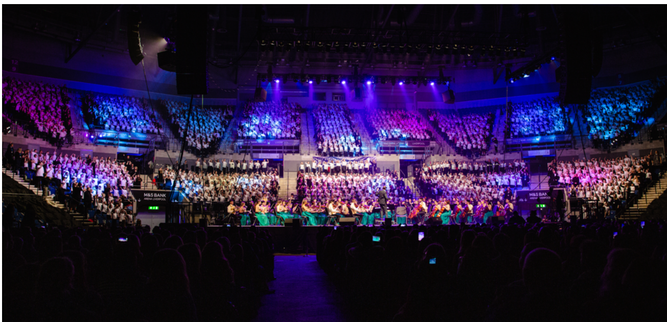
Above: Peace Proms at the M&S Bank Arena, Liverpool with 3,000 children in the choir 2019

Peace Proms makes the Arts more accessible to young people, their schools, families and the wider community. Peace Proms celebrates culture and diversity and promotes peace, unity and tolerance through music.