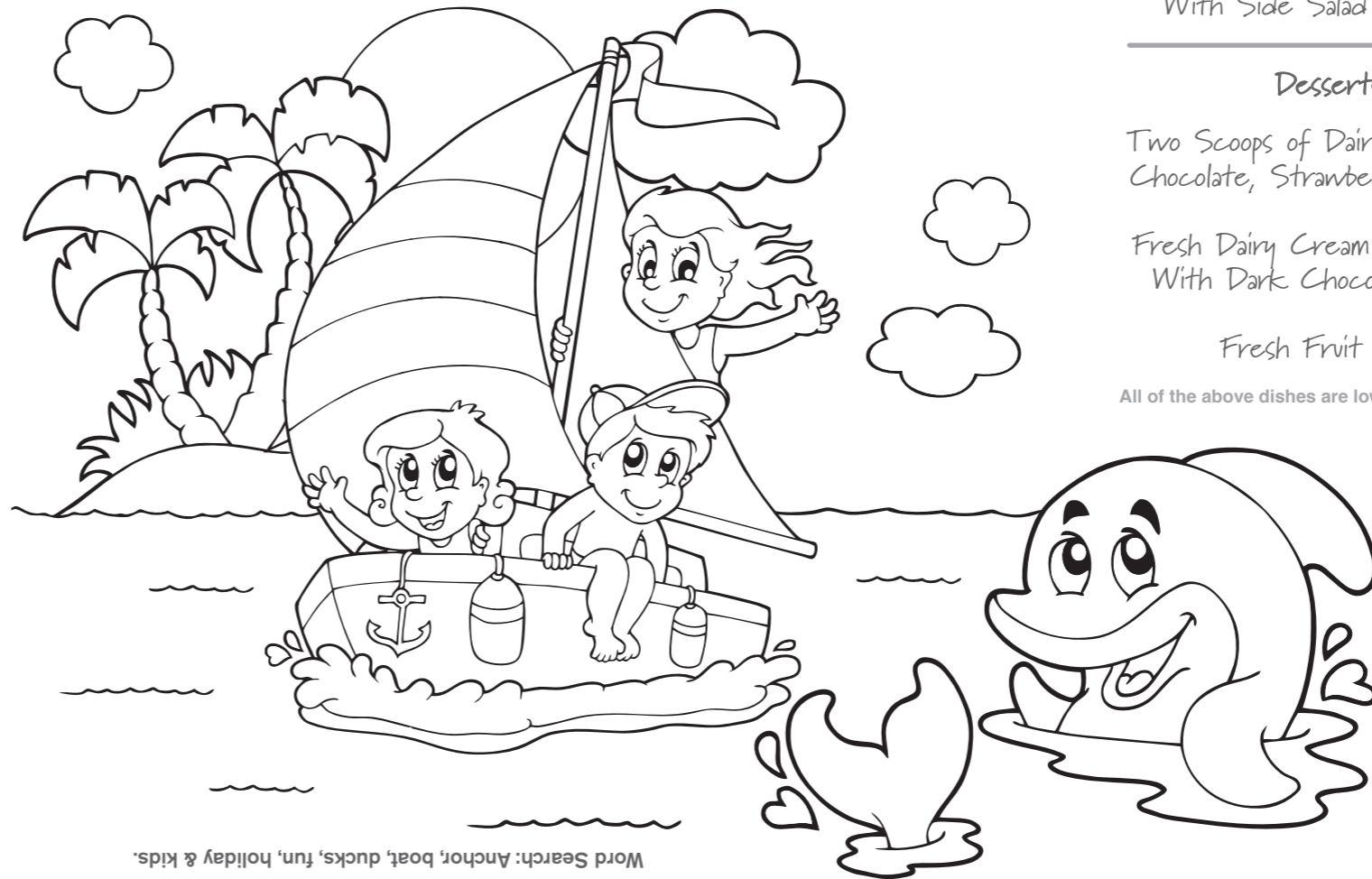
Word Search: Anchor, boat, ducks, fun, holiday & kids.