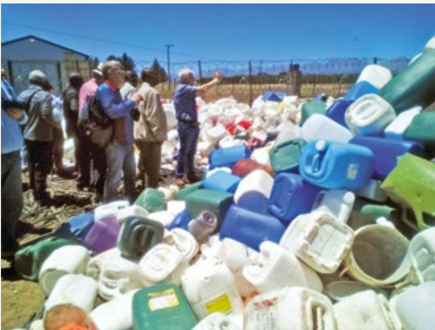
Meeting of the global Container Management Project Team in Cape Town Participants visiting a collection site

Another highlight during the year was the CropLife Container Management Project Team meeting with “Mature Programs” and “African Programs” which took place in Cape Town, South Africa. Within CropLife Africa Middle East we currently have one mature and 9 pilot programs in place, and all ten countries presented at this intervention. Two additional pilot projects are expected to be added in the coming year.