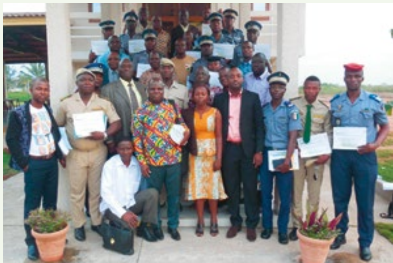
Officials from Customs, Police & the Pesticide Inspectorate during training in identification of counterfeit and illegal pesticides, Ivory Coast September 2015

Tackling counterfeit and illegal pesticides is essential to the safeguarding of innovation, investment in stewardship and regulatory initiatives by the CropLife network. Good ground was gained in this regard during 2015 with the focus on sensitization, awareness creation and capacity building for key stakeholders. This was to provide a foundation for sustainable solutions and for efficacy of the anti-counterfeiting operations.