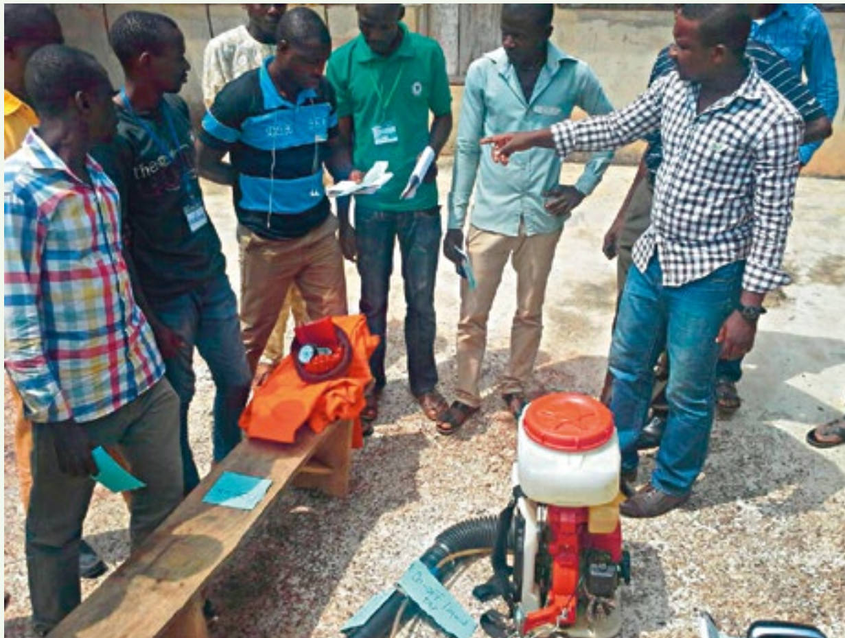
Training session on Application Equipment for SSPs in Ghana

According to Raphael, the SSP concept fits in very well with the 2SCALE activities: "By creating jobs for young men in rural communities, and by professionalizing crop protection, the SSP concept contributes to form competitive agribusiness clusters. It's also a private business-driven approach that is well aligned with the 2SCALE approach to inclusive agribusiness. Moreover, the SSP concept is interesting from a gender perspective: SSPs can be mobilized by women farmers who must not spray pesticides, but still need to use herbicides on their plots to reduce the time-consuming burden of hand weeding, or using fungicides and insecticides to prevent crop damage."