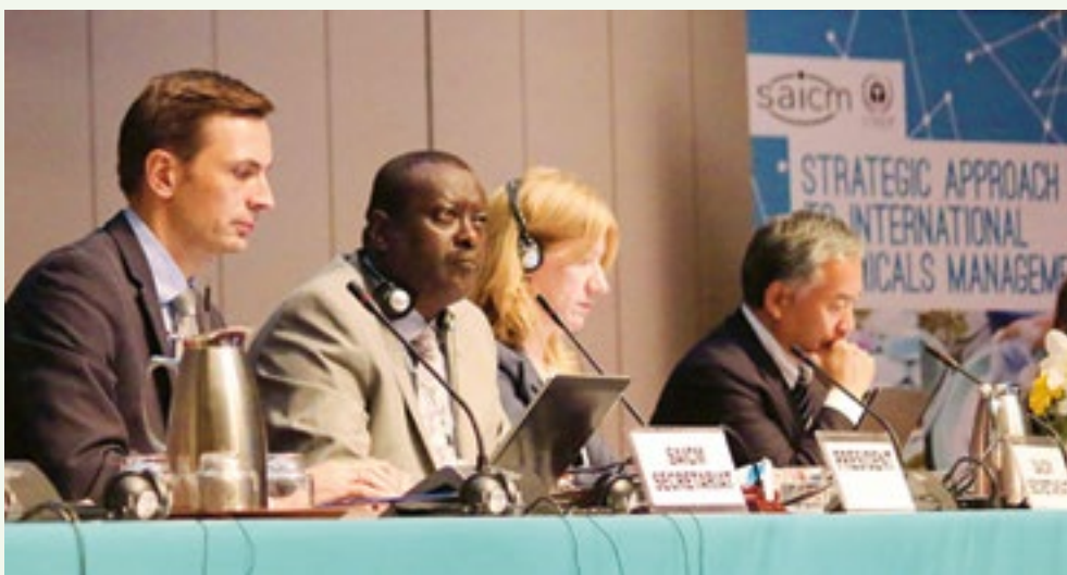
President & SAICM Secretariat during ICCM4 28 September – 2 October 2015

Explaining these differences remains the industry's focus during hub and regional meetings' deliberations with the various stakeholders on the need to stick to the risk assessment approach as a basis to regulate pesticides. This takes into account the huge amount of information available on the substances such as exposure, dosage and potency. This is in line with the Paracelsus' principle, the father of toxicology, that "the dose makes the poison": a product or substance only produces a harmful effect when its dose exceeds a living being's ability to cope with it. This was expressed in industry's participation, among other stakeholders, earlier in the year, in the European Union's public consultation process that is about establishing criteria to define endocrine-disrupting properties. Although the process of the assessment is not finalized, the implications to the agri food value chain remain a key concern for the association. Moreover, other regulatory authorities have different views including the fact that this is not a new area of regulation, leaving our region on the receiving end as Europe remains a key destination market for export agricultural commodities.