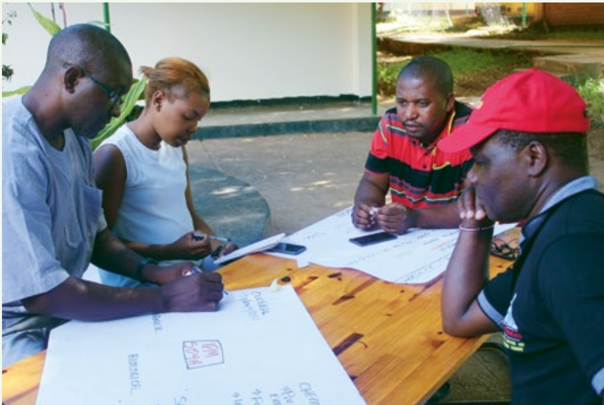
IPM training for SSPs in Zambia

In 2015, the Spray Service Provider (SSP) concept was taken to another level with the introduction of Integrated Pest Management (IPM) training for SSPs. So far, approximately 520 SSPs in Côte d'Ivoire, Ghana, Nigeria, Kenya, Uganda, Egypt, Malawi and Zambia have followed a special 2-day course on IPM.