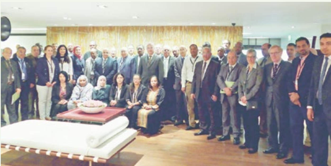
Participants at the NAME Hub & Regulatory Meeting held in Cairo in October 2015