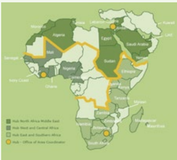
National CropLife associations and the sub regional hubs

It is our association's mission and objective to motivate and engage with as many partners and stakeholders as possible to help in the promotion and development of state of the art technological solutions needed for productive and sustainable agricultural systems in Africa and the Middle East. Despite the fact that the membership of multinational companies in national associations is rather limited across the region, it is the ambition of our association to convince and motivate all local members to observe and implement the same international standards and apply all stewardship measures and activities as defined by the International Code of Conduct on Pesticide Management to which all members of the CropLife network are committed.