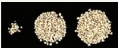
Single cowpea plant yield for a farmer's variety and two biotech varieties under heavy insect pressure in Burkina Faso.

Research into African staple food crops continued in both West and East Africa. In West Africa, field trials and efficacy tests showed that insect-resistant biotech cowpea is highly effective at controlling the extremely destructive Maruca Vitrata insect, which, if uncontrolled, can reduce production by up to 80 percent. Public sector technology developers believe this insect-resistant variety could be in the hands of farmers in Burkina Faso, Ghana, and Nigeria in the next three to four years. Public-private research initiatives in East Africa have focused on developing disease-resistant and biofortified biotech varieties of cassava and banana, both food staples for some of the most marginalized and food-insecure farmers in the region. Both crops have been plagued by persistent diseases, including cassava brown streak and bacterial wilt in both cassava and bananas. East African research teams have conducted field trials of virus-resistant varieties of cassava and bananas with favorable results.