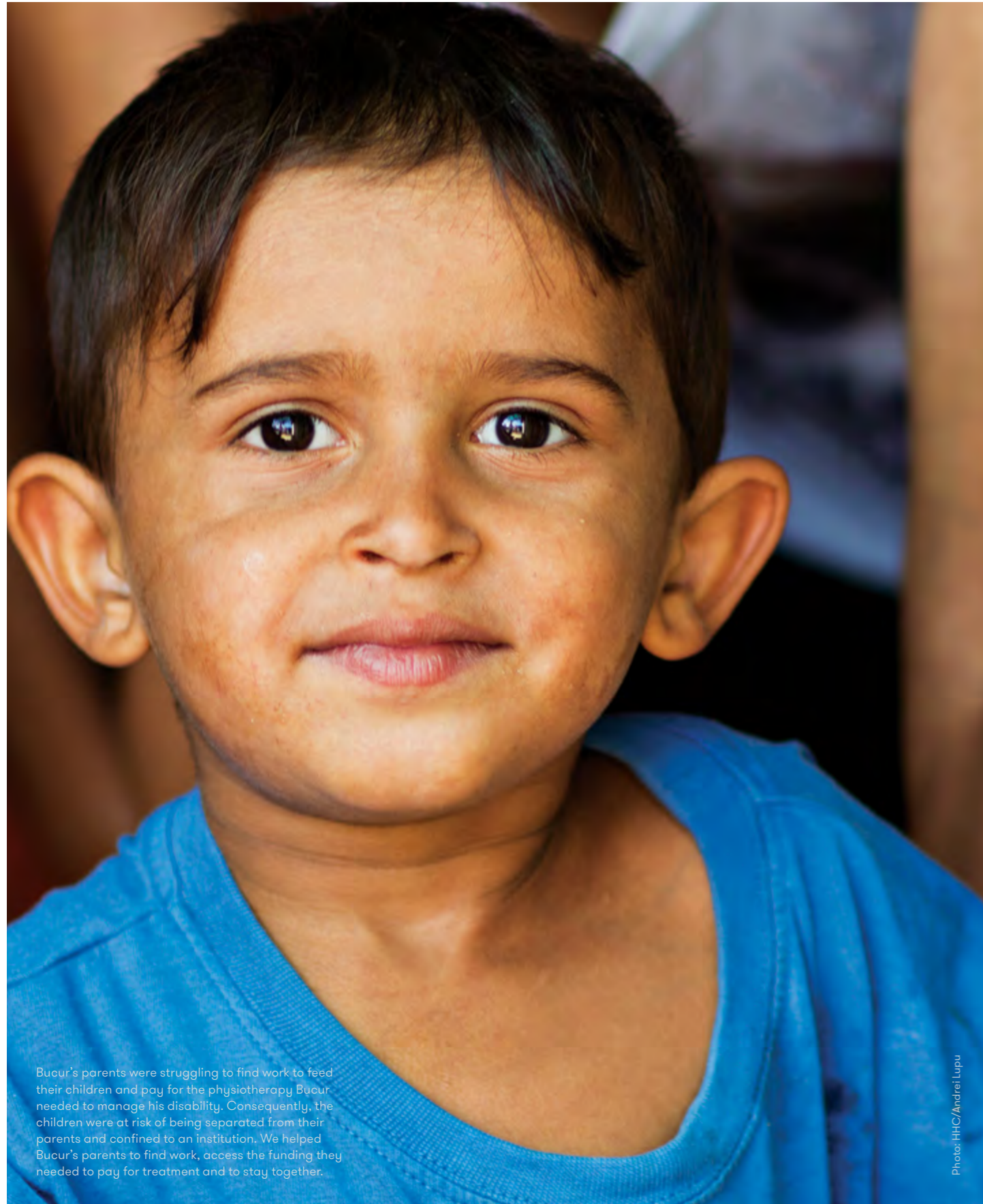
Bucur's parents were struggling to find work to feed their children and pay for the physiotherapy Bucur needed to manage his disability. Consequently, the children were at risk of being separated from their parents and confined to an institution. We helped Bucur's parents to find work, access the funding they needed to pay for treatment and to stay together.