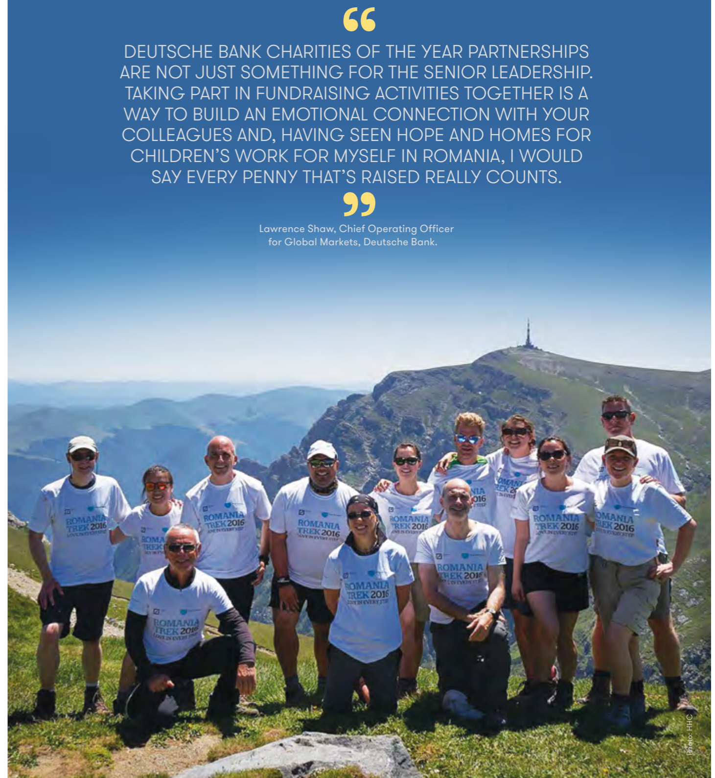
Deutsche Bank staff on a fundraising trek through Romania in July