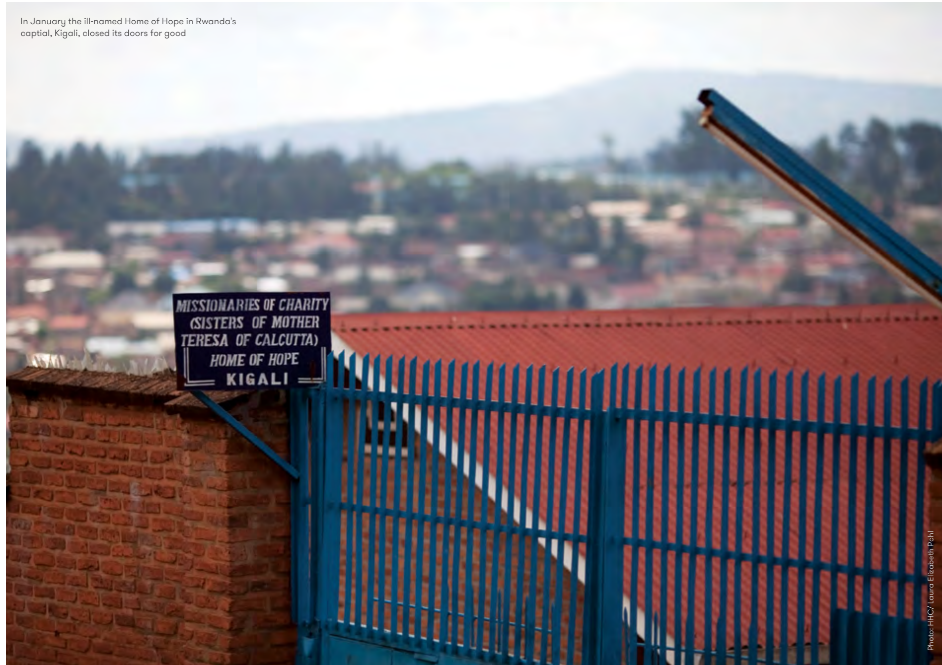
In January the ill-named Home of Hope in Rwanda's capital, Kigali, closed its doors for good

In 2016 we set ourselves five priorities, designed to bring us closer to achieving our mission. Here we highlight some of the year's key achievements.