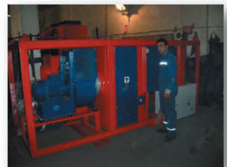
Our 18000m 3 /h Dehumidifier for Africa