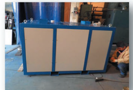
Our 3000m 3 /h Dehumidifier for Textile Mill