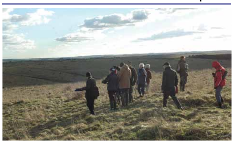
Members of Bradford on Avon museum research group and Imber conservation group on their recent field trip to Cheverell Down

Spotting ancient field boundaries isn't easy, members and friends of the museum research group found on a recent visit to Cheverell Down. You need the right weather, the right light and a break in use of the site – to the west of Salisbury Plain – for military training.