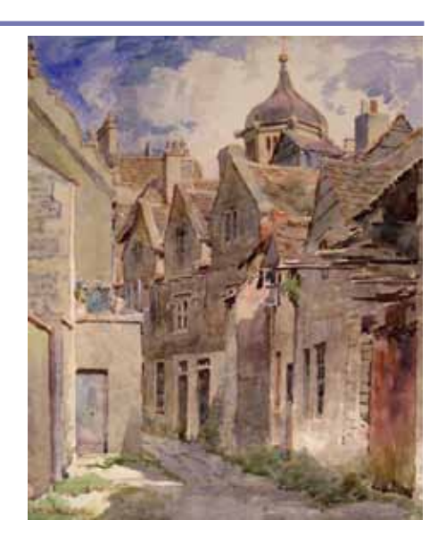
Bullpit by WH Allen (the original is in Devizes) and we have another similar watercolour from around 1900 on display in the museum.

The subject was clearly a popular one – the painting reproduced here is a view dating from around the 1920s of Hangdog Alley from the