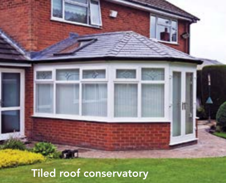
Tiled roof conservatory

“We are very pleased with the conservatory from you, all the trades involved were polite and tidy. All mess was minimal and taken away. The quality of the work and the product is of a very high standard. We are most pleased and would not hesitate to recommend you at DWL. Many thanks.”