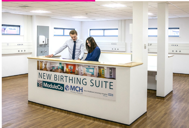
Special Care Baby Unit

A spacious 8-bed special care baby unit was incorporated into the natural birthing centre providing space for a large nurse station and an isolation room.