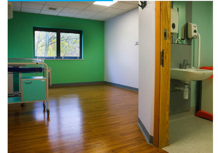
Post-Natal Rooms With En-Suite Bathrooms