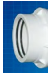
Type B Double O ring