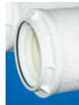
Type A Single O ring