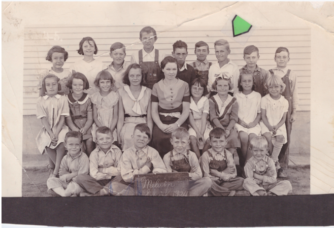
Melvin School Class of 1930