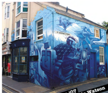
Brighton '07