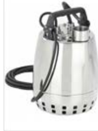
MANUAL Submersible pump.