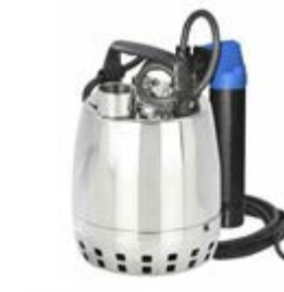
AUTO – Tube Float Submersible pump.