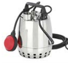
AUTO – Swing Float Submersible pump.