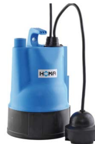
AUTO – Puddle Sucker Submersible pump.