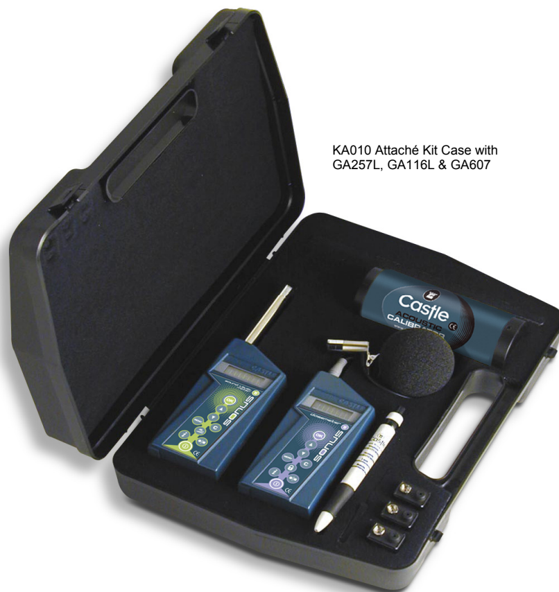
KA010 Attaché Kit Case with GA257L, GA116L & GA607