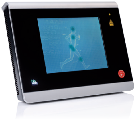
LEONARDO® DUAL 45 universal & ingenious