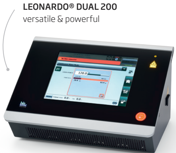
LEONARDO® DUAL 200 versatile & powerful