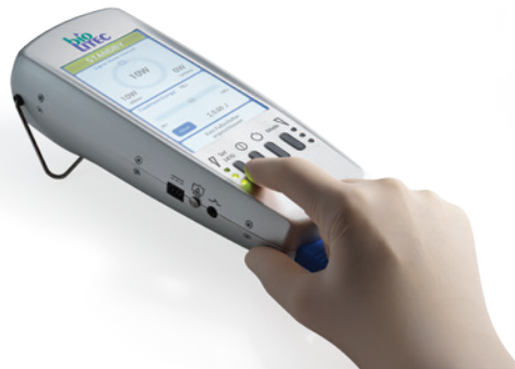
LEONARDO® Mini basic & specialist