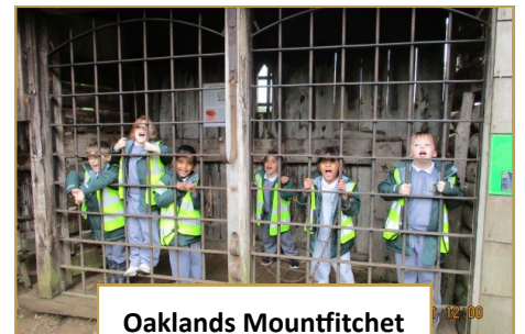
Oaklands Mountfitchet Castle

Children in Year 1 at Oaklands took a trip to Mountfitchet Castle where they saw how the villagers lived in Medieval times. They got to try on armour, climb castle towers and pretended to be prisoners stuck in the castle prison and stocks. It was wonderful to see how excited the children were to learn about history and how much information they retained to share in class the next day.