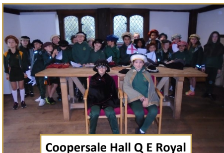
Coopersale Hall Q E Royal Hunting Lodge

The pupils enjoyed getting out of the classroom and seeing all of the exhibits. It was a fantastic day and many members of the public commented on the children's outstanding behaviour.