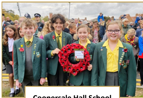
Coopersale Hall School

Coopersale Hall pupils came together to create a whole school Remembrance Display in which each year group and class was represented.