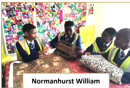
Normanhurst William Morris Gallery

Normanhurst pupils from Years 5 and 6 took a trip to KidZania in Westfield London shopping centre, where they had fun and took part in different jobs while earning 'kizdos'. The small scale replica city is packed with fun activities to do and gave the pupils the opportunity to try out lots of different jobs that they might try as future careers. The children particularly enjoyed being firefighters for the day where they used water hoses to extinguish the fake blaze.