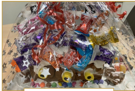
Running and Raffles

Pupils and staff made donations to wear jeans to school for the day, raising money for the Jeans for Genes charity.