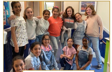
Jeans For Genes

Pupils dressed up in yellow for our annual Children In Need fundraising. Braeside School Council organised a fantastic way to raise some additional