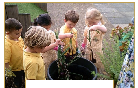
Coopersale Hall School

As part of their topic on Autumn UK took tree rubbings which were then turned into autumn trees using finger painting for the leaves.