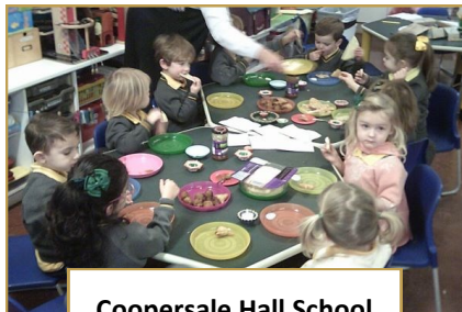
Coopersale Hall School

Normanhurst took their Art lesson outside on November 5th, creating a giant firework-inspired art painting, using their wellies and sticks to spread the paint around on the paper.