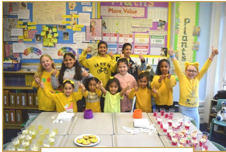
Children In Need

Inspired by the London Marathon, Normanhurst pupils raised money for Samaritans purse by running 26 miles.