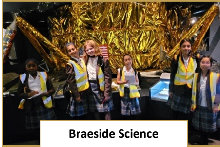
Braeside Science Museum

and painting before having a go at relief printing themselves.