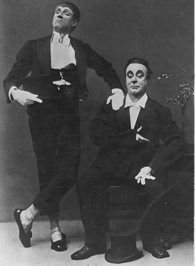
282.C. BEAGLES' POSTCARDS. Aug 1916 MR. ALFRED LESTER & MR. GEORGE ROBEY. IN "THE BING BOYS ARE HERE."