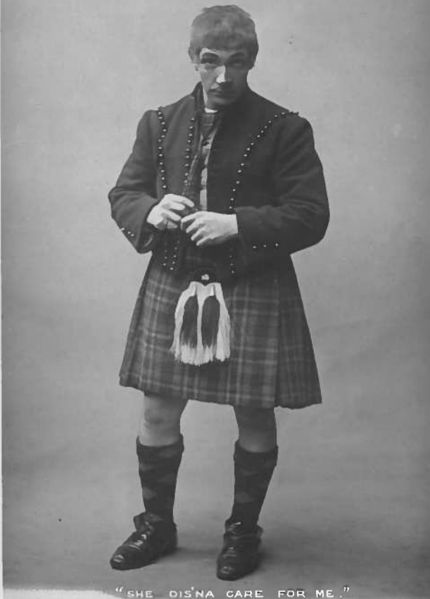
PHILCO SERIES 3456 C MR. HARRY LAUDER AS THE "PAGE" IN "CINDERELLA" "SHE DIS'NA CARE FOR ME."