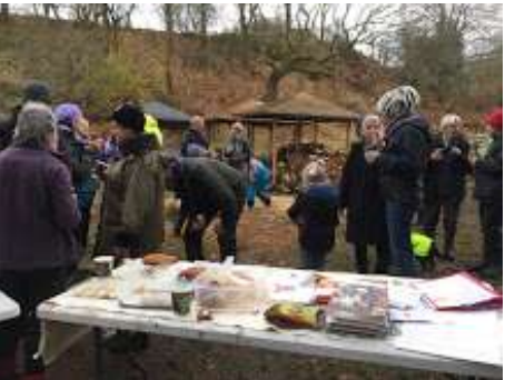
You can't plant trees without tea and cake

shall see the results in about 5 years' time! But during that time these little trees will capture carbon far more effectively than the much older and mature trees on site. Young trees are 25% better at absorbing carbon dioxide, so planting 100 trees where there were none is going to contribute