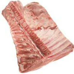
Veal Loin 2659