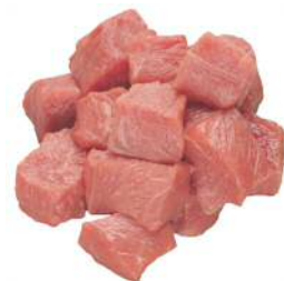
Diced Veal 2955