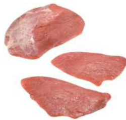
Veal Topside Steak 2969