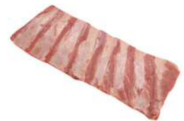
Veal Spare Ribs 2689