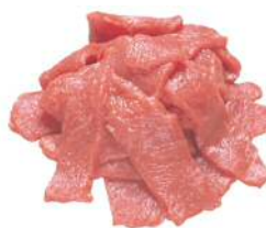
Veal Strips 2957