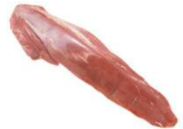
Veal Tenderloin 2662