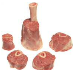
Osso Bucco Veal 2691