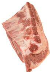
Veal Point End Brisket 2955