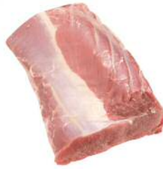
Veal Cube (Ribeye) Roll 2664