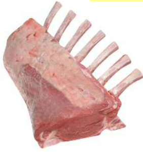
Veal Frenched Rack 2981