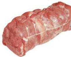
Veal Boneless Rolled Shoulder 2961