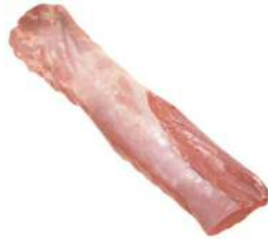
Eye of Loin 2661