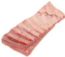
Veal Short Ribs 2688