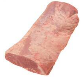
Veal Striploin 2660