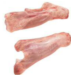
Veal Shanks 2690