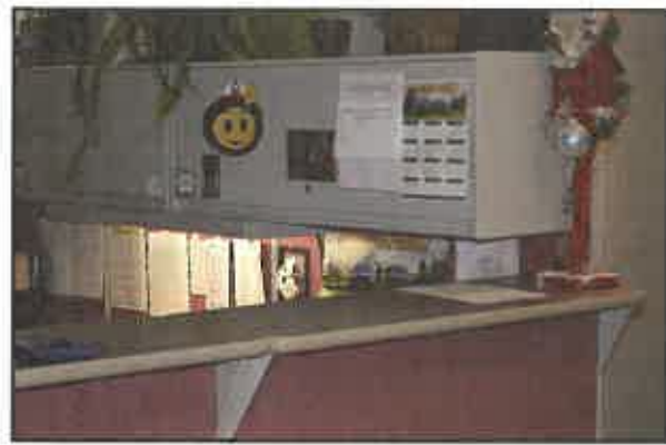
Above: Workstation behind wall from front door.