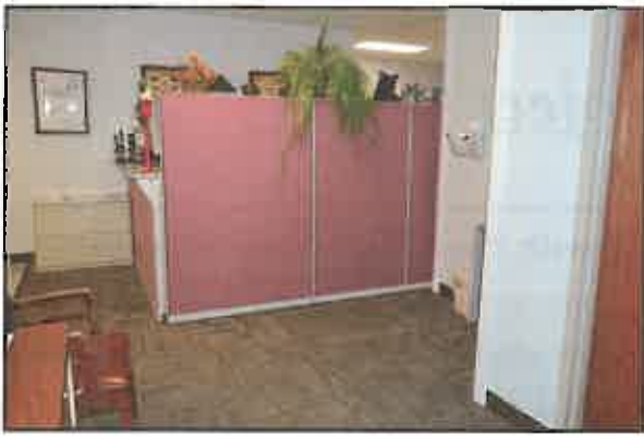
Above: Coming in the front door from the lobby.