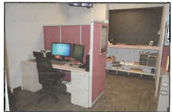
Right: View of the new scanning workstation and the front window from inside the office.

It was decided late in 2016 that the front office was in need of updating . As the social attitude toward law enforcement has changed, thought was given to the safety and security of the Sheriff's Office staff. Technology and the way records are stored also has changed in the past few years. Most records are now stored digitally instead of on paper. Also, the carpet was in need of replacement as that area gets heavy traffic.