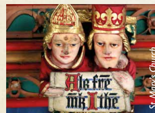
St. Mary's Church

Tickets from East Riding Theatre box office