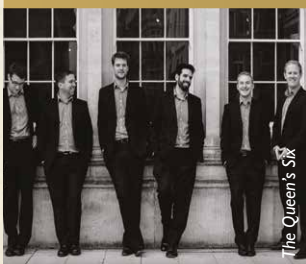
The Queen's Six