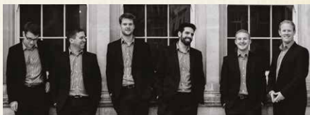
The Queen's Six - A Capella

Featuring some of the UK's finest young professional musicians