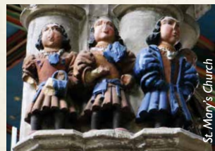
St. Mary’s Church

Tickets from East Riding Theatre box office