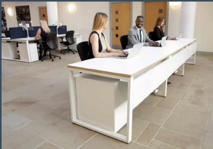
Side-to-side 3 Person Desk Configuration

Pico is a comprehensive desk system with configurations and options available to suit every office. From an executive single-person office, to a large capacity open-plan workplace, Pico adapts to the company's exact needs.