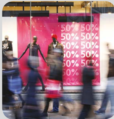
In-store POS display