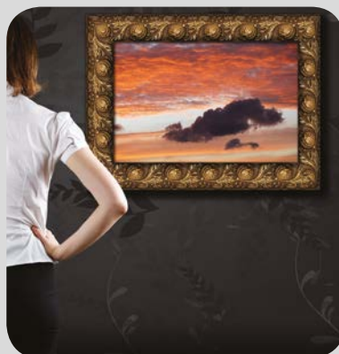
High quality prints and posters