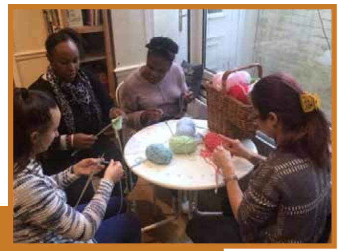
Learning together at the new WAF HUB

One of the most amazing things is being a part of the team at "Creations", the WAF Charity shop on Prince Regents Lane. It is not only a functioning shop, where items purchased generate income for the charity, but since September we have opened the "WAF HUB", a place for our mums to come and chat and put their hidden talents of art, craft, and creative design to good use making items to sell.