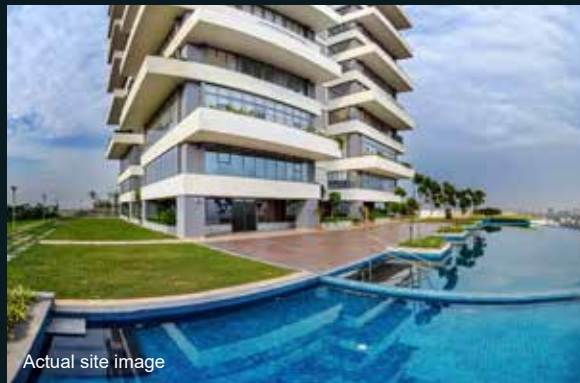
Actual site image