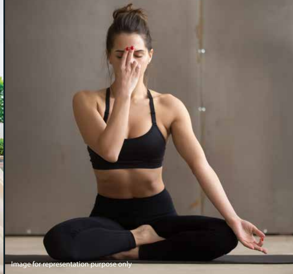
Image for representation purpose only