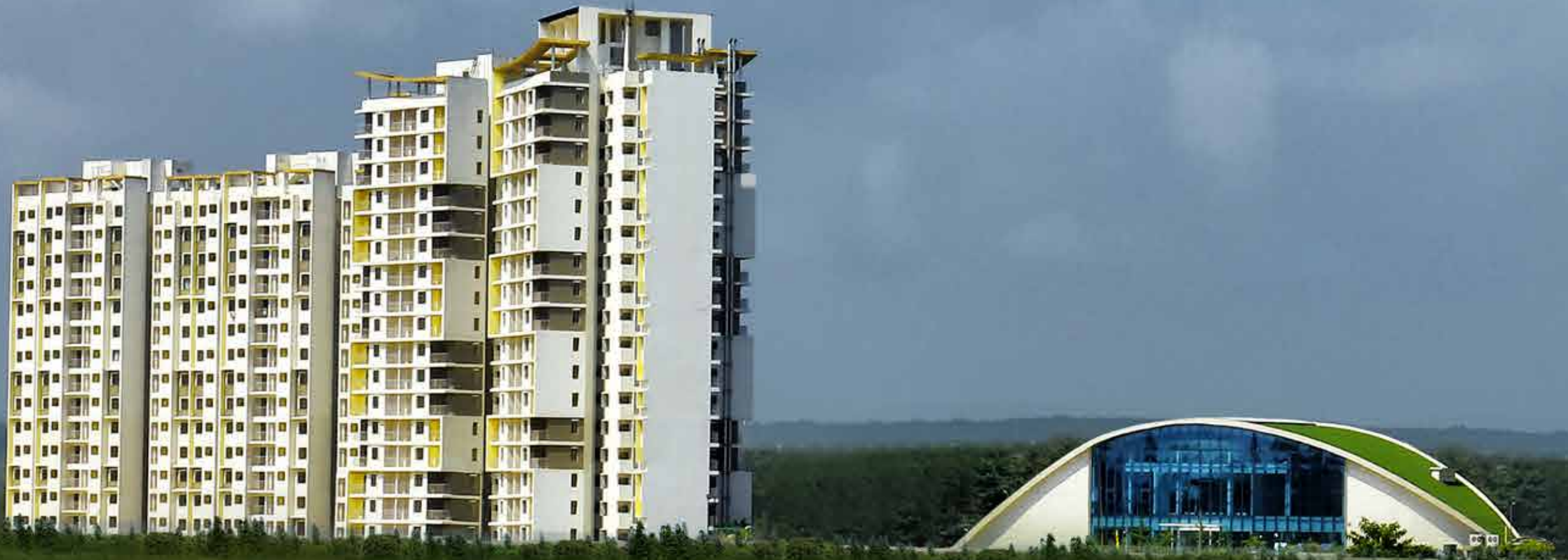
Actual Image Shot on Location

TATA Ariana is a dazzling one-of-a-kind leaf shaped architectural design by WOODS BAGOT - a leading International Architectural firm known for their future oriented projects. Ariana is inspired by the freshness and geometry of a leaf. The leaf analogy forms the conceptual pattern to this linear shaped site. The main buildings are located within the leaf bodies with integrated landscapes in between.