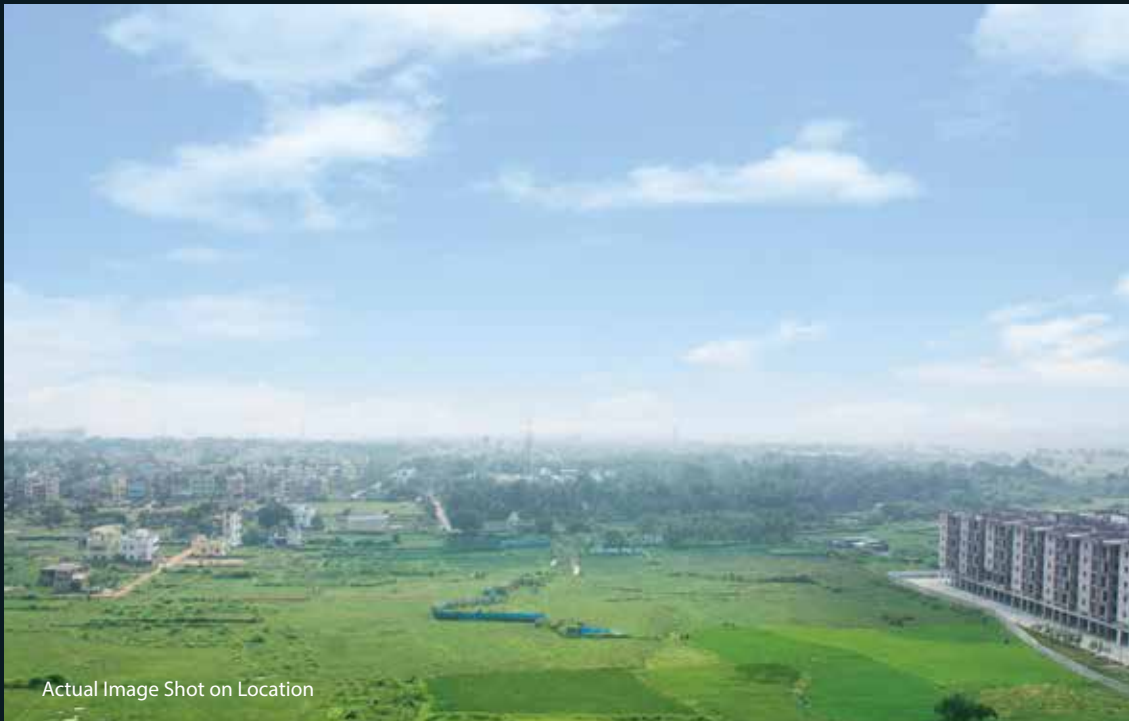
Tower 1 - City View