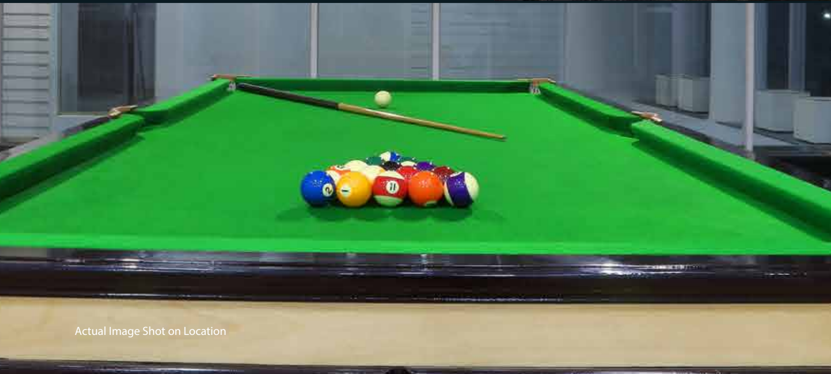
Actual Image Shot on Location