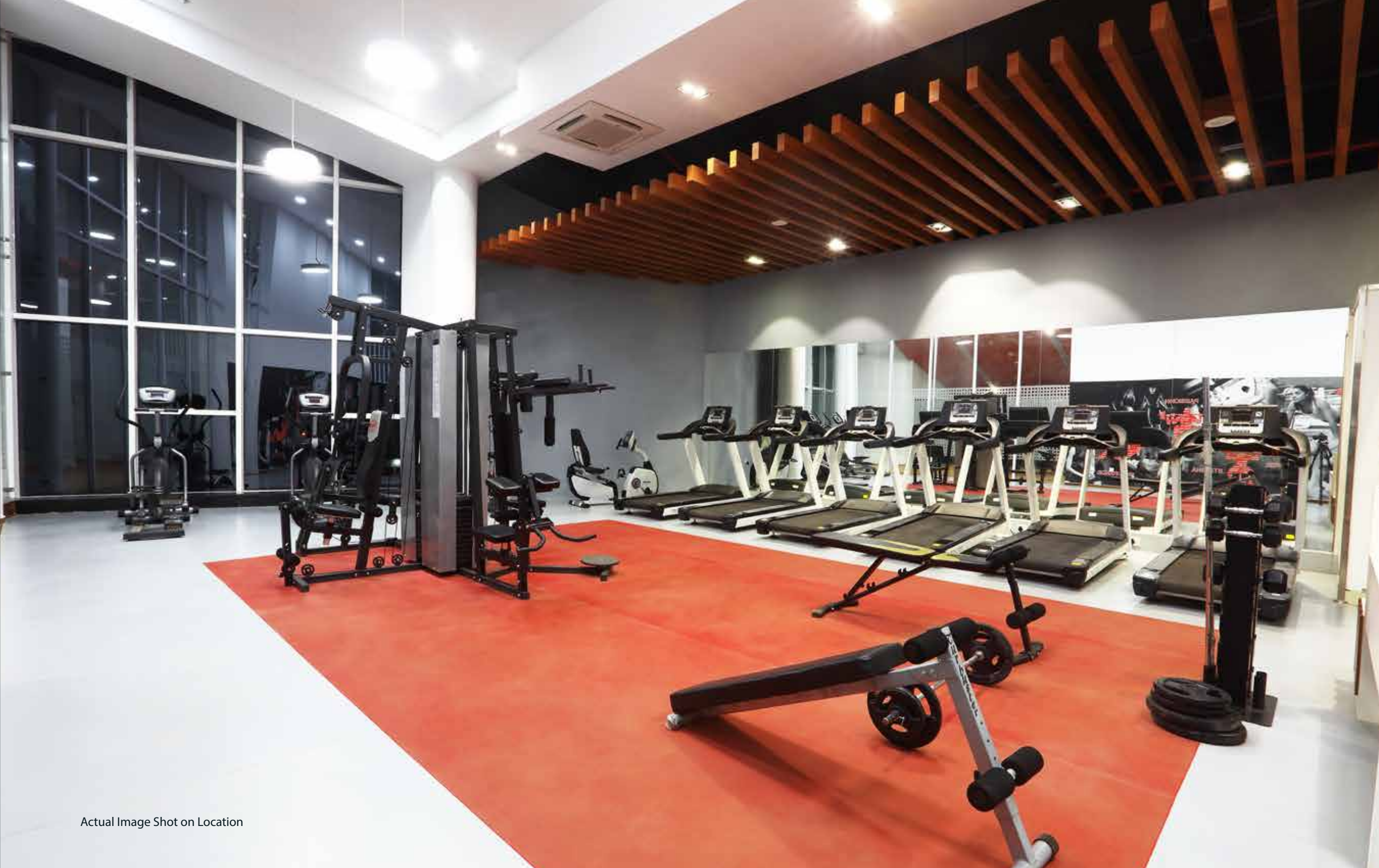
Actual Image Shot on Location