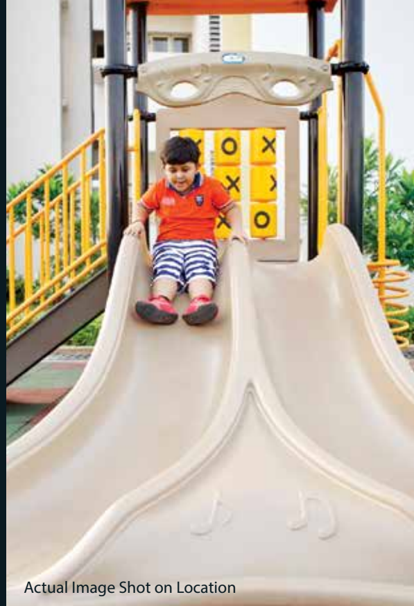
Actual Image Shot on Location