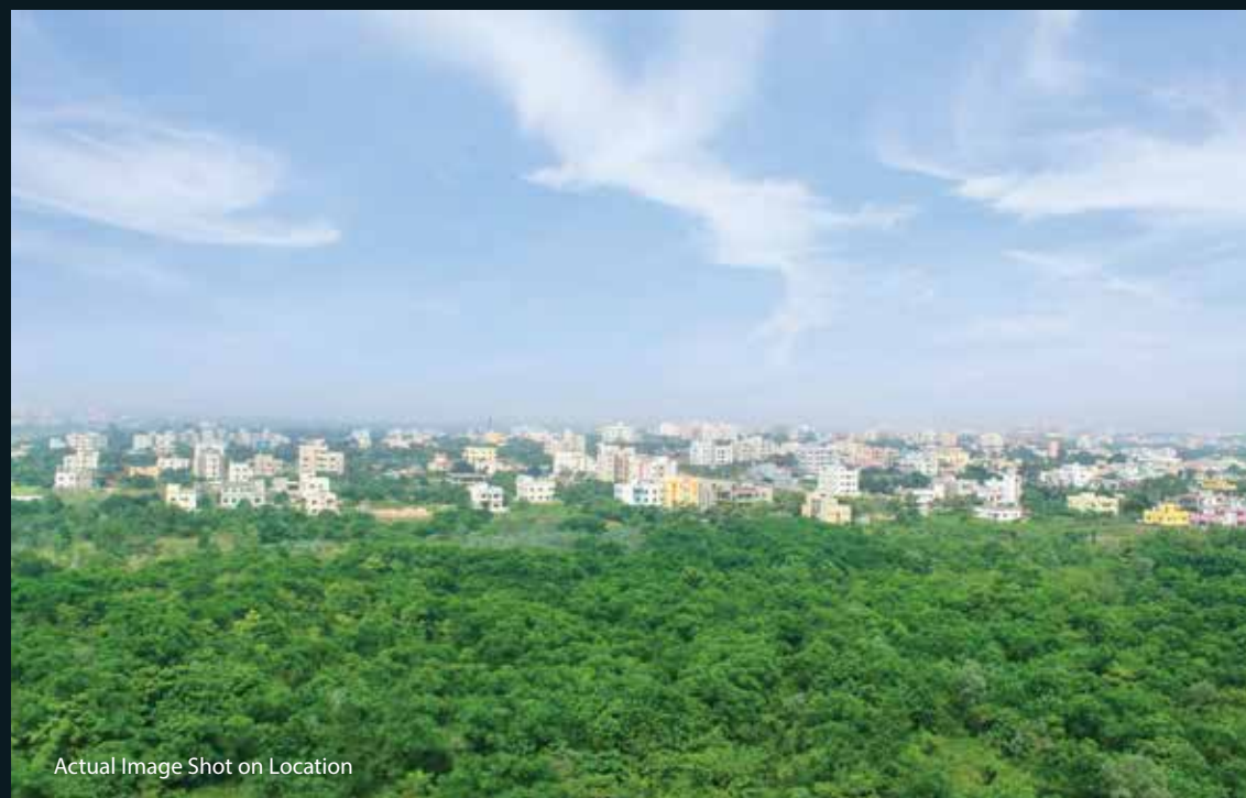
Tower 12 - Forest Reserve View