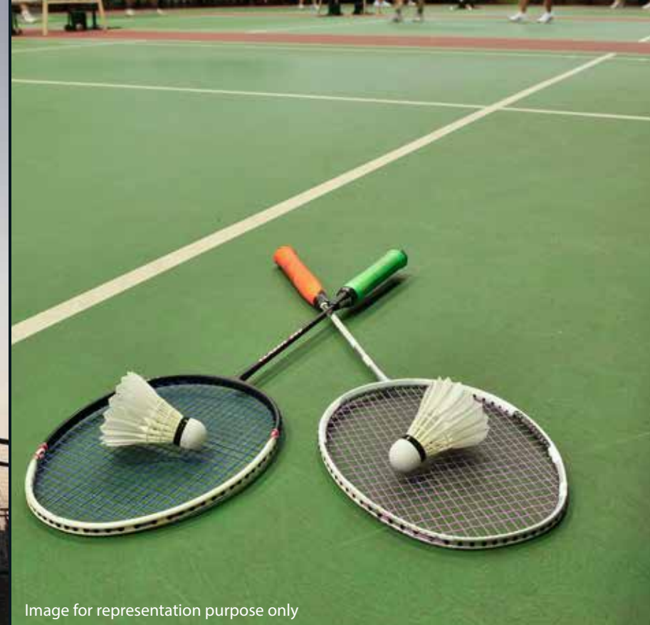
Image for representation purpose only