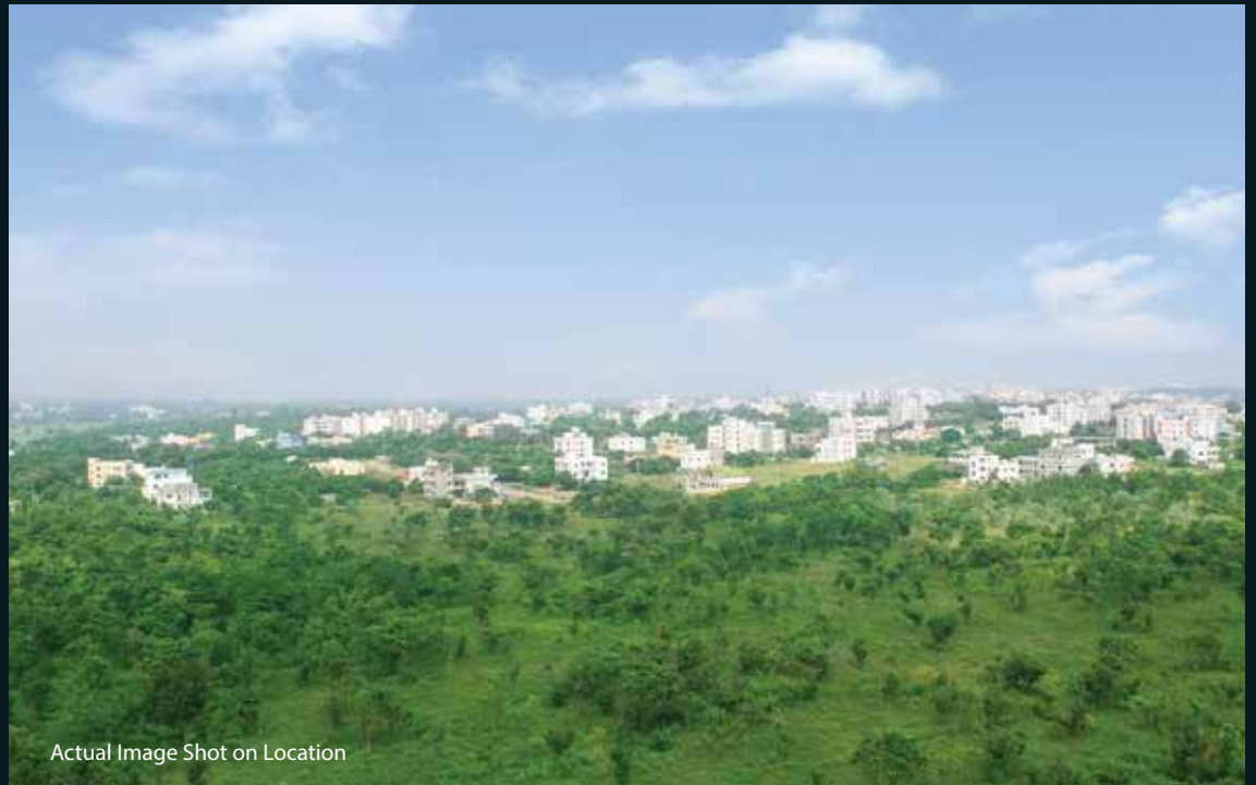
Tower 1 - Forest Reserve View