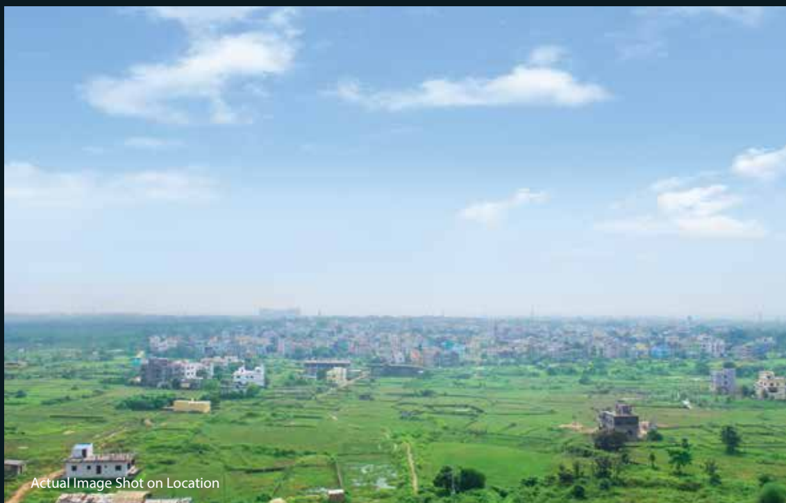
Tower 12 - City View