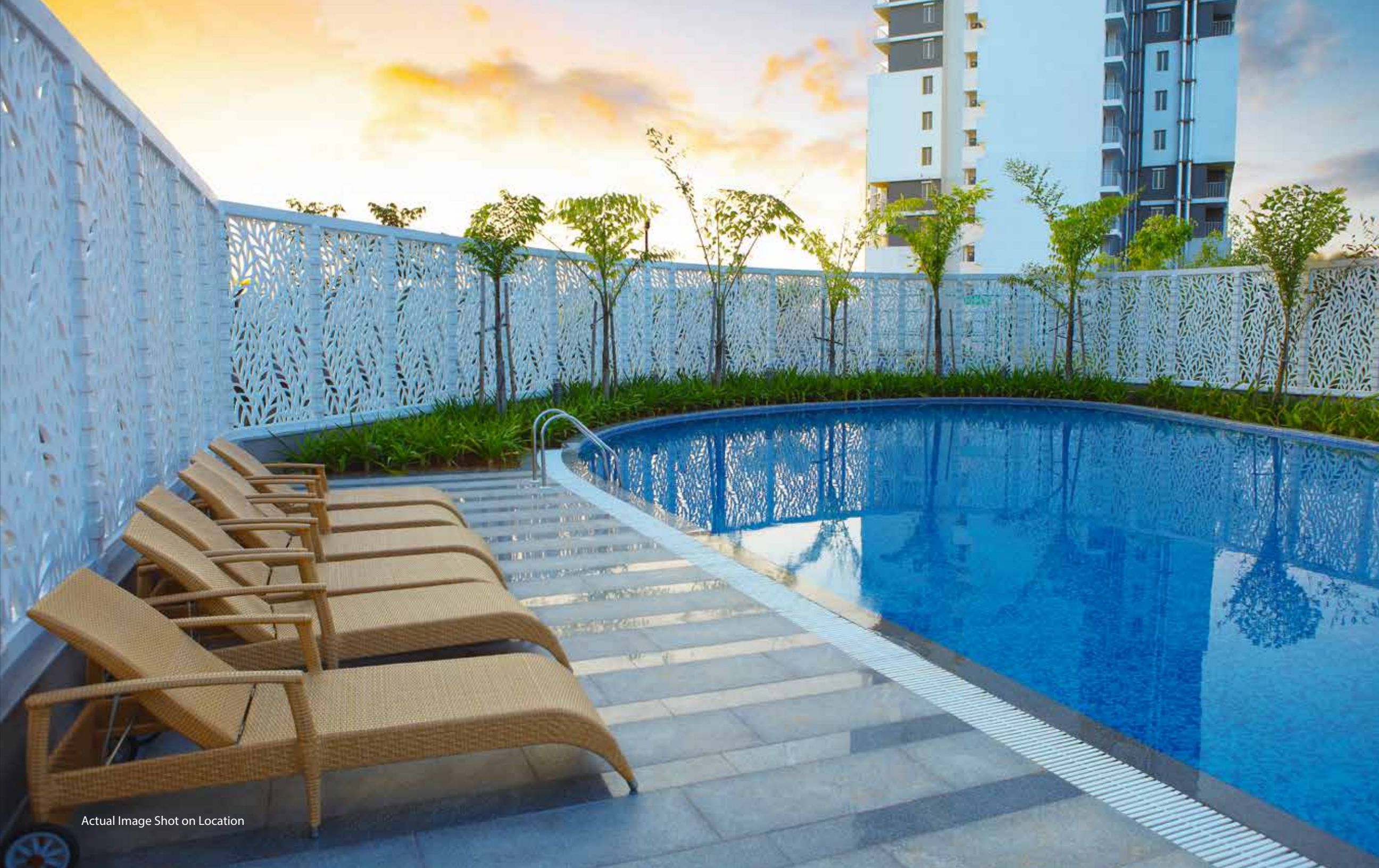
Actual Image Shot on Location