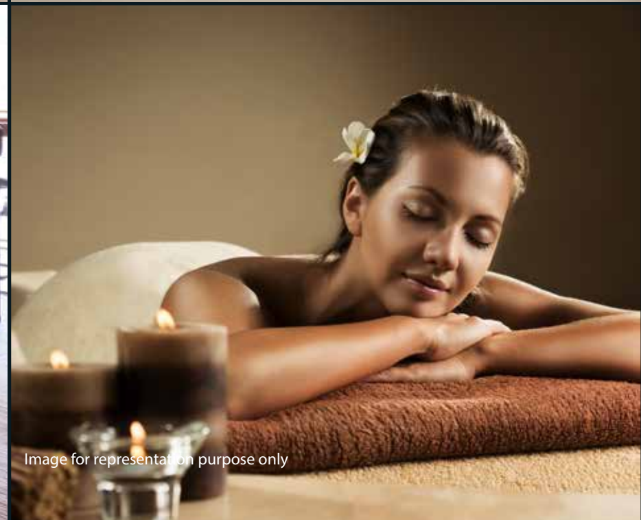
Image for representation purpose only