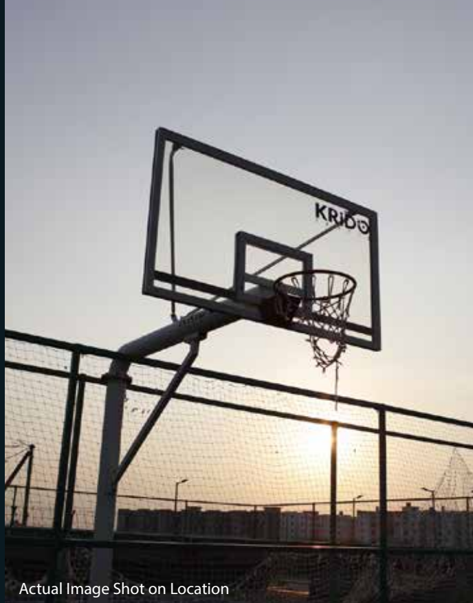
Actual Image Shot on Location