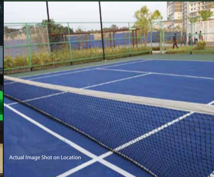
Actual Image Shot on Location