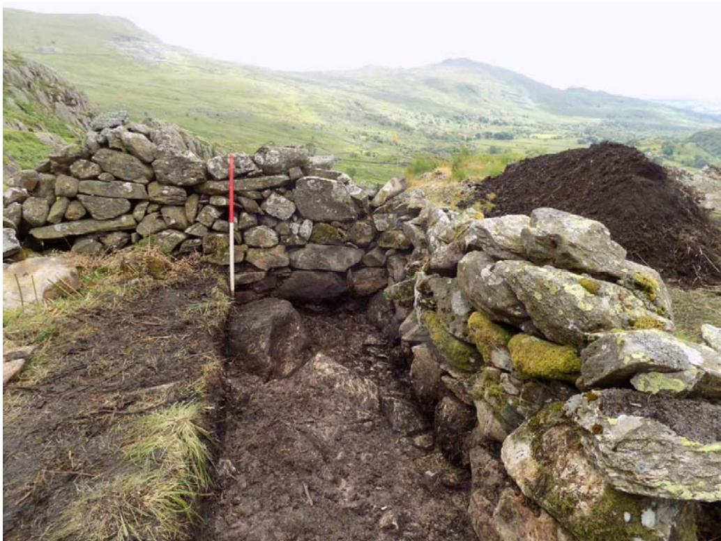
Plate 43: The south wall of Tongue House B, showing the remains of the gable (1m scale)

8.3.11 Long House Close: the site at Long House Close was occupied again after a long hiatus. It was presumably chosen because it offered, in the form of the Bronze Age site, a ready-made building platform in an area cleared of stone, and with clear views down the valley. Other excavated upland sites have provided evidence of levelling before medieval and post-medieval buildings were constructed, as at Croseedale in Tebay (Hair and Newman 1999, 143). A double-celled stone structure with cross-passage was constructed on this levelled area, one of two on the site (Plate 44). Two radiocarbon determinations, one from under a stone surface and one from a pit immediately north of the building, produced dates of cal AD 1415-1450 (337±24 BP; SUERC-81433) and cal AD 1485-1645 (327±24 BP; SUERC-76928), respectively. The finds from the site also suggest occupation in this period. There is, however, evidence that the eastern part of the building was refurbished, if not rebuilt (Phase 2B), perhaps in association with the semi-enclosure surrounding it.