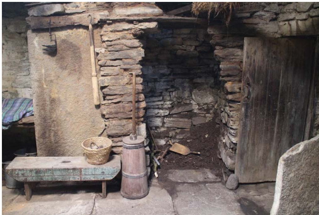
Plate 42: Peat store in an unrestored example of a traditional 'firehouse' at Kurbuster Museum, Orkney

8.3.9 A peat moss was situated within the confines of the enclosure (Palaeo-Site 2; Fig 23) surrounding Tongue House A, and may have been exploited for fuel. In contrast to the extensive peat deposits in the Pennines, those in the Lake District are less widespread (Winchester 2000, 126) and are often contained in settings like that of Tongue House High Close. The historical record suggests that these more discrete, and very much more finite, peat resources were subject to control throughout the period that Tongue House A was occupied ( ibid ), but commoners using the land would typically have rights of turbary, allowing the cutting of peat. Even at the end of the nineteenth century, something of the importance of peat can be seen on the 1892 six-inch to one-mile Ordnance Survey map of the area, which depicts individual peat beds on the fell-side.