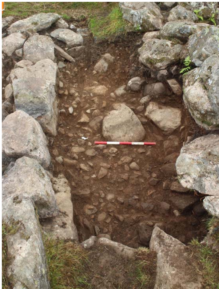
Plate 32: Layer 1046 , butting against wall 1014 (left), yet continuing below 1018 (right)

5.5.22 Both the pre-excavation survey and the excavated plan of the house demonstrate a significant difference in the structural form of the western and eastern cells (Plate 29). The western cell has very ill-defined and insubstantial walls comprising only a single course, and only part of the western gable has any distinct dry-stone structure. By contrast, the eastern cell was well-built, with faced masonry and in places infilled core. The western wall of this cell has a similarly well-built form even though this was potentially only a partition wall. This wall coincides with the terminals of external 'pound' walls 2018 and 2019 (Sections 5.5.27-32), and mark what is considered to be the cross-passage. While in part the different characters of the west and east cells may reflect the cross-passage and subsequent erosion along this line, this very marked difference suggests that this is not simply a feature of differential wear, but that the walls of the eastern cell have been rebuilt and consolidated, whereas those of the western cell have not. The eastern walls have apparently been rebuilt on the foundations of the earlier walls. As such, the enhancement and rebuilding of the eastern cell reflects a second phase of construction, and may indicate also a change of function, perhaps from a domestic structure to one solely involving the corralling of stock.