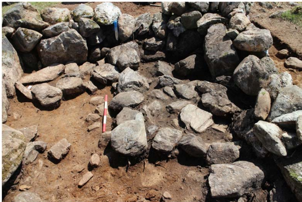
Plate 16: The southern cell, looking south-east, showing hearth 1007 (top left) and structure 1008 (centre right)

5.3.9 Phase 2: at some point, the north-east entrance was blocked ( 1025 ), this being placed upon a foundation layer of silty clay and cobbles ( 1044 ; Fig 16; Plate 17). A wall ( 1014 ) had been constructed across the end of the northern cell, entirely blocking it off, and the surface of the former cross-passage had been relaid ( 1026 ). Dark-brown silt ( 1012 , 1013 and 1023 ), heavily disturbed by bracken rhizomes, had accumulated over the entirety of the interior of the structure, but was much deeper in the northern cell ( 1012 ).