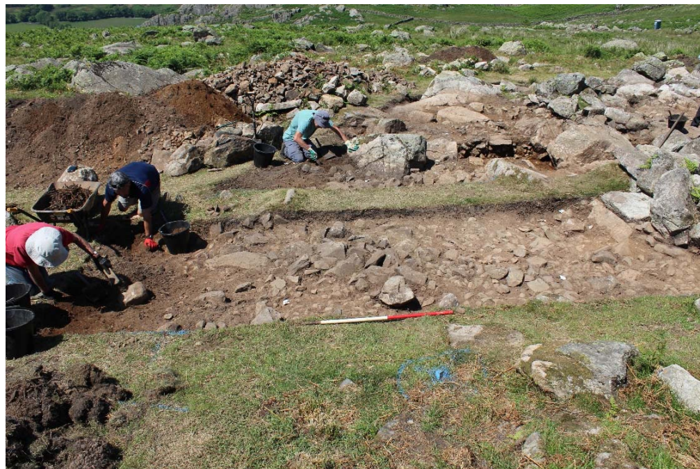
Plate 34: Surfaces 1071 , 1075 and 1076 during excavation (1m scale)