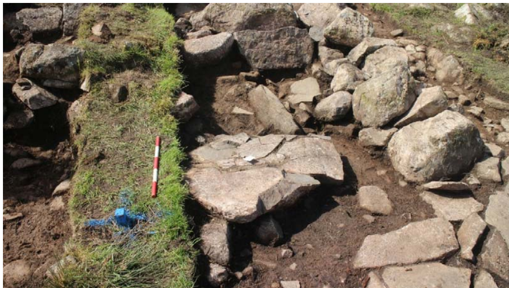
Plate 31: Possible hearth 1020 (0.5m scale)

5.5.21 A number of earlier features and deposits may have been reused in the building. The top of feature 1055 (Section 5.5.8) was still visible, though whether it was utilised is not clear. Apparently prehistoric surfaces 1022 and 1046 were also visible (Section 5.5.12), the building having been constructed directly on top of them. Layer 1046 may have been augmented when the building was constructed, as it was seen to abut wall 1014 , rather than extending underneath it (Plate 32).