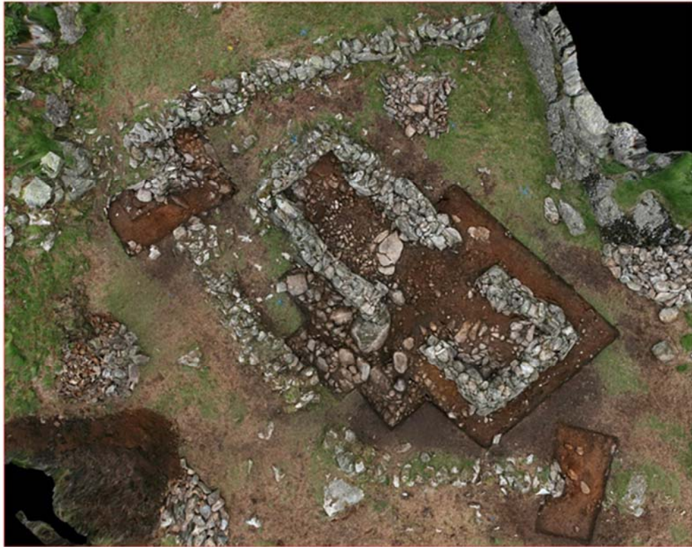
Plate 14: Orthophotographic image of Tongue House A in its earliest form (Phase 1)