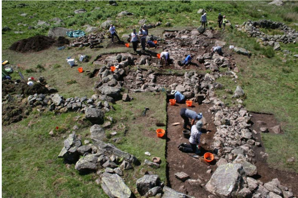
Plate 44: Building 1016 and its surrounding walls (1017) looking west, during the 2017 excavation season

8.3.12 The two walls ( 1017 (walls 1018 and 1019 )) forming the ‘pound’ on either side of this eastern cell of Building 1016 appear to post-date it, enclosing only this uphill portion of the building (Phase 2B). This was a juxtaposition unique in the valley, and, indeed, so far in the Lake District (Matthiessen et al 2015). An interpretation prior to excavation was that these walls were part of an earlier boat-shaped structure, as its shape in plan, with bowed walls, shared superficial similarities to early medieval structures associated with Viking settlement, as, for instance, at the Brough of Birsay in Orkney (Morris 1996, 245). One issue against this was the position of these walls on a fairly steep slope, although some of the structures at Birsay were also on a significant slope. However, excavation demonstrated that the walls were actually not bowed (Fig 22). Comparisons have also been made with a double-walled building at Ennerdale, assumed to be a miner’s hut (Ramm et al 1970, 11, 37), although this structure seems genuinely to have been double-walled, rather than having an outer enclosure, as at Long House Close, and is square rather than rectangular, the outer elements being universally close to the inner, rather than varying in distance, as at Long House Close.