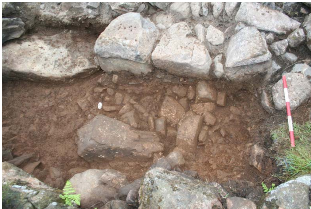
Plate 27: Cobbles 1057 , with kerb 1058 (0.5m scale)