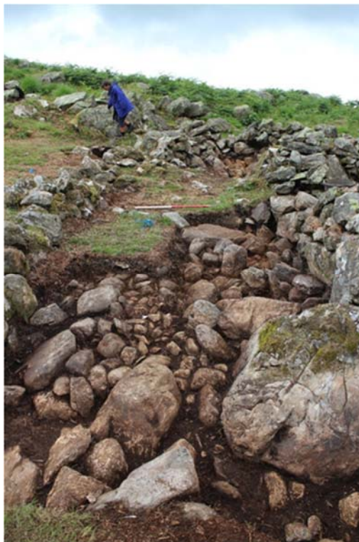
Plate 18: Drain 1047 , looking north-west, next to wall 1018