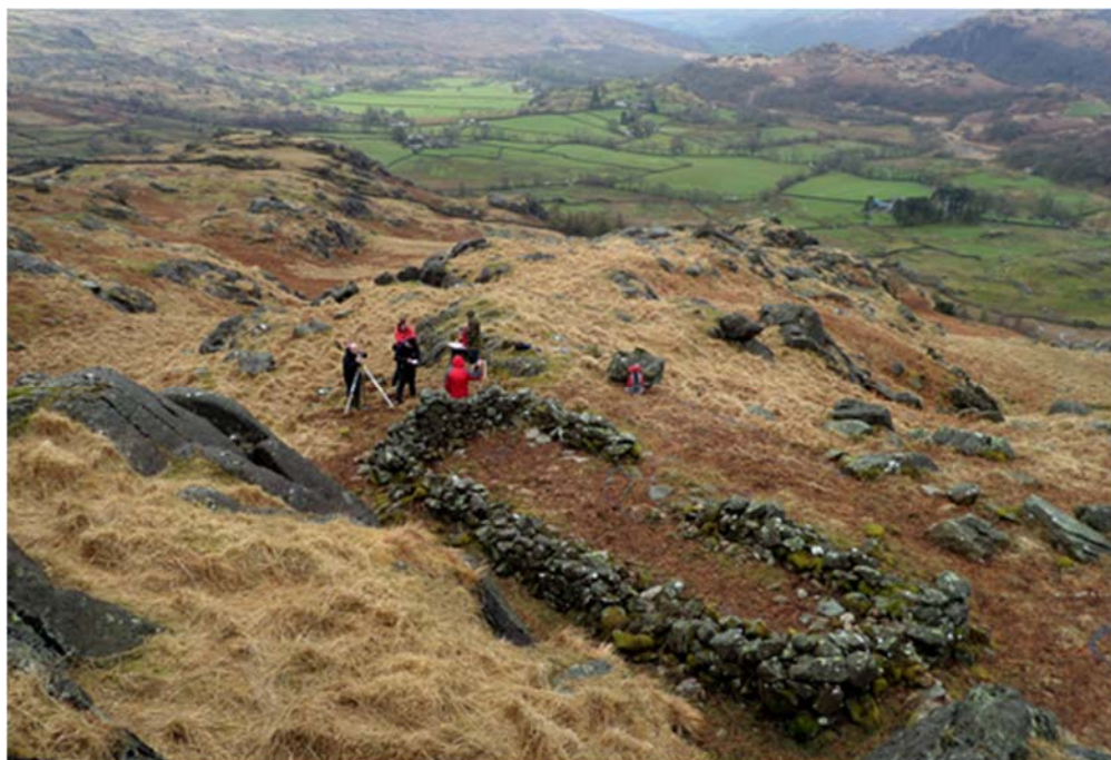
Plate 5: Tongue House B, looking south

3.3.1 The Tongue House B site consisted of the foundations of a single isolated, rectangular structure located in the northern half of the walled intake of Tongue House High Close, at approximately 300m AOD elevation (Plate 5; Fig 2). It was orientated north/south and measured approximately 10.5m long by 4.16m wide, with roughly straight-sided walls, 0.7m wide, surviving up to 0.5m high (Fig 5). The southern gable wall was more pronounced, with well-defined kerbed foundations, and survived up to 0.7m high. The structure stood on a small natural shelf set in the lee of a west-facing crag (1.4m away), within a series of north-east/south-west aligned craggy knolls, which descend down the valley side (Fig 6).