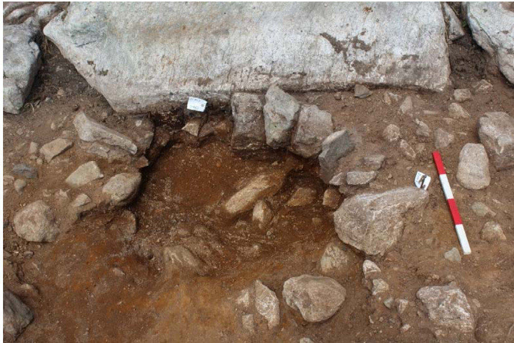
Plate 33: Pit 1087 , with a kerb of pitched stone (0.4m scale)

5.5.23 Pit 1087 had been dug against a large earthfast boulder, immediately beyond the north-west corner of the building, and cut deposits producing both Bronze Age and Iron Age radiocarbon dates ( Section 5.5.11 ). It was sub-circular in shape, 0.9m across and 0.28m deep, and tapered toward the base. The lower fill ( 1086 ; Fig 20) was composed of dark brown-grey sandy silt containing Maloideae charcoal, from which a radiocarbon determination of cal AD 1415-1451 was returned (470±24 BP; SUERC-81431). The upper fill ( 1085 ) contained a similar deposit, and there was a possible kerb of pitched stones marking its outer northern edge (Plate 33).