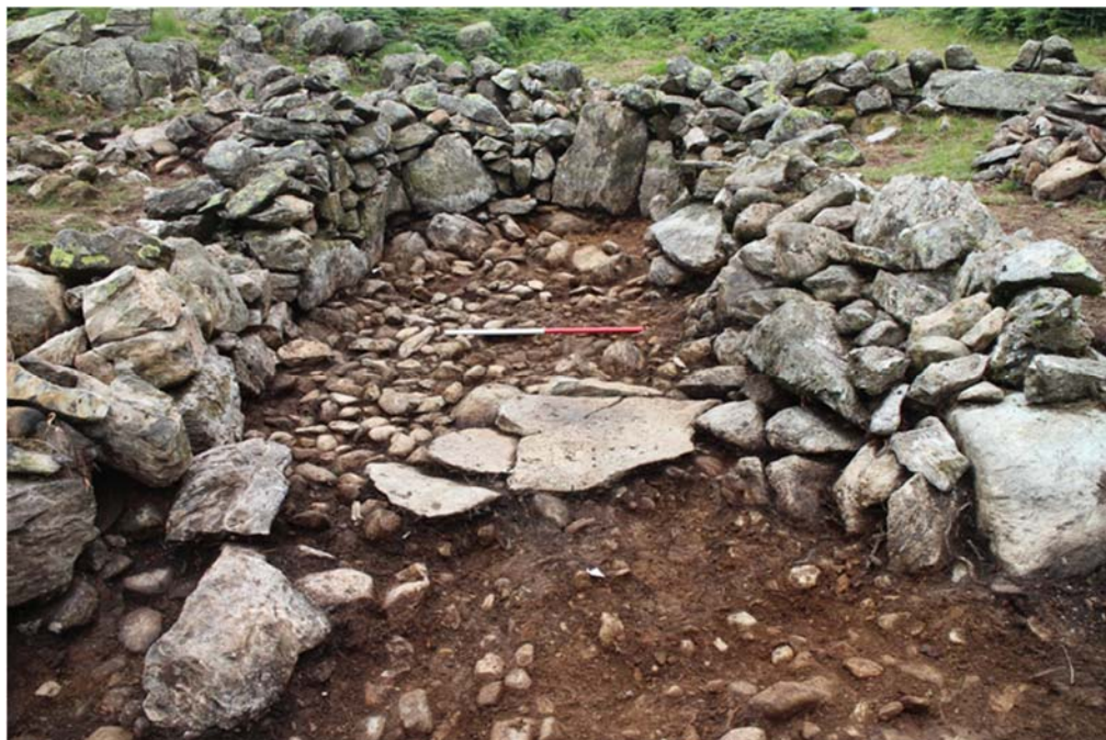
Plate 15: Interior of the structure looking north-west, showing hearth 1006 on surface 1020