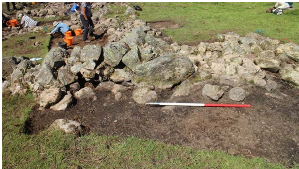
Plate 35: Wall 1041, at the junction with Wall 1072