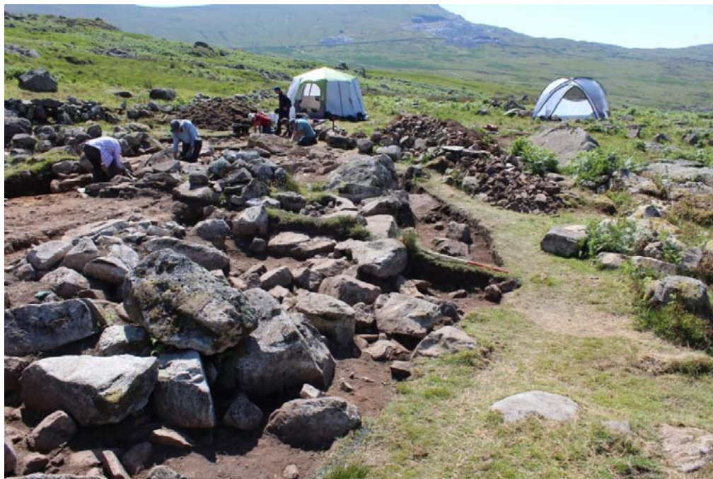
Plate 24: Kerb 1082, with revetment 1034 to the left (1m scale)