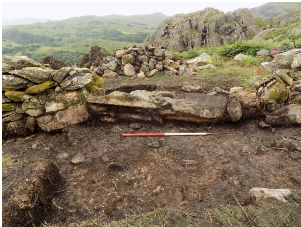
Plate 21: The formerly much broader entrance (later reduced in size) marked by threshold 3007