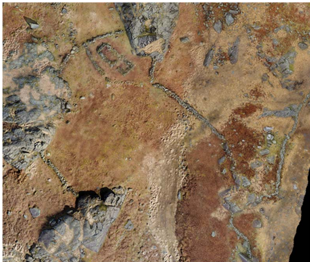
Plate 7: The relict walls associated with the Tongue House A structure

House B is situated approximately 80-100m downslope of the intake wall on the northern end of Tongue House High Close (Fig 2), but there was no direct connection with the field system.