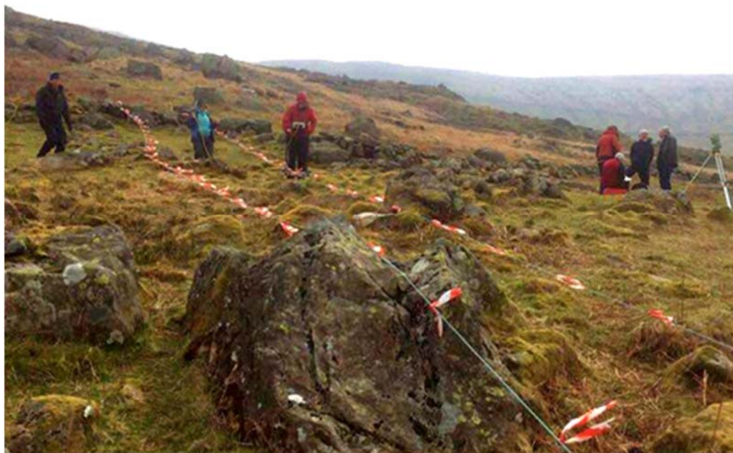
Plate 3: Resistivity survey at Long House Close