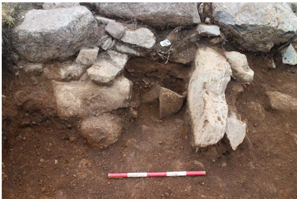
Plate 26: Setting 1055 (0.5m scale)

5.5.9 Also visible in layer 1053 was a discrete feature, approximately 0.75m square, which appeared to comprise an area of fire-affected material ( 1064/1065 ), the burning