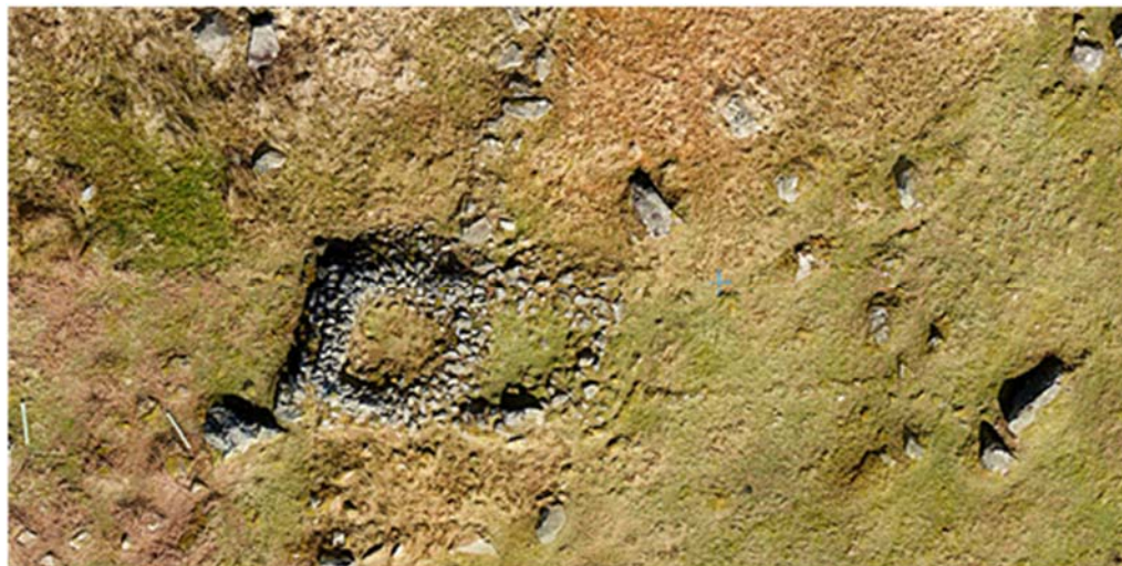
Plate 9: Long House Close Structure 3, with the later field built on top of the western half of the structure

3.5.7 Northern Structure (Site LC4): a slightly irregular, almost pentagonal, enclosure at the northern end of the settlement is relatively small, having external dimensions of 8.6 x 7.3m (internally 5.4 x 3.9m; Fig 9). It is of dry-stone construction and there is substantial tumble associated with the walls (Plate 10); where the walling is relatively complete the wall is c 1m wide. There is a possible entrance to the north-east, facing out from the wider enclosure (Site LC5). The internal surface has the same slope as the natural slope outside, and there is no evidence of any internal terracing. Its function is uncertain; it is unlikely to have accommodated people, because of its shape and lack of terracing. If it was unroofed, then it would not have afforded any better accommodation for stock than the adjacent enclosure (LC5), and in any case was very small. Despite its shape, therefore, it may possibly have had a low sloping roof, in which case it could have provided winter accommodation for limited numbers of stock or, alternatively, may have provided dry storage.