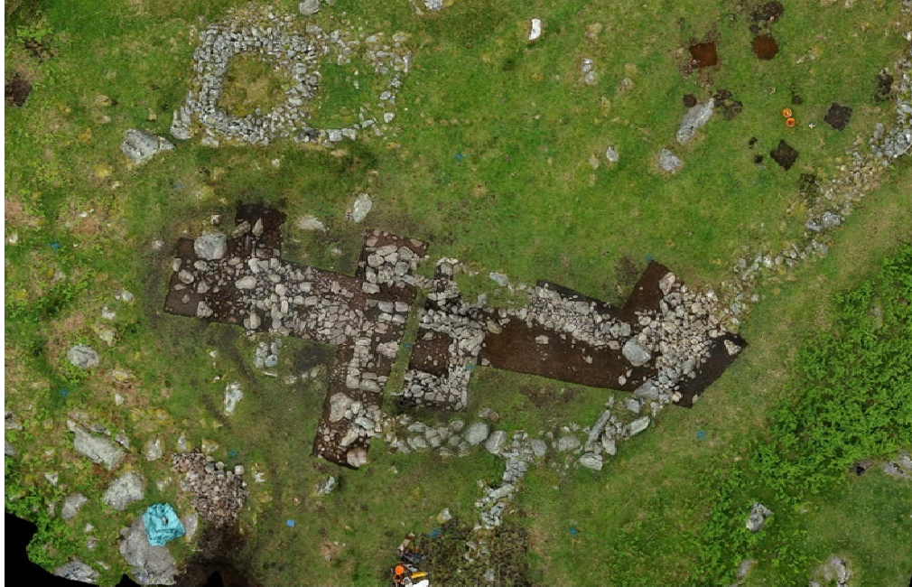
Plate 29: Building 1016, partially enclosed by walls 1019 and 1018, during the 2017 season

5.5.16 Phase 2: the later activity comprises a stone building ( 1016 ), a pit ( 1087 ), and two large walls that partly encircled the building (Plate 29). Both the walls and building were constructed over the prehistoric activity (Fig 22). The precise relationship, and indeed the interpretation of the two outer walls, is imperfectly understood, though there is evidence that Building 1016 was the earlier structure.