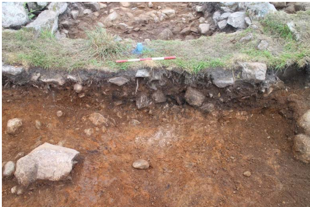
Plate 40: Possible Bronze Age hearth 1060