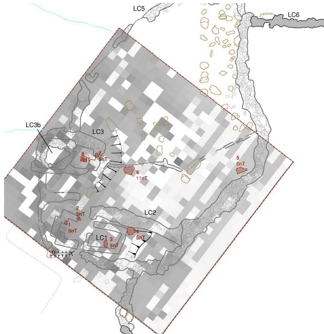
Plate 12: The resistivity plot superimposed on the Long House Close plan