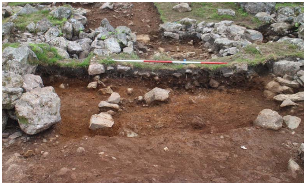
Plate 25: Structure 1052 , looking east (2m scale)

(3090±29 BP; SUERC-74369). Some 2m to the south was 1055 , which comprised an upright stone to the west and two levels of stone to the east, spaced c 0.5m apart; it was open to the north, and was sealed below a later wall (Plate 26).