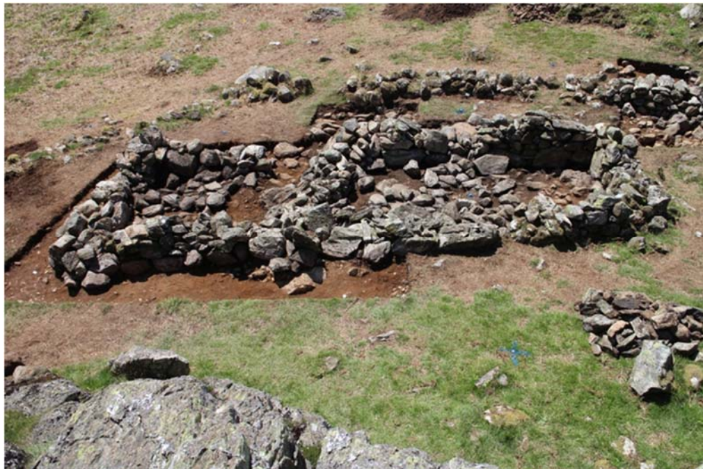
Plate 17: Phase 2, showing the blocked north-eastern entrance (1025) of the cross-passage

5.3.10 Exterior features: the surface of the stone and boulder-filled palaeochannel (1064) appeared to have been adapted and utilised as a very rough yard surface, around the north-west end and the south-west side of the building down to the cross-passage. Several large boulders, in the vicinity of the south-west entrance, appear to have acted as stepping stones across it. Several drains (1047 and 1048) were identified around the exterior of the building. Drain 1047 was a narrow channel, up to 0.4m wide, forming an arc around the north and west sides of the building. It was filled with rounded cobbles, bounded by larger (400-500mm) stones (Plate 18). A second drain (1048) fed into 1047 from the north-east.