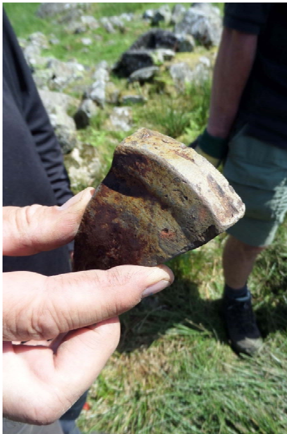
Plate 37: Silverdale ware from deposit 1033

6.4.2 Iron: iron objects were the most numerous, the corpus of ferrous material mainly comprising horse- or pony shoes, nails, fragments of tools, a ring and eye fragment, as well as a small number of unidentified objects (three). The majority of the nine horse- and pony shoes were recovered either from topsoil 1000 or subsoil 1001 at Long House Close. Assessment suggests they are of Clark's late medieval Type 4 (Clark 2004, 88-90), which correlates with Sparkes' Guildhall-or Dove-type shoes (Sparkes 1976, 11-15), dating to the later fourteenth and fifteenth centuries (Clark 2004, 92, fig 74). Sixteen nail fragments were identified, some of which were almost certainly from horse- or pony shoes, at least four coming from demolition deposits (OR 1002, OR 1004, OR 1008 and OR 1010). A nail fragment from deposit 1059 (associated with structure 1052 ; Section 5.5.8 ), may well have been intrusive, as other evidence suggests this may have been a prehistoric feature. Rather, it may have been related to the continuation of wall 1012 , which was built on top of 1052 . A possible blade fragment was recovered from layer 1069 (Building 1016 ). In addition, there were two unidentified fragments of lead.