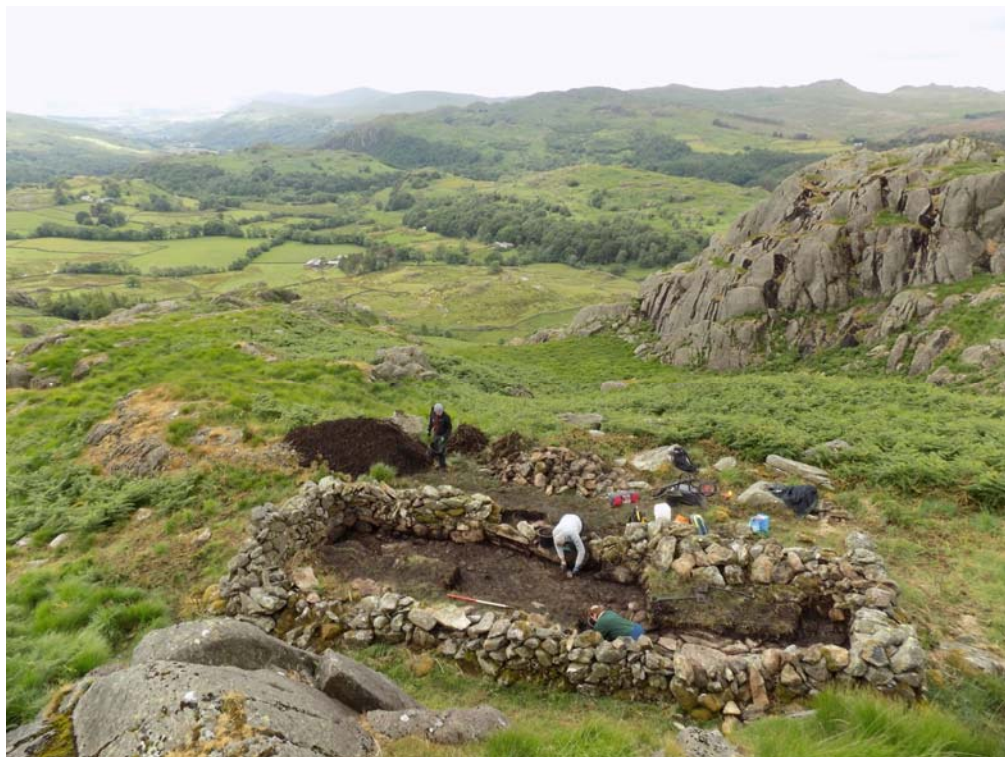
Plate 20: Tongue House B during excavation, on a natural shelf overlooking the valley