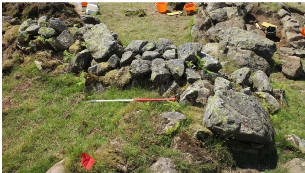
Plate 36: The possible blocked entrance in field wall 1042

5.5.32 The excavation evidence seems to reinforce the survey evidence that wall 1041 , and possibly 1018 , were enhanced and rebuilt sections of former field wall, of which 1072 was an undisturbed section. Wall 1019 also seemingly post-dated wall 1072 . Given that there is no direct relationship between 1018 and 1019 , and that they had very different construction techniques, it is possible to suggest that they were not contemporary, but it is not possible to demonstrate stratigraphically which was the earlier.