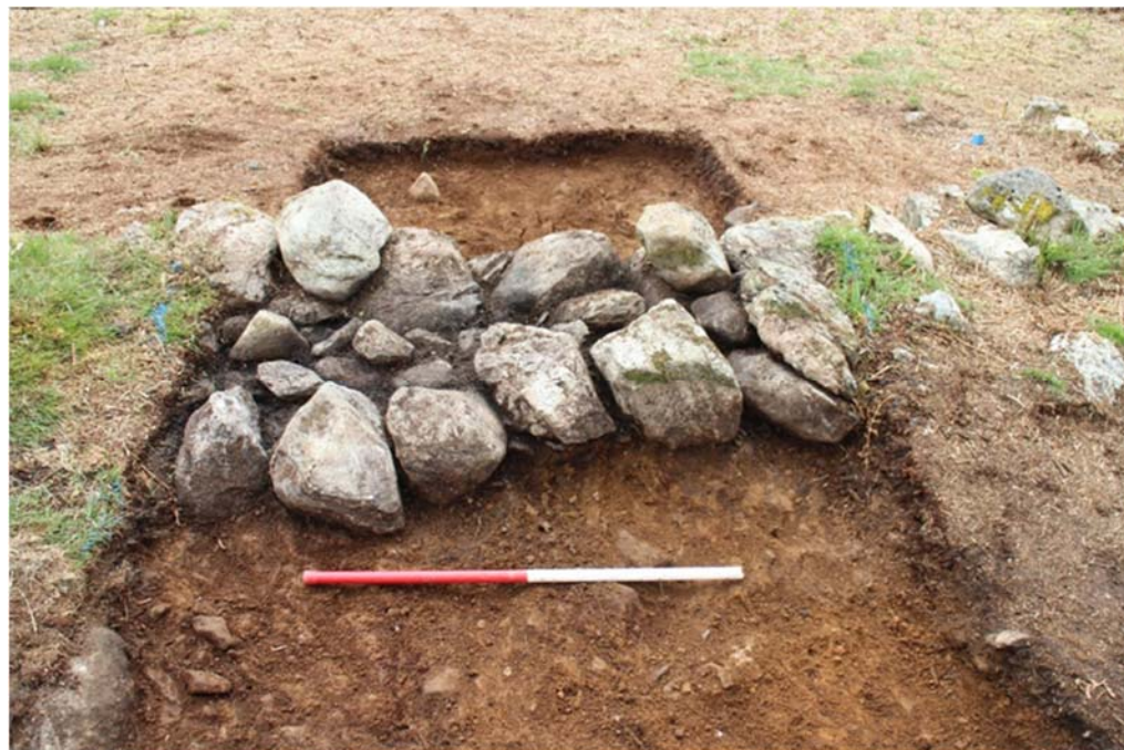
Plate 19: Enclosure wall 3002 , immediately south of Tongue House A, showing the typical construction technique

5.3.14 This enclosure was itself part of a larger group of enclosures associated with the house site ( Section 3.3 ; Fig 2), occupying the northern corner of a larger, approximately north-west/south-east-aligned enclosure that opened onto a marshy area at the base of the slope. The enclosure comprised north-west/south-east-aligned wall 1066 , which extended from the 'V' formed by walls 1065 and 3002 . Wall 1061 to the north terminated at the outcrop of rock, but continued south-west as wall 1067 . A large outcrop of rock also formed a natural barrier to the south-west of the house, with small areas of wall blocking any obvious gaps, whilst wall 4002 , aligned north-west/south-east, sealed a gap between this outcrop and its neighbour, some 15m to the south-east.