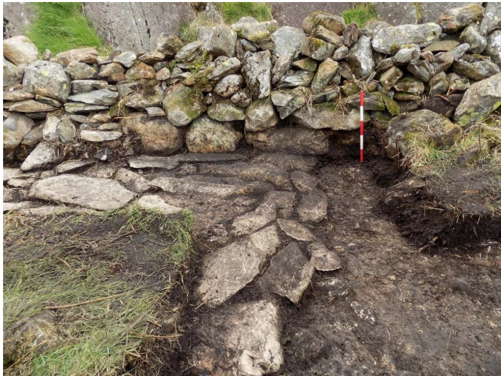
Plate 22: East wall of Tongue House B, showing a lower course of larger stones, with the upper courses being less well constructed