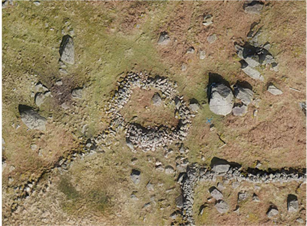
Plate 10: Aerial view of the northern structure (LC4)

3.5.8 Settlement Enclosure (Site LC5): a decayed wall foundation forms an irregularly shaped enclosure, linking LC4 with the structures (LC1, LC3) to the south (Fig 9; Plate 11). The wall butts against each of the component features and was evidently a later feature. For the most part, it is low-lying, containing relatively small amounts of stone and, as such, would not have, by itself, been able to control stock; it is probable therefore that this was augmented by a fence or similar structure. The eastern part of the enclosure has been overlain by a field-boundary wall (Site LC6), which is far more substantial and would have been able to contain stock. There is, however, a short, insubstantial section of the original wall extending between the corner of field wall LC6 and LC4 (Plate 10). There is also a low, narrow, bank that extends between south-western structure LC3 and the eastern wall of the enclosure, effectively dividing the space, although unevenly. The western wall extends through an area of poorly drained ground, which indicates that this enclosure was an afterthought, since if the enclosure was the primary feature and the structures secondary, then the enclosure would logically have been moved a small distance upwards onto better-drained ground.