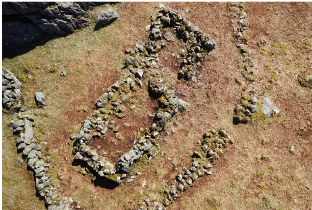
Plate 4: Tongue House A prior to the excavation, looking south-east

3.2.1 The Tongue House A structure was revealed as a north-west/south-east-aligned building, 10.45m long by a maximum of 4m across (Fig 3; Plate 4). At the time of survey, it was observed to be a two-celled structure with a single entrance in the south-western wall, and a cross wall which extended at a slightly diagonal angle through the building, with the larger cell, making up two-thirds of the building, to the north-west. The entrance to the building led into the smaller, south-eastern, cell, which was at the lower end of the slope on which it stands. This was thought potentially to be the remains of a shieling.