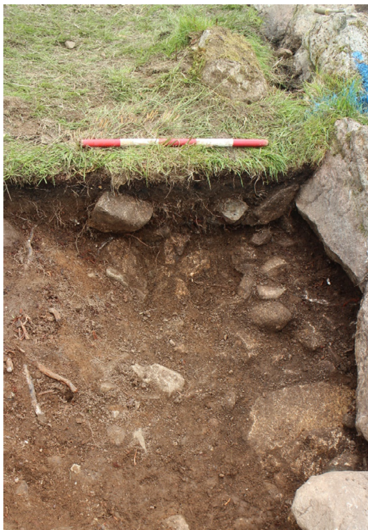
Plate 23: Cut 1099 (0.5m scale), dropping to the west (right)

could be seen at its eastern edge ( 1099 ), where the prevailing slope had been artificially steepened (Plate 23). To the west, the turf had been removed down to the underlying natural substrate ( 1040 ), in an area extending some 8.3m from cut 1099 . To counter the gradient at the western end of the trench, as the ground fell by 1.3m over a distance of 6m, the revetment comprised, firstly, a layer of brownish-orange silt ( 1049 ) lying above the natural substrate, which contained charcoal flecks and a fragment of iron (OR 1007), which was felt to be intrusive. This deposit was perhaps used to level the area.