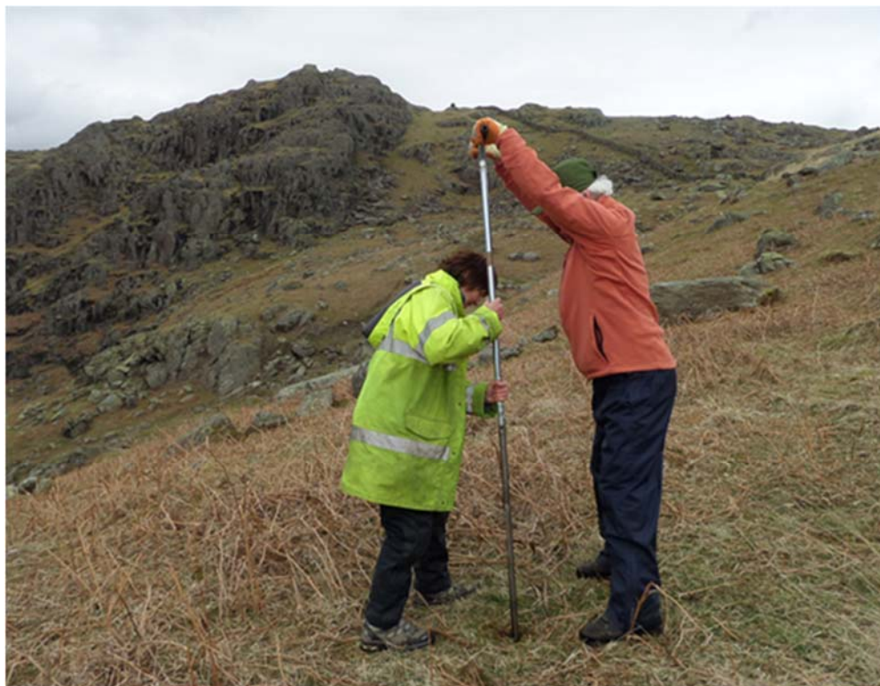
Plate 38: Coring with a gouge auger near Tongue House B

7.2.1 A reconnaissance survey, using a gouge auger, was undertaken of boggy areas adjacent to the three sites (Plate 38). The objective was to establish the presence, or otherwise, of organic-rich sediments adjacent to the structures and, if possible, to collect samples for palaeobotanical assessment. It was hoped that this work might shed light on the local environment at the time of occupation of the sites. Following this survey, two of the sites (Palaeo-Sites 2 and 3) were selected for sample collection using a Russian corer.