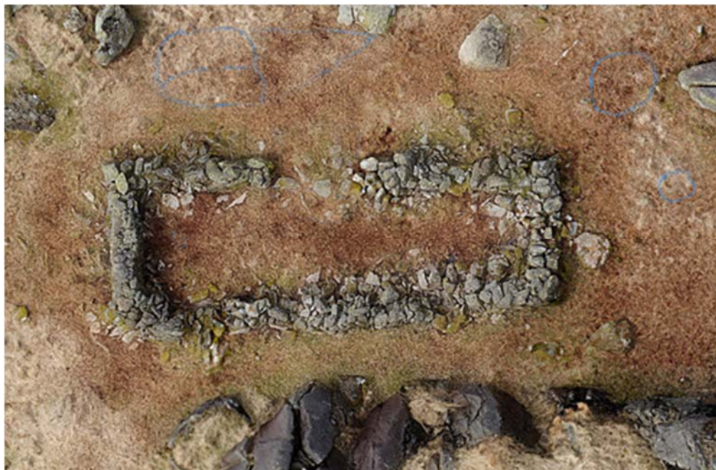
Plate 6: Vertical orthophotographic image of the Tongue House B structure