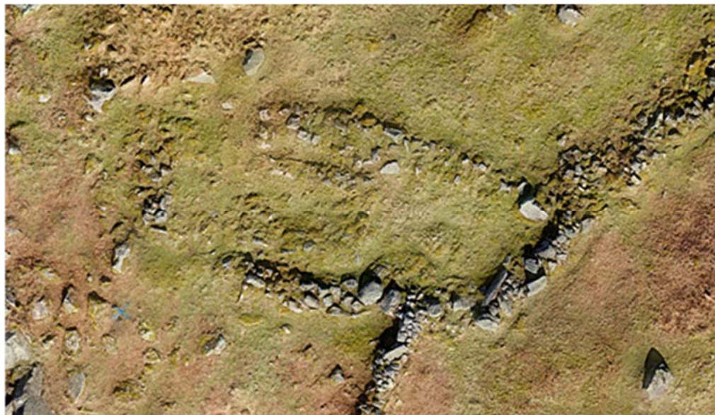
Plate 8: Long House Close Structure 1, partially surrounded by the 'pound'