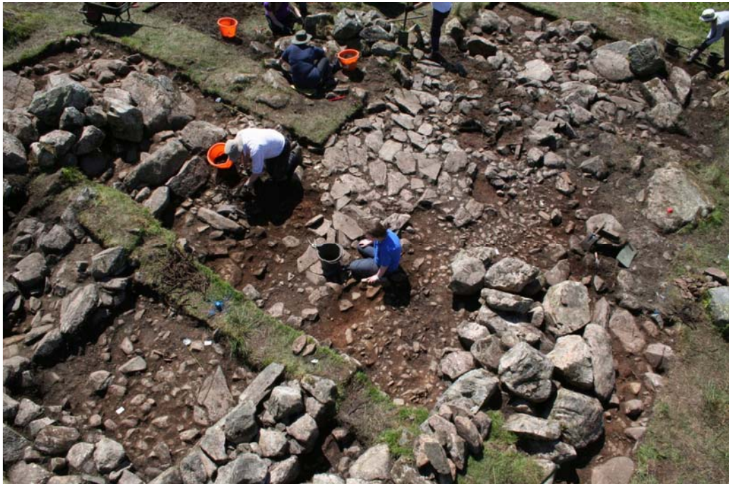
Plate 30: Stone surface 1025 during excavation