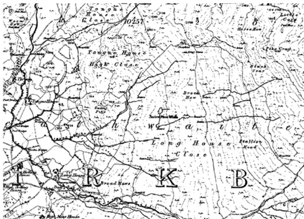
Plate 1: OS First Edition 1:10,560 map, 1850

1.4.10 OS 1st edition OS map, 1:10,560, 1850: the mapping of the mid-nineteenth century is important, as field patterns and upland pasture shown on these (Plate 1) may have been similar to, or derived from, field patterns of the earlier centuries. The 1850 OS map showed the farms at Long House and Tongue House and the pattern of small irregular fields, or inbyes, clustered around the farm buildings. Sunny Pike Gill flowed between the two farms and this may have acted as the boundary between them. Five crossing points are marked over the stream between the two farms, perhaps an indicator of the need for communication, and there was a footpath connecting them.