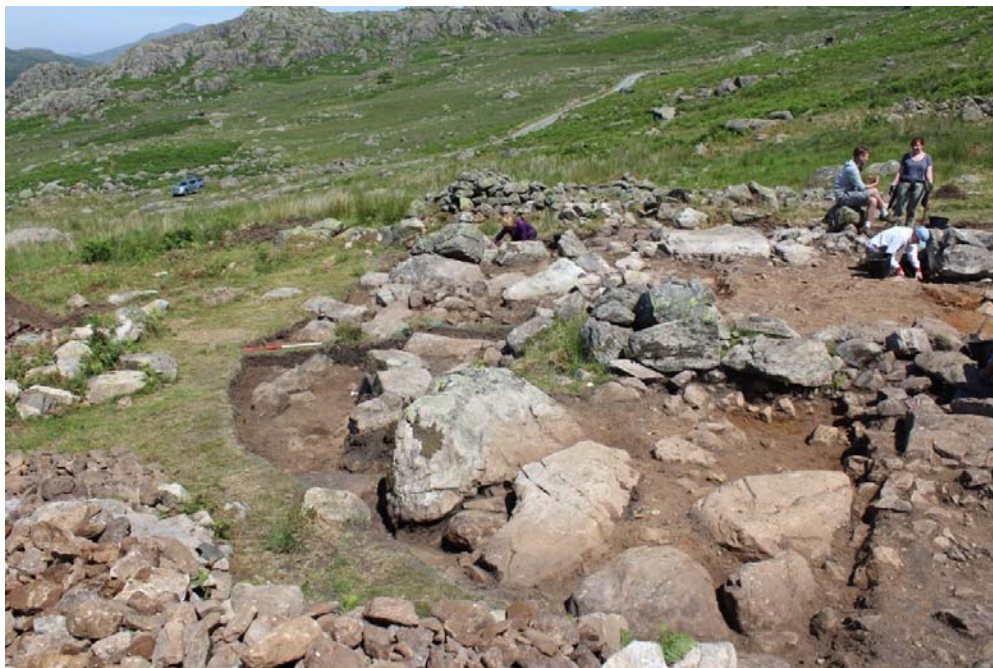
Plate 39: The kerb (1082) forming the western end of the Bronze Age platform (right; 1m scale)

8.2.4 A possible hearth was recognised above the earliest of these surfaces ( 1053 ; dated to 1390-1130 cal BC; Appendix 6.3 ), visible as an area of reddened material, associated with two enigmatic stone configurations ( 1055 and 1052 ). The upper surface was cut by a second possible hearth ( 1060 ), which provided a date of 1406-1135 cal BC (3035±34 BP; SUERC-75307; Plate 40). However, the lack of burning associated with this second feature might mean that it was no more than an accumulation of charcoal in a shallow depression. Similar activity has been recorded below a Bronze Age cairn at Barnscar, south-west of Devoke Water (Johnston 2001, 104-5). At that site, pits less than 0.5m across and 0.2-0.4m deep were found below the cairn itself, and filled with what was described as loam, charcoal fragments and partially burnt stones.