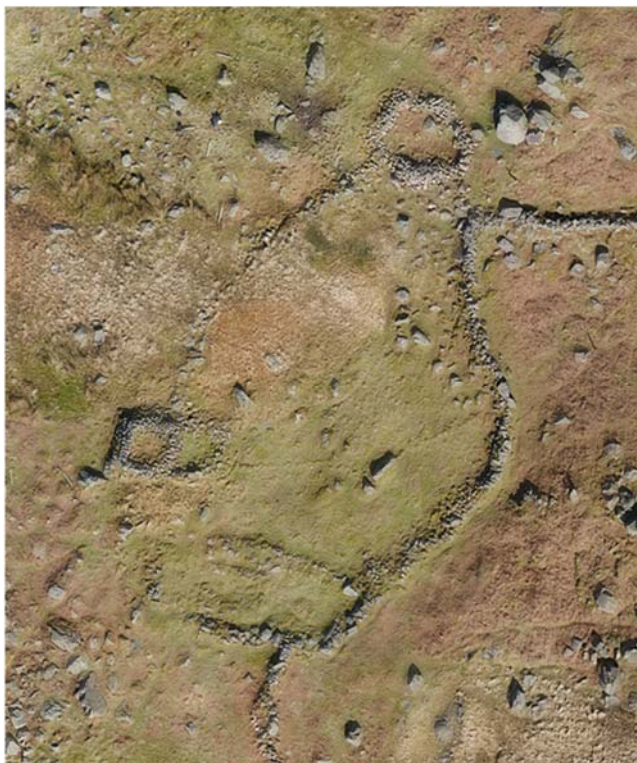
Plate 11: The enclosure (Site LC5), linking the individual structures and the field wall to the east