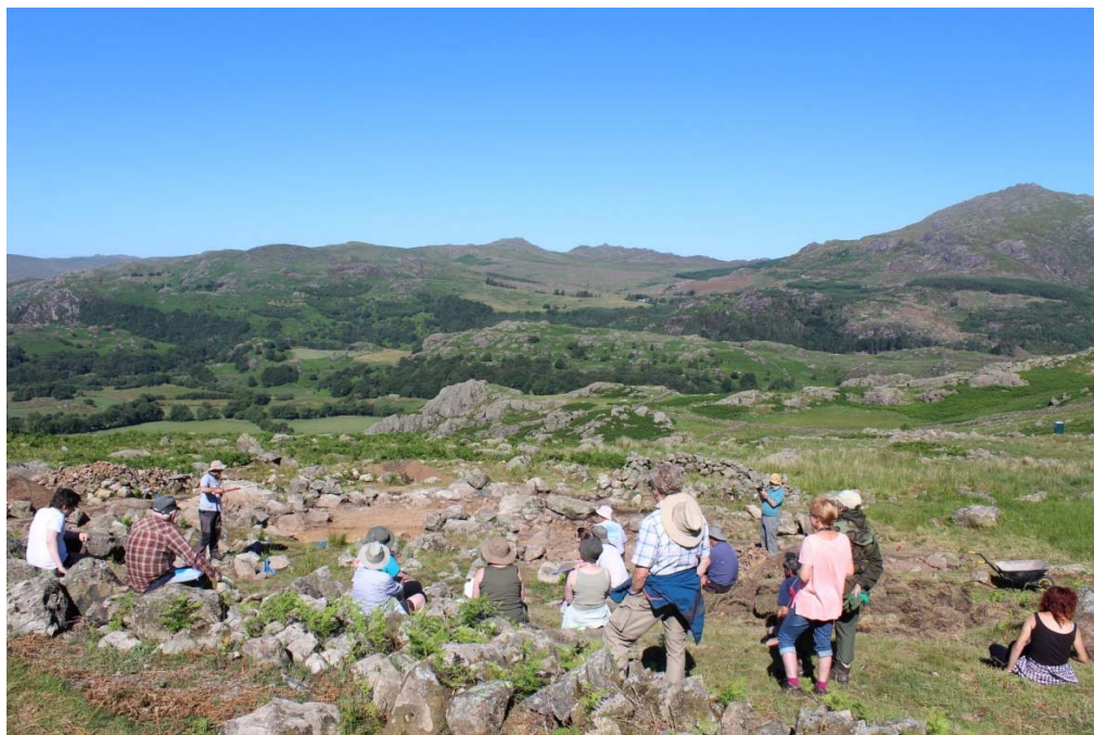
Plate 41: Long House Close from beyond the eastern enclosure wall, with Harter Fell on the right

8.2.13 An aspect of the pattern of Bronze Age sites in the Lake District is a clear awareness of the landscape, particularly in the siting of funerary monuments, such as the ring cairns at Seathwaite Tarn, on high summits (Evans 2008a,79). Combined with this is the idea that such sites are on natural routeways between areas of low and high ground, and may be connected with activities such as transhumance ( ibid ; Plate 41). Ultimately, these routeways, with their connections to water, in this case the River Duddon and its estuary, may have been a way that particular groups of people identified themselves with particular rivers ( op cit , 79, 97, 99). The connection between the local communities that inhabited the area, and may have visited the cairns, as well as seasonal occupation and transhumance regimes, may be an expression of their long-term connection with the locale ( op cit , 99).