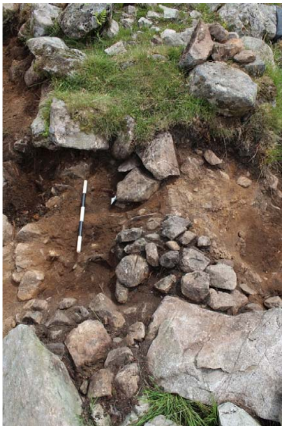
Plate 28: Stony deposit 1079 (0.5m scale), underlying wall 1018