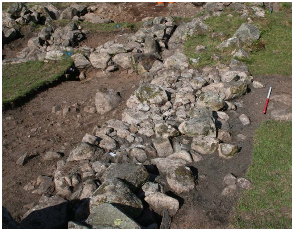
Plate 45: Wall 2019, showing the construction technique