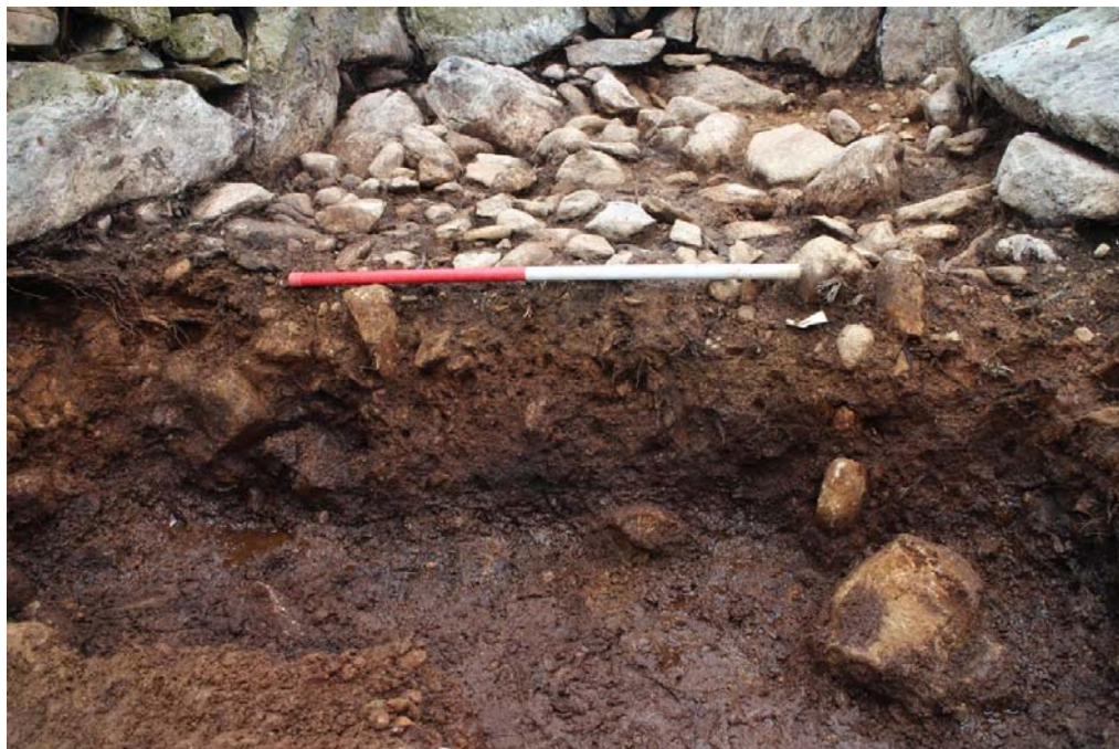
Plate 13: Possible palaeochannel 1063 below Tongue House A