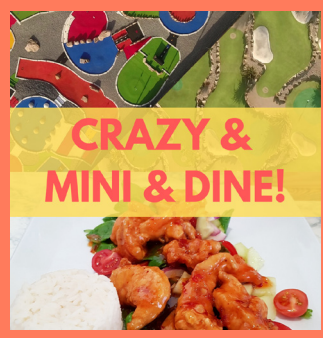
CRAZY, MINI GOLF & DINE