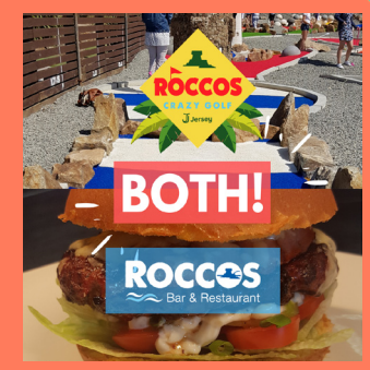
CRAZY GOLF & FAVOURITES MENU