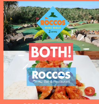
MINI GOLF & FAVOURITES MENU