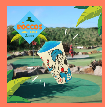
MINI GOLF & FREE SLUSH PUPPIE