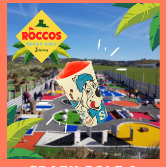
CRAZY GOLF & FREE SLUSH PUPPIE

FOR PRICES ON ALL PACKAGES AS WELL AS ACTIVITY PRICES PER PERSON, PLEASE VISIT OUR WEBSITEI