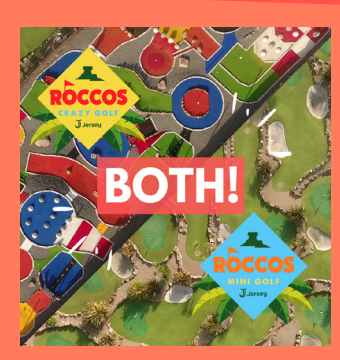
CRAZY GOLF & MINI GOLF