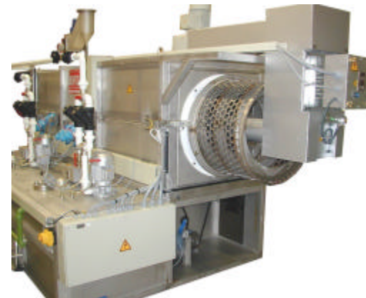
Drum discharge side

The construction and the process meet most stringent requirements to assure a nonstop production for washing / degreasing by spraying water and detergent added to a high efficiency pulsed hot air drying.