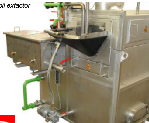
Drum inlet side