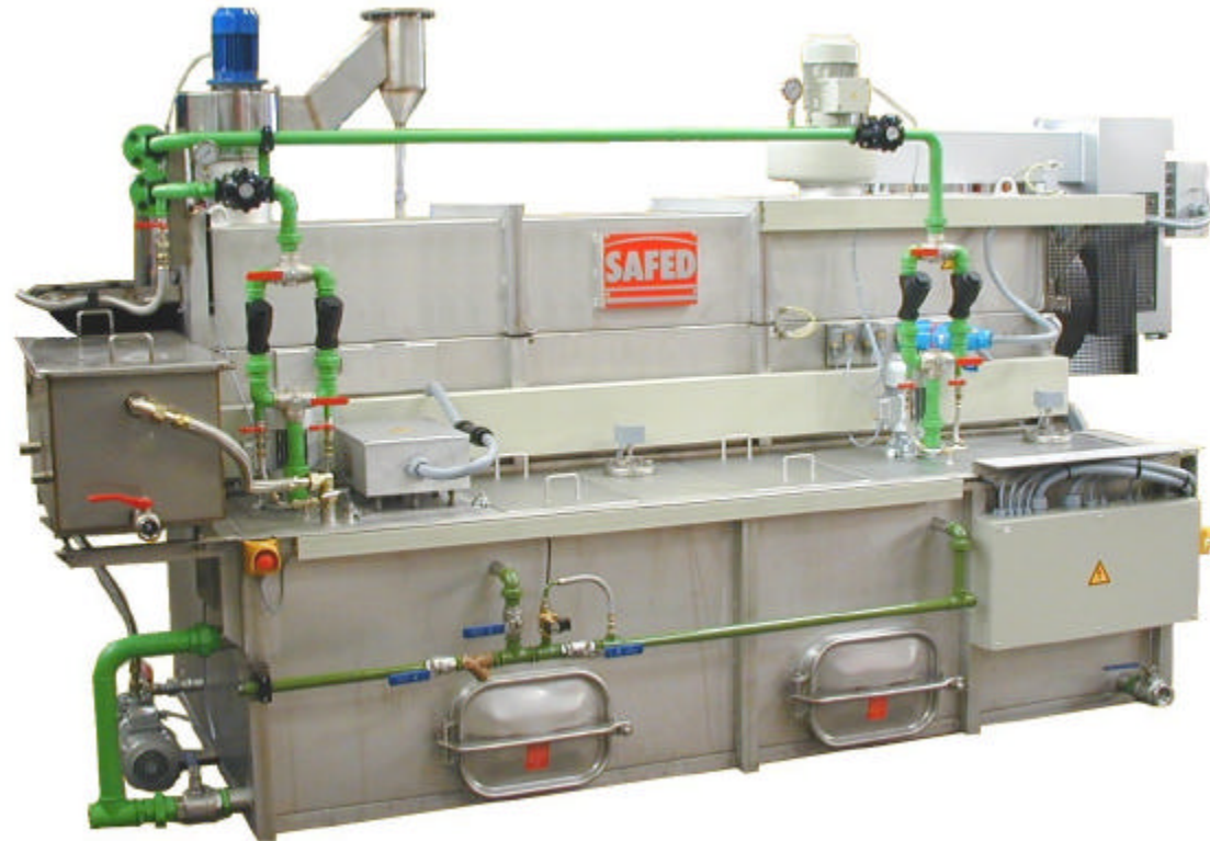
Static oil extractor S3P

The optimized design and the precise and careful manufacturing rotary of the drum guarantees an optimal stirring of the parts in the different machine zones. This assures a high efficiency drying for flat parts and for parts with liquid retention shapes.