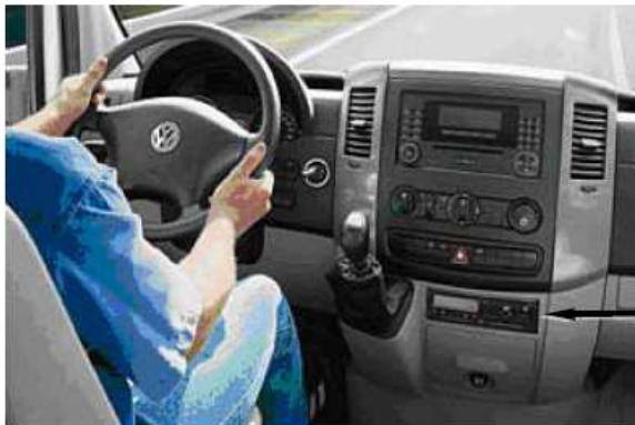
Installation in the shelf compartment