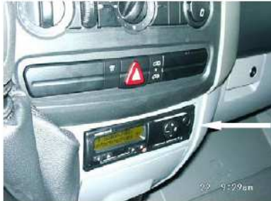
Second radio compartment