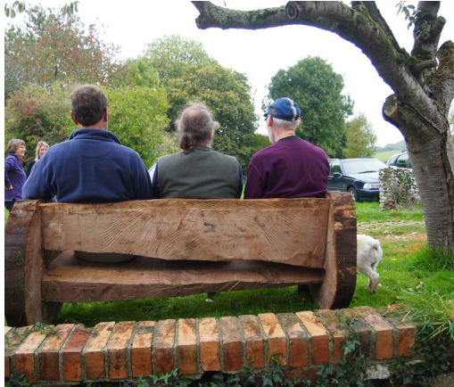
A couple of new places to sit