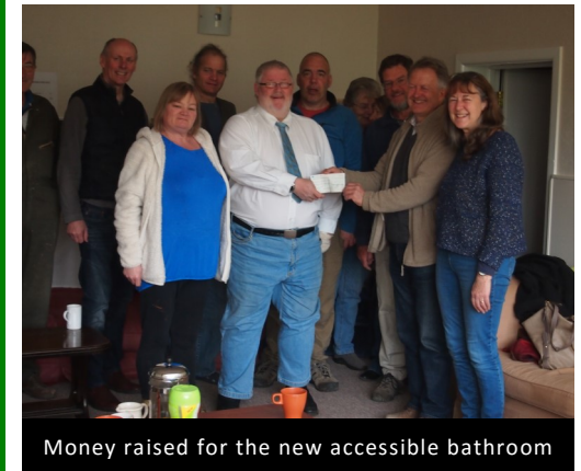
Money raised for the new accessible bathroom

Thank you to all our many financial supporters who generously give to make our work possible. As you can see from the previous page there has been much generosity.