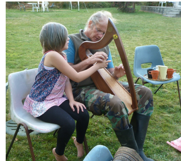
Enjoying making music in the garden