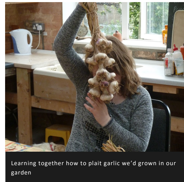
Learning together how to plait garlic we'd grown in our garden

- from a single mum with three children one of whom is much older than the other two