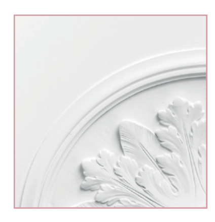
Excellent for use during render applications