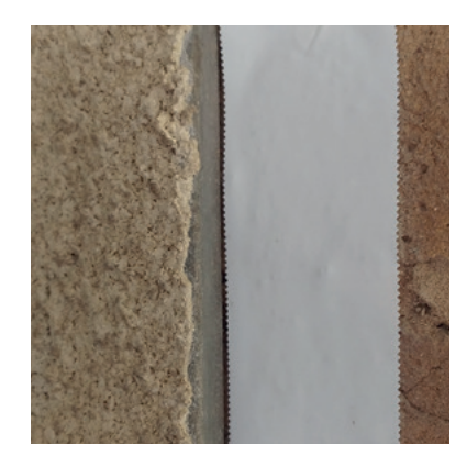
Waterproof with a good hold on brick surfaces