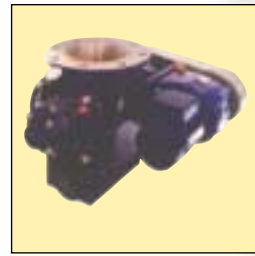
Rotary BS Series