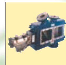
Diverter DBS Series