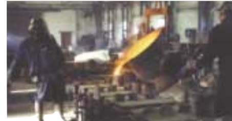
Molten iron being poured into a Diverter Valve's sand mould.

Also in the 1950's involvement with local industries, particularly the tobacco factory, brought its initial involvement into Bulk Handling in which it eventually focused and flourished.