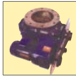
Rotary IF Series