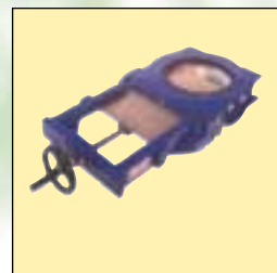
Slide SBS Series