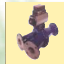
Diverter DMF Series