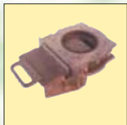
Slide SBM Series