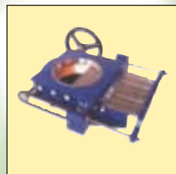
Slide SBC Series