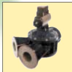
Diverter DP Series