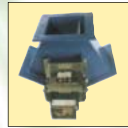
Diverter DG Series