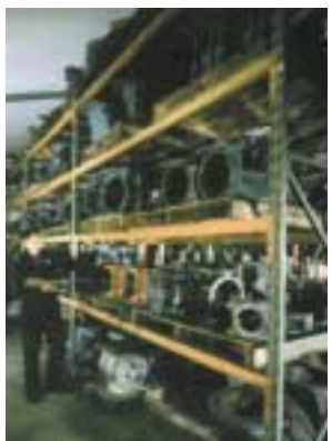
Stock control enables emergency items to be rapidly dispatched.

Bush & Wilton, 200 years of experience enabling us to face a future full of change.