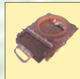
Slide RBTC Series