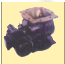
Rotary SRD Series