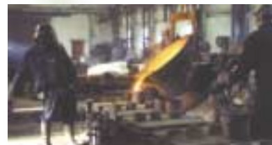
Molten iron being poured into a Diverter Valve's mould.