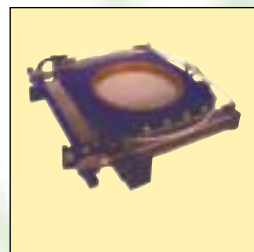
Slide SBT Series