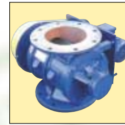
Rotary IF'U' Series