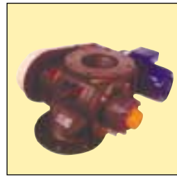
Rotary OF Series