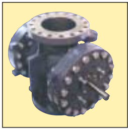
Rotary High Pressure Series