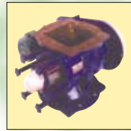
Rotary SRD Series