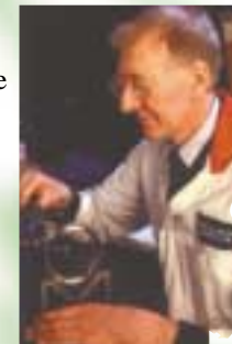
Each valve component must pass stringent quality controls.