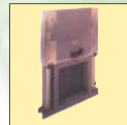
Slide FB Series