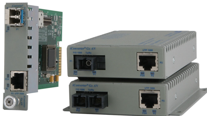
SFP not included

The iConverter Multi-Service Platform consists of Network Interface Devices, T1/E1 multiplexers, CWDM multiplexers and managed media converters that combine to deliver Carrier Ethernet and TDM services over fiber or CWDM wavelengths. This flexible architecture supports a wide variety of configurations for scalable and reliable fiber connectivity in Service Provider and Enterprise networks.