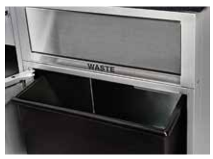
STAINLESS WASTE FLAP Easy to clean. Handles heavy use. Waste cans are sized for the cabinet.