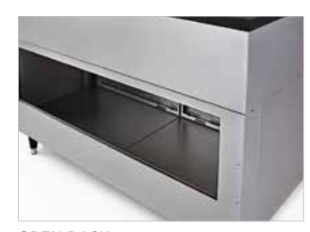
OPEN BACK Easy access to wiring or plumbing.

At Royston, our cabinets are engineered and built for simple installation, easy maintenance and durable, problem-free performance. As your store evolves, they can be easily reconfigured for new layouts. We've helped some customers repurpose the same cabinets for several different store layouts over a 20-year span. That's the meaning of "built to last."