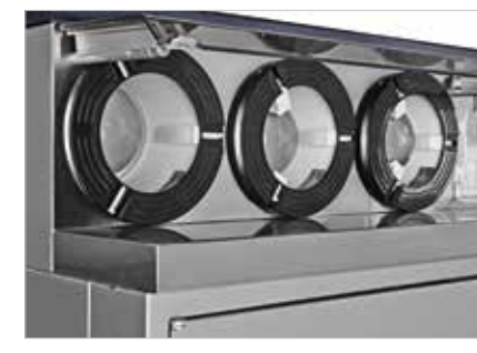
CUP DISPENSER Adjusts for a wide range of cup sizes, without tools or adapters.