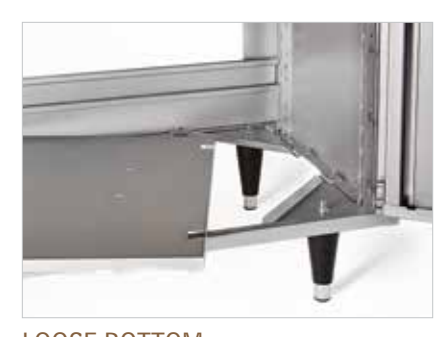
LOOSE BOTTOM Removable for easy access to plumbing and electrical.

At Royston, our cabinets are engineered and built for simple installation, easy maintenance and durable, problem-free performance. As your store evolves, they can be easily reconfigured for new layouts. We've helped some customers repurpose the same cabinets for several different store layouts over a 20-year span. That's the meaning of "built to last."