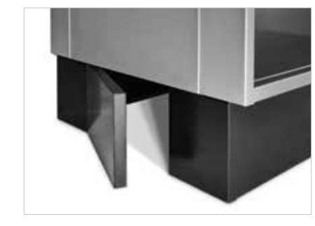
BASE UTILITY CHASE Easily route wiring or plumbing at installation or later.