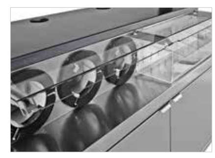
CUP AND CONDIMENT COVER Protects cups and condiments from spills.