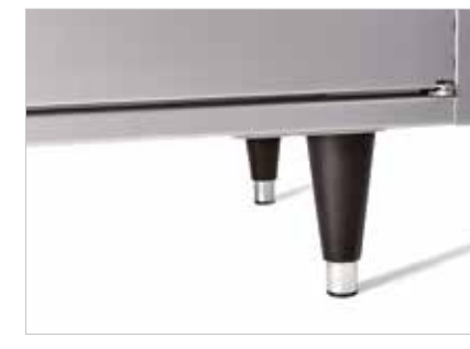
LEG BASE Attractive legs for your cabinet base.