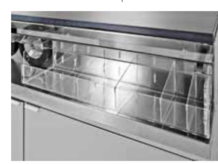
CONDIMENT TRAYS Organize lids, straws and condiments.