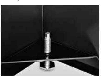
BUILT-IN LEVELER Easy access for leveling.