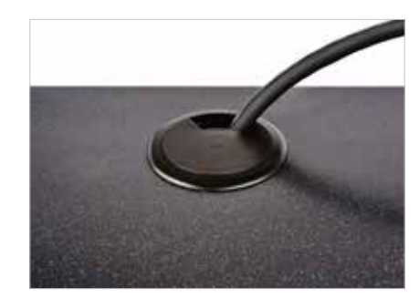
COUNTERTOP PENETRATIONS Run cords or fountain syrup lines.