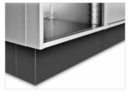
FIXED BASE Covers utilities under the cabinet.