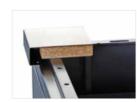
NSF OFFSET EDGE Prevents liquid from running inside the cabinet.