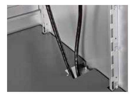
SHELF CUTOUTS No cutting necessary to route cords or fountain syrup lines.